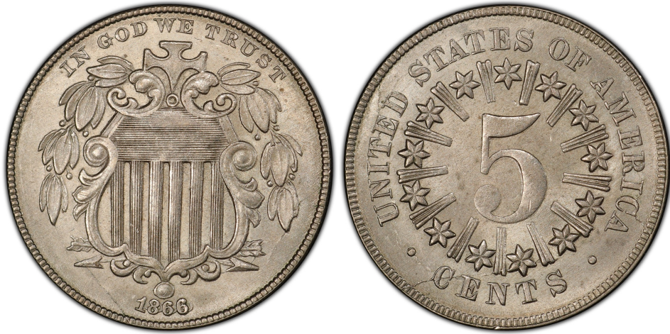
WITH RAYS BETWEEN THE STARS