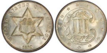
THREE CENT SILVER