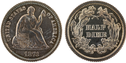
SILVER HALF DIME