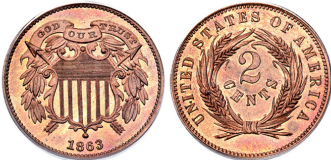
TWO CENT PIECE