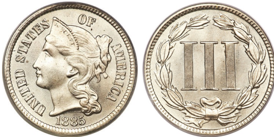
THREE CENT NICKEL