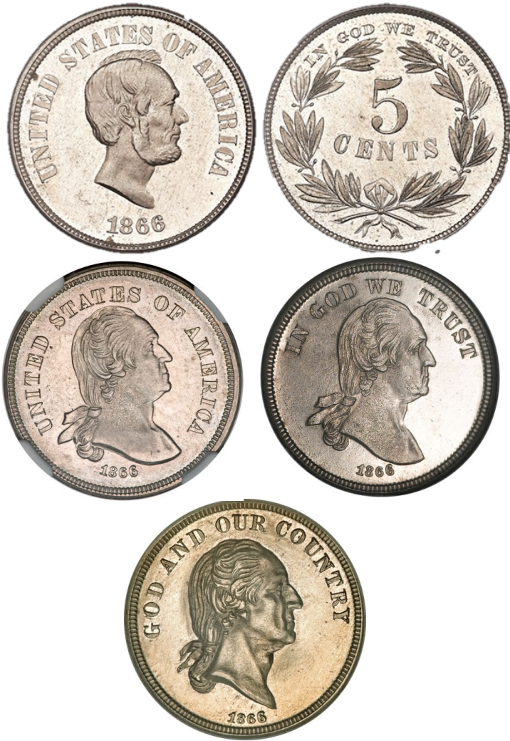
SAMPLE DESIGNS CONSIDERED FOR 1 ST NICKEL