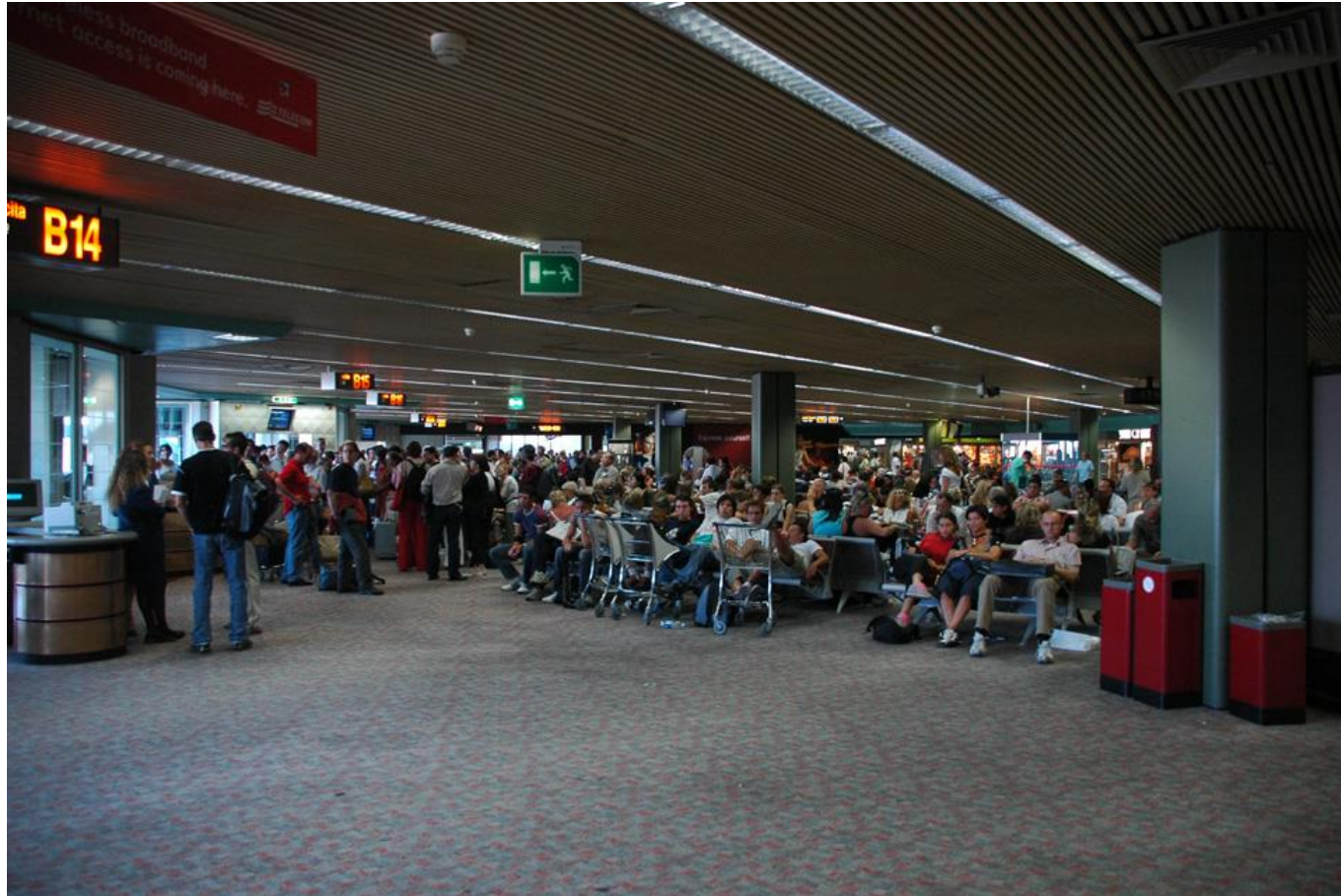
FCO Rome Fiumicino Airport – crowded waiting area at the peak of the holiday season.