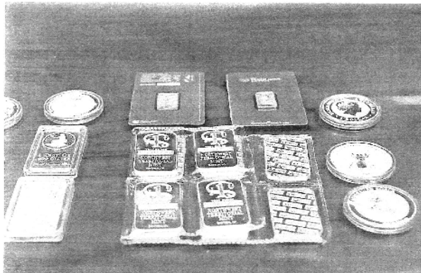
Anyone who recently purchased coins or bars that look like the ones pictured should have them tested. Buyers who have been swindled should call their local law enforcement agency.