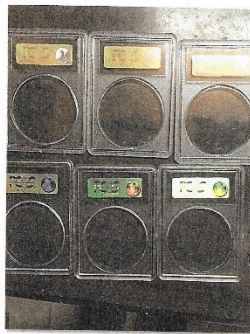
“Starter kit” from Chinese online distributor offers counterfeit PCGS holders complete with fake grading labels. All images from AliExpress.com website.

The fee increases with the value of the coin under review, and shortened turnaround times are also priced higher at the level of service purchased. ©