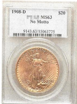
Obverse of a counterfeit 1908-D Saint-Gaudens double eagle of gold for $96.82 postpaid encapsulated in a fake PCGS holder with fake grading label insert. The fake coin is 24-karat gold plated over .900 fine silver, according to the seller.

Not only are coins being counterfeited, but the grading services holders are also!