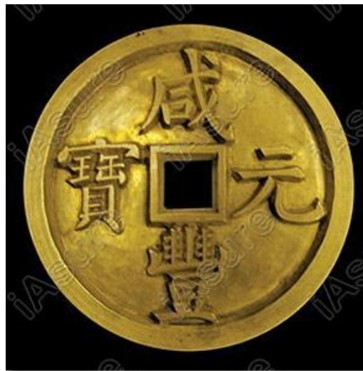
1854 Chinese 1000 Cash Coin