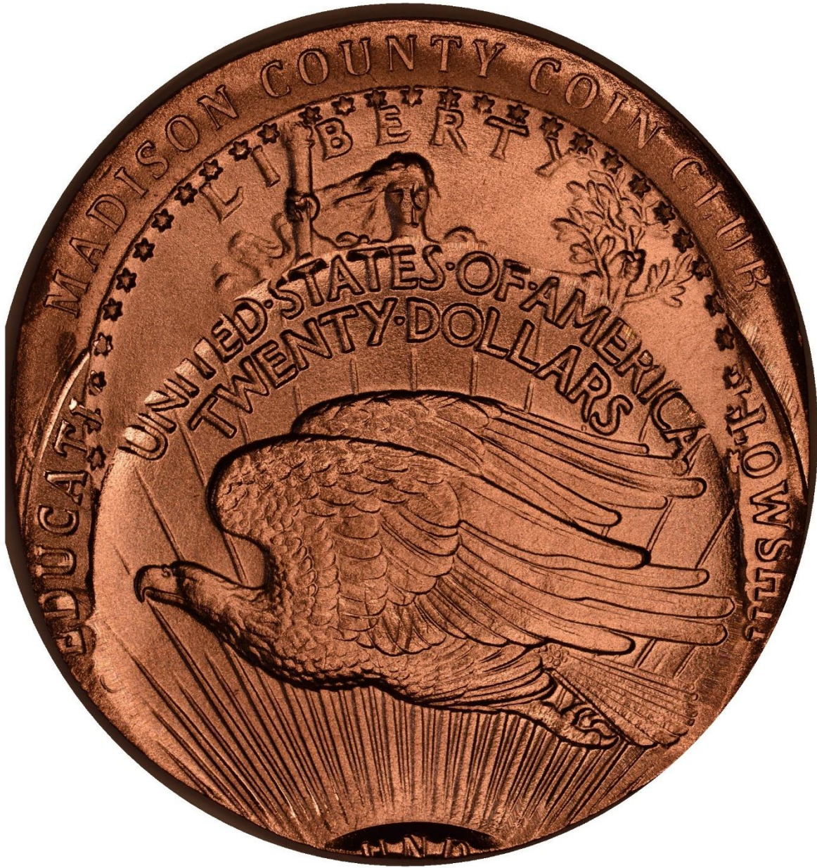
The obverse of the second flip over.