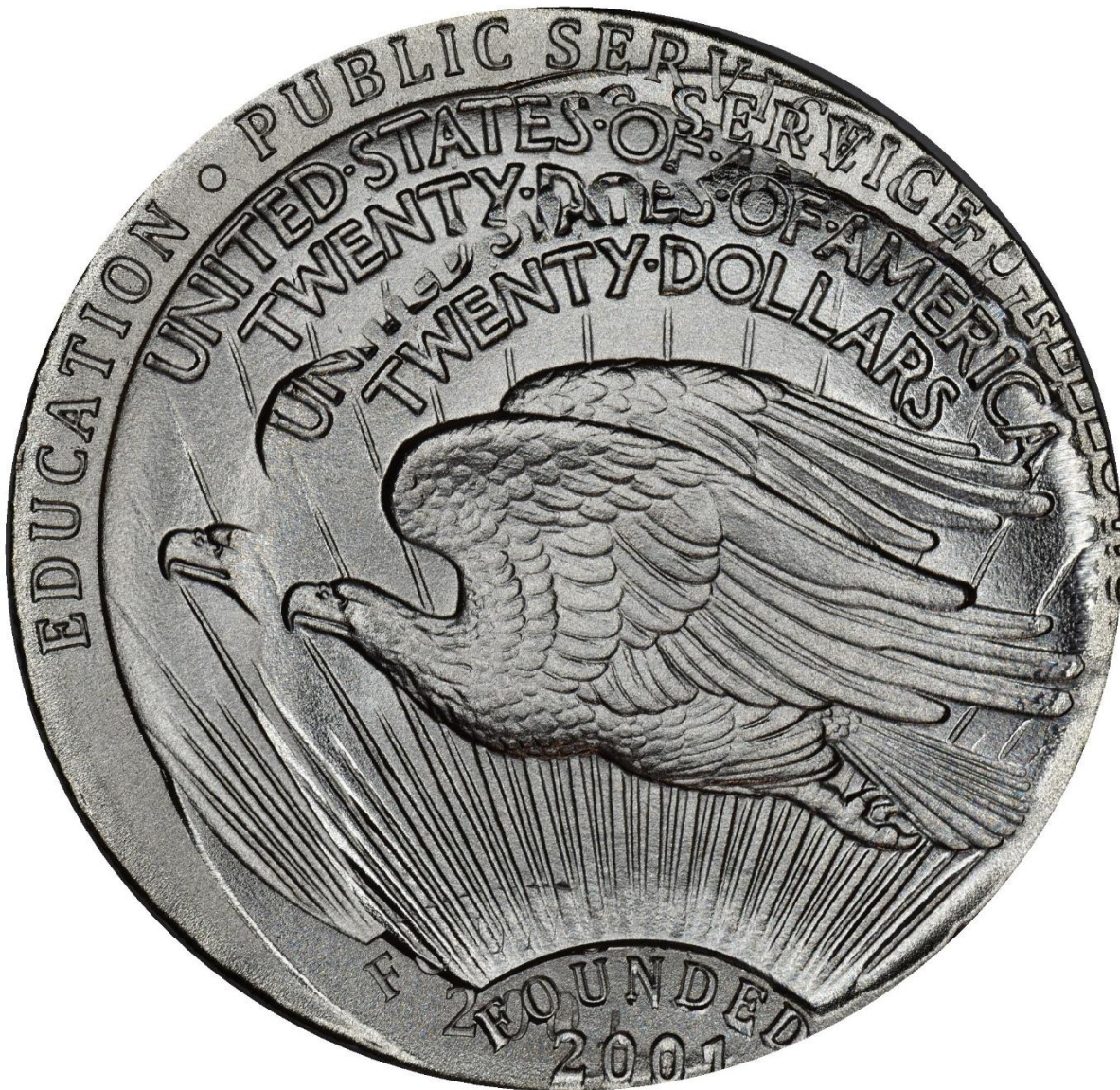
The reverse of the silver "07".

More information about our auction can be found by contacting the club at madisoncountycoinclub2020@gmail.com .