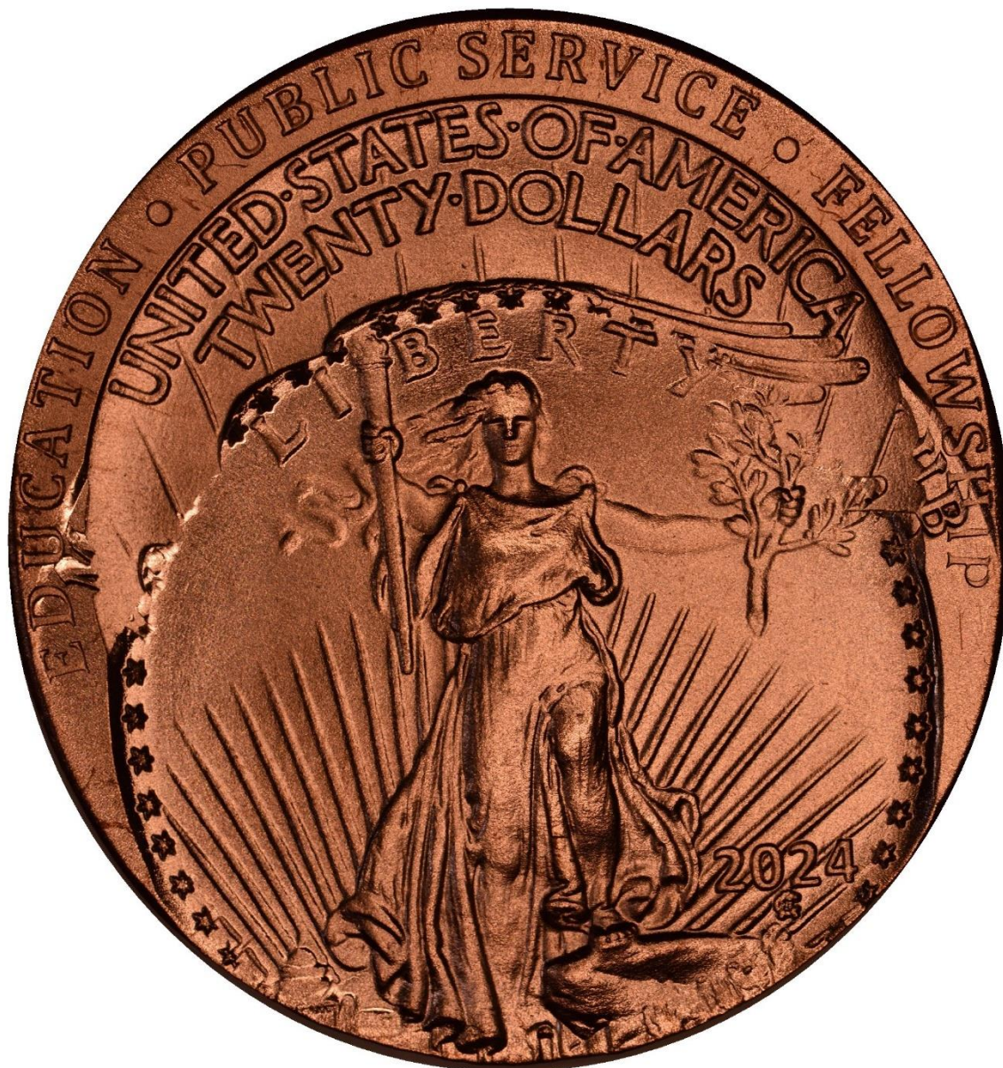
The reverse of the first flip over.