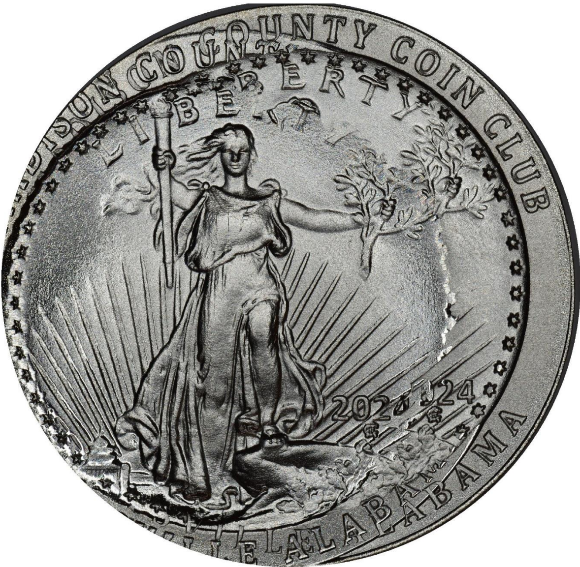
The obverse of the silver "07".