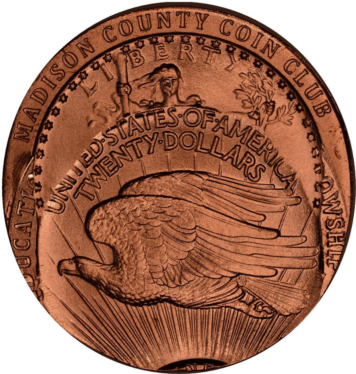
The obverse of the first flip over.