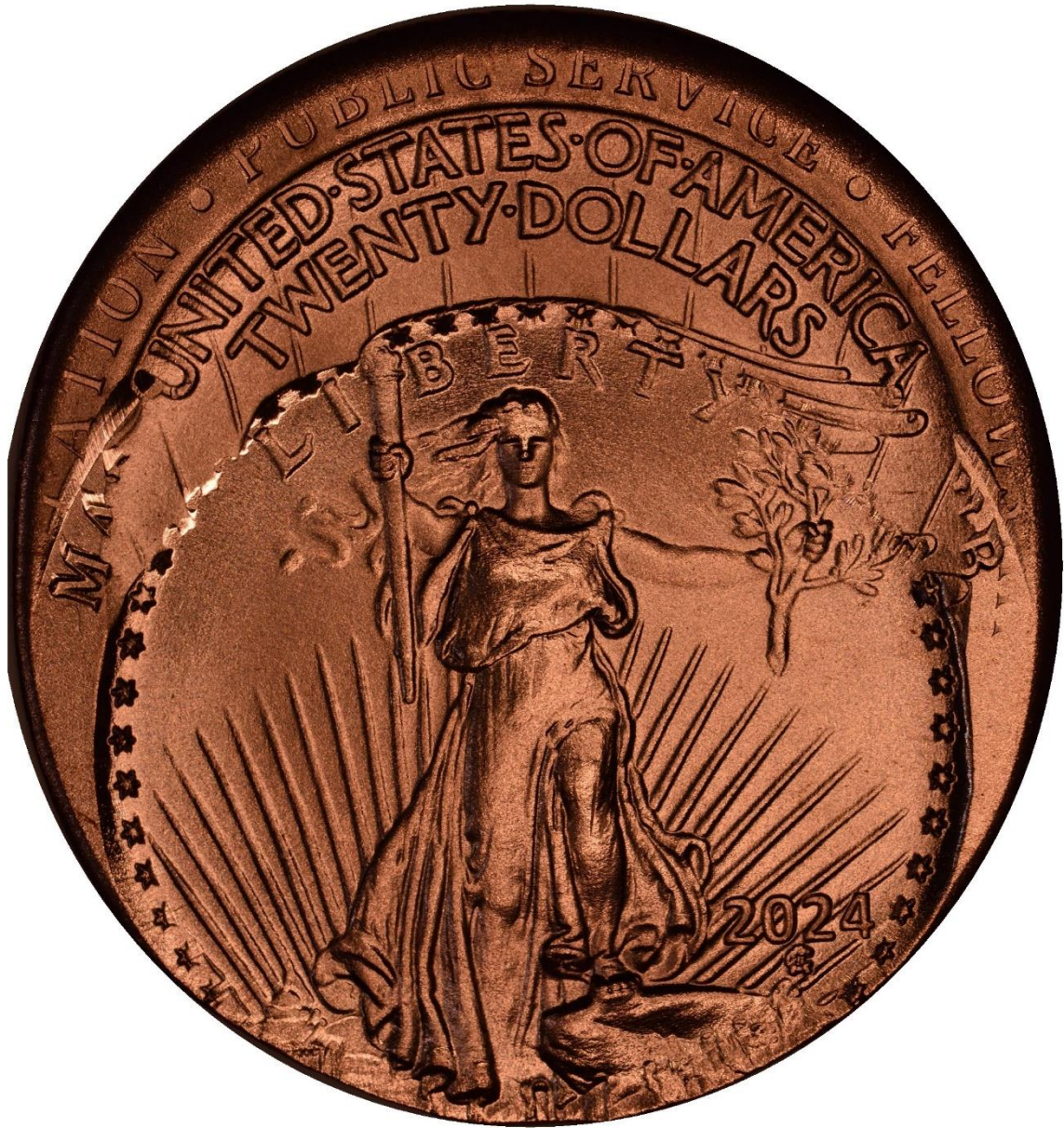
The reverse of the second flip over.