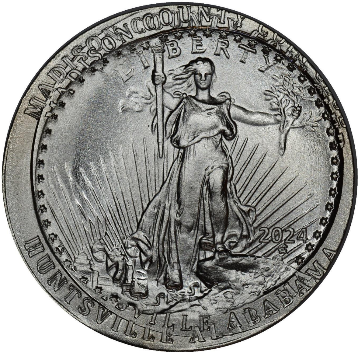
The obverse of the silver "01".