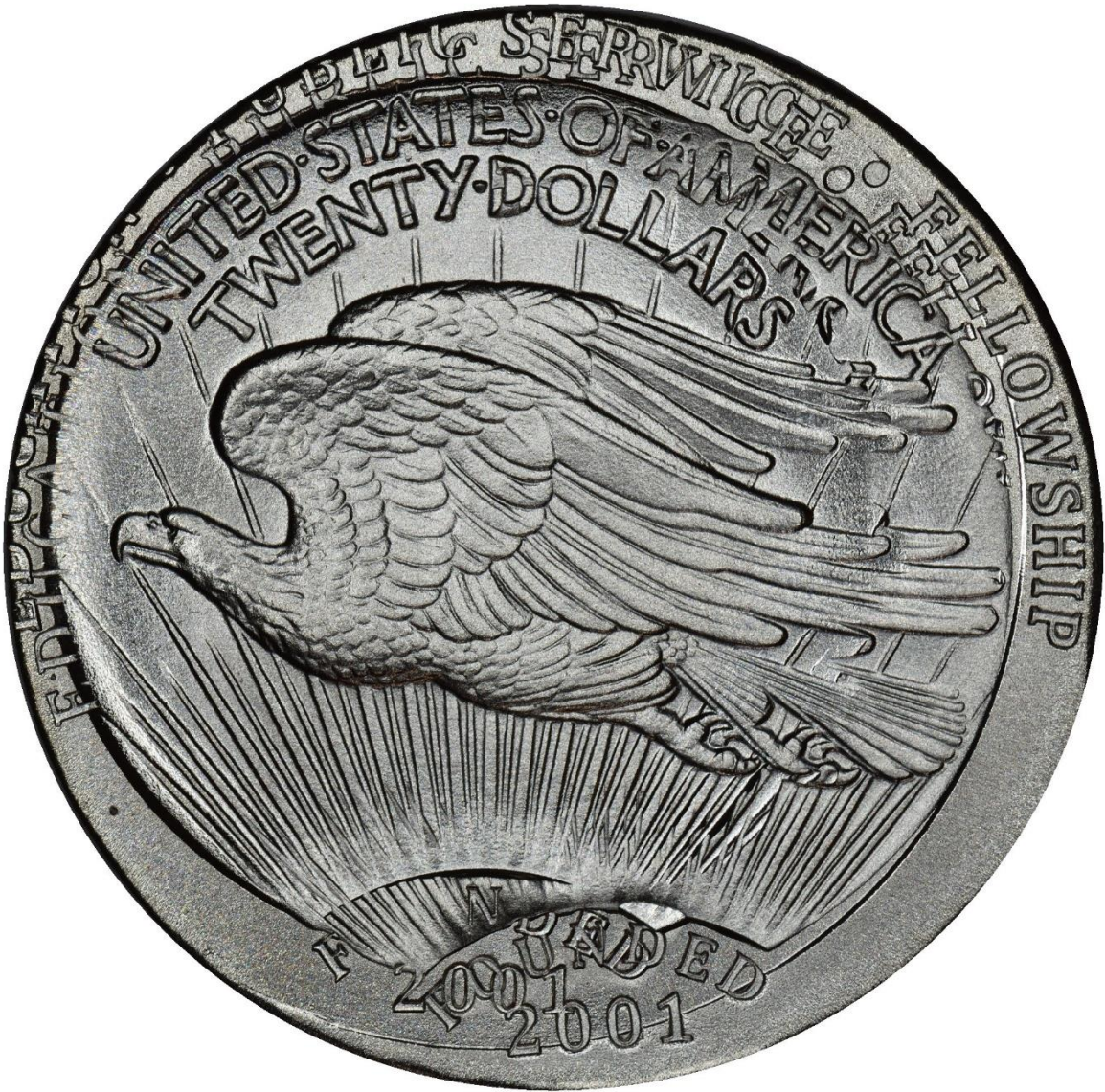
The reverse of the silver "01".