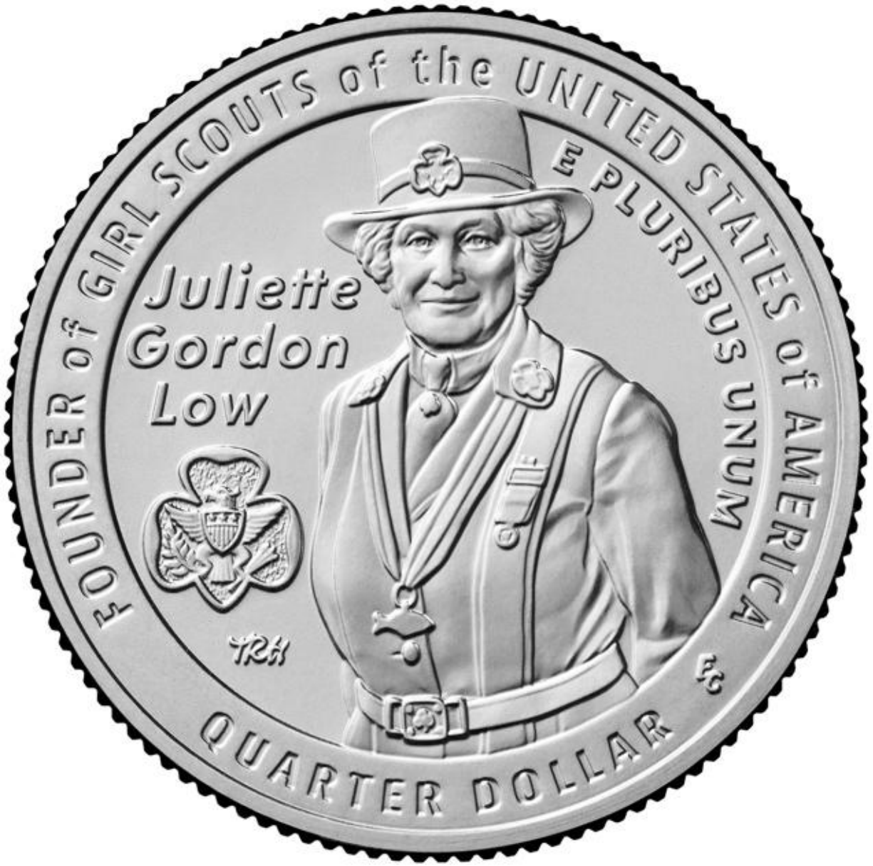
Juliette Gordon Low