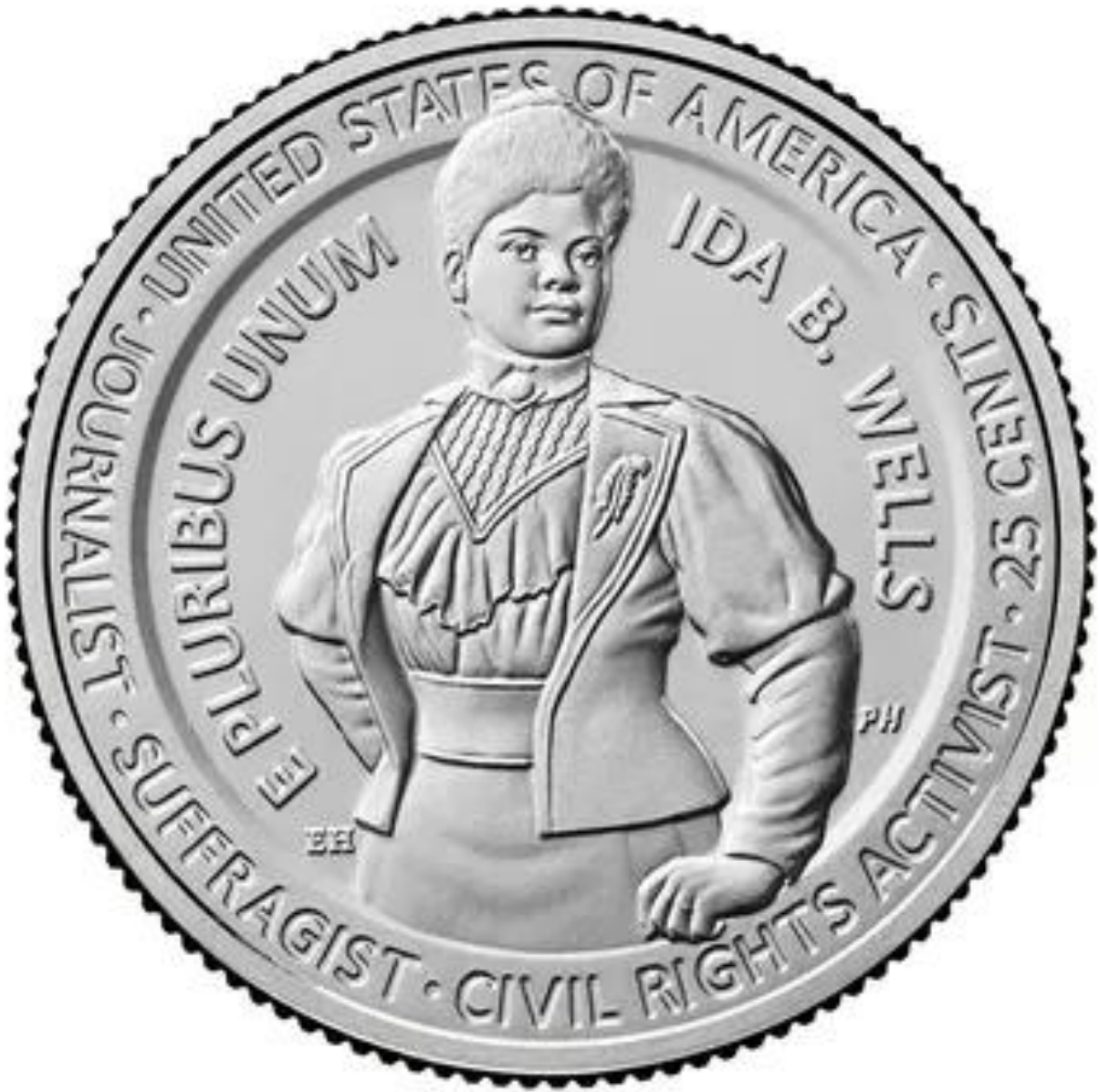
Ida B. Wells