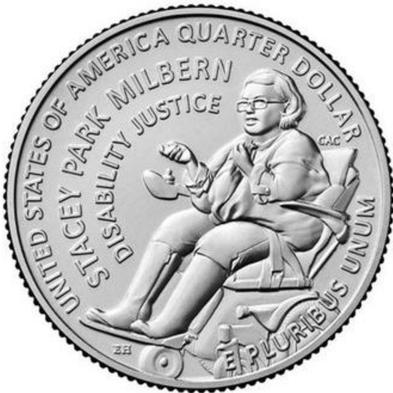
Stacey Park Milbern