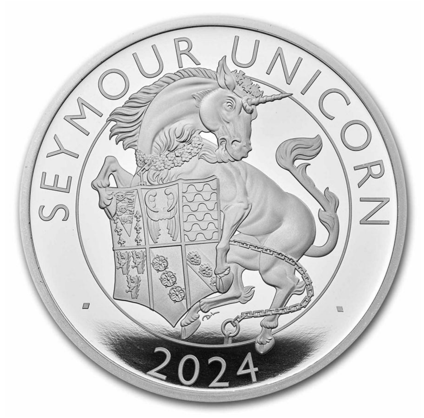
The Lion of England (proof version)

These coins feature the edge inscription 'HAMPTON COURT PALACE \cdot ROYAL TUDOR BEASTS.'