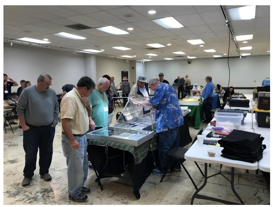
Last year over 250 people attended the two-day event.

More information can be found at: http://www.sefsc.org/huntspex.html