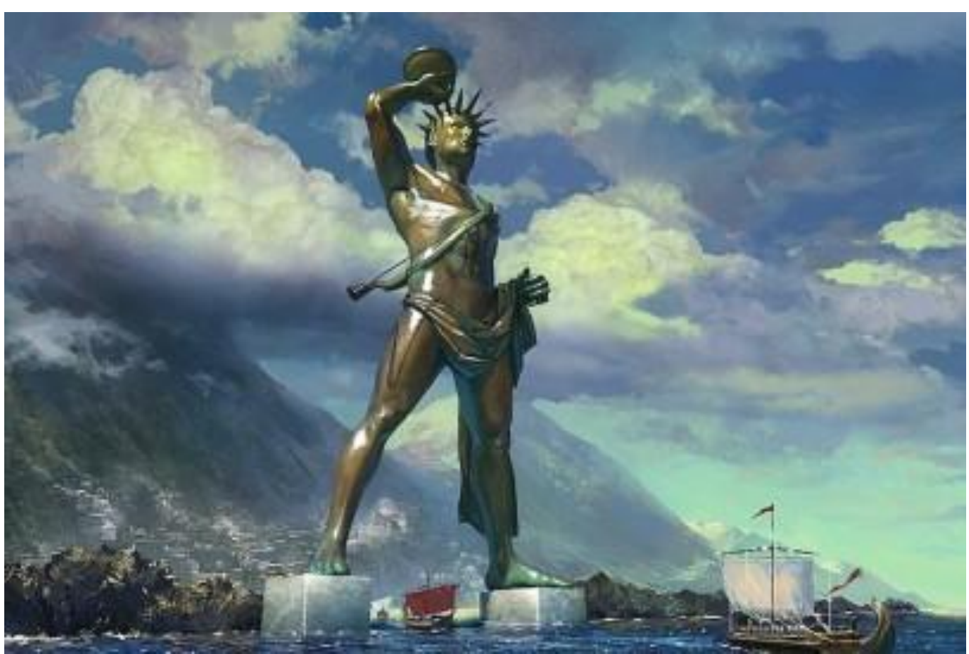
The Colossus of Rhodes, one of the Seven Wonders of the Ancient World

Historically, Rhodes was famous for the Colossus of Rhodes, one of the Seven Wonders of the Ancient World. The Medieval Old Town of the City of Rhodes has been declared a World Heritage Site. Today, it is one of the most popular tourist destinations in Europe.