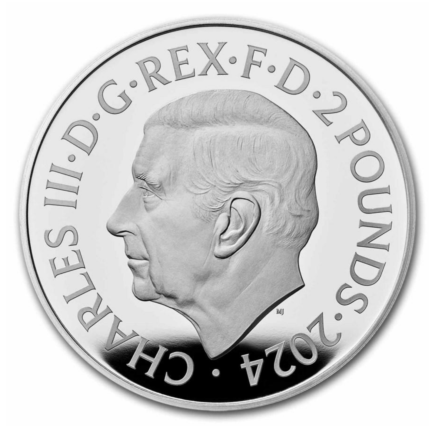
The obverse of the 2025 coins depicts King Charles

The two pounds coin is 38.61 mm in diameter and weighs two ounces.