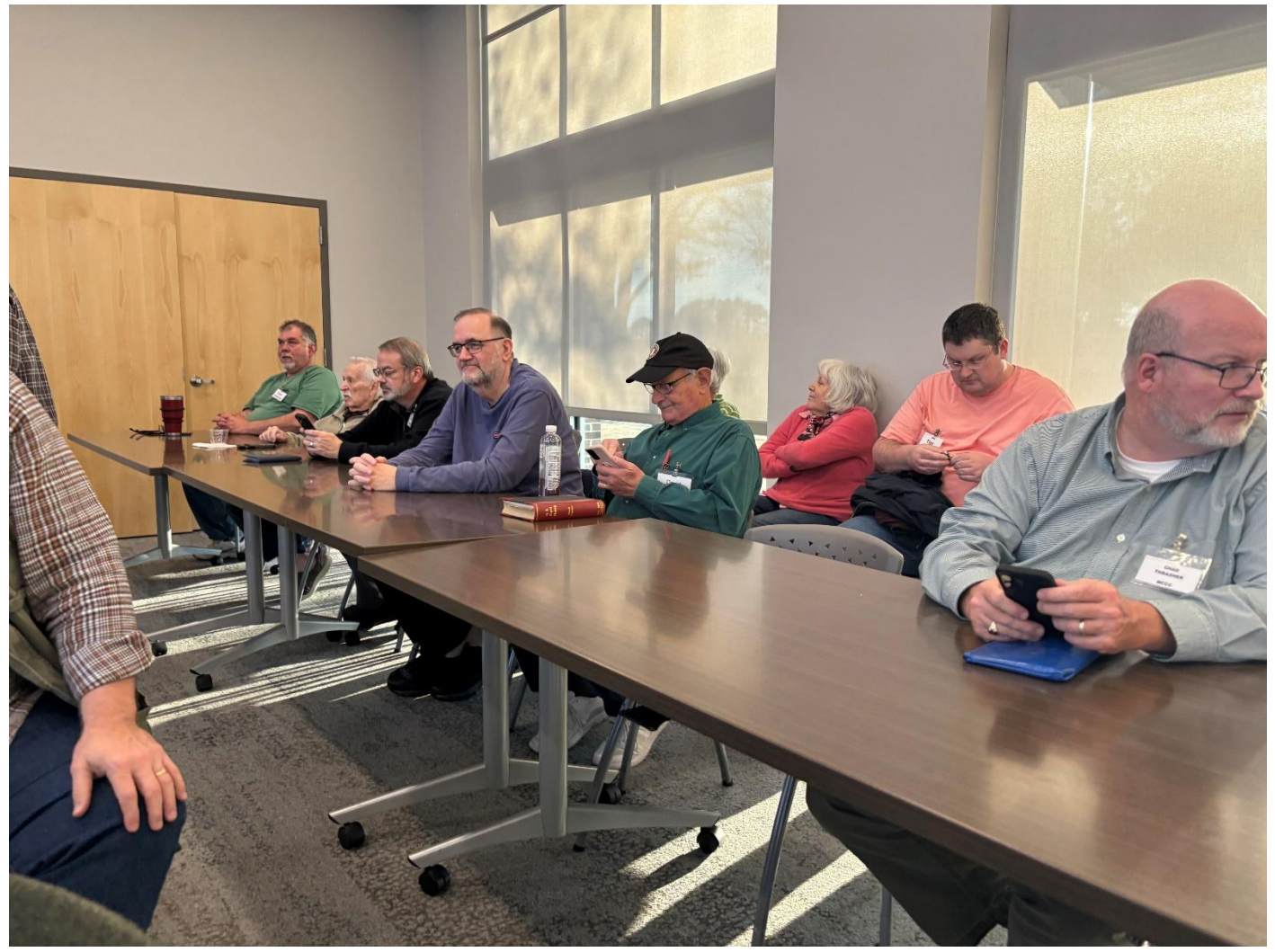
The crew prepares for the meeting

Please bring a coin, medal, note, or something for Show-and-Tell.