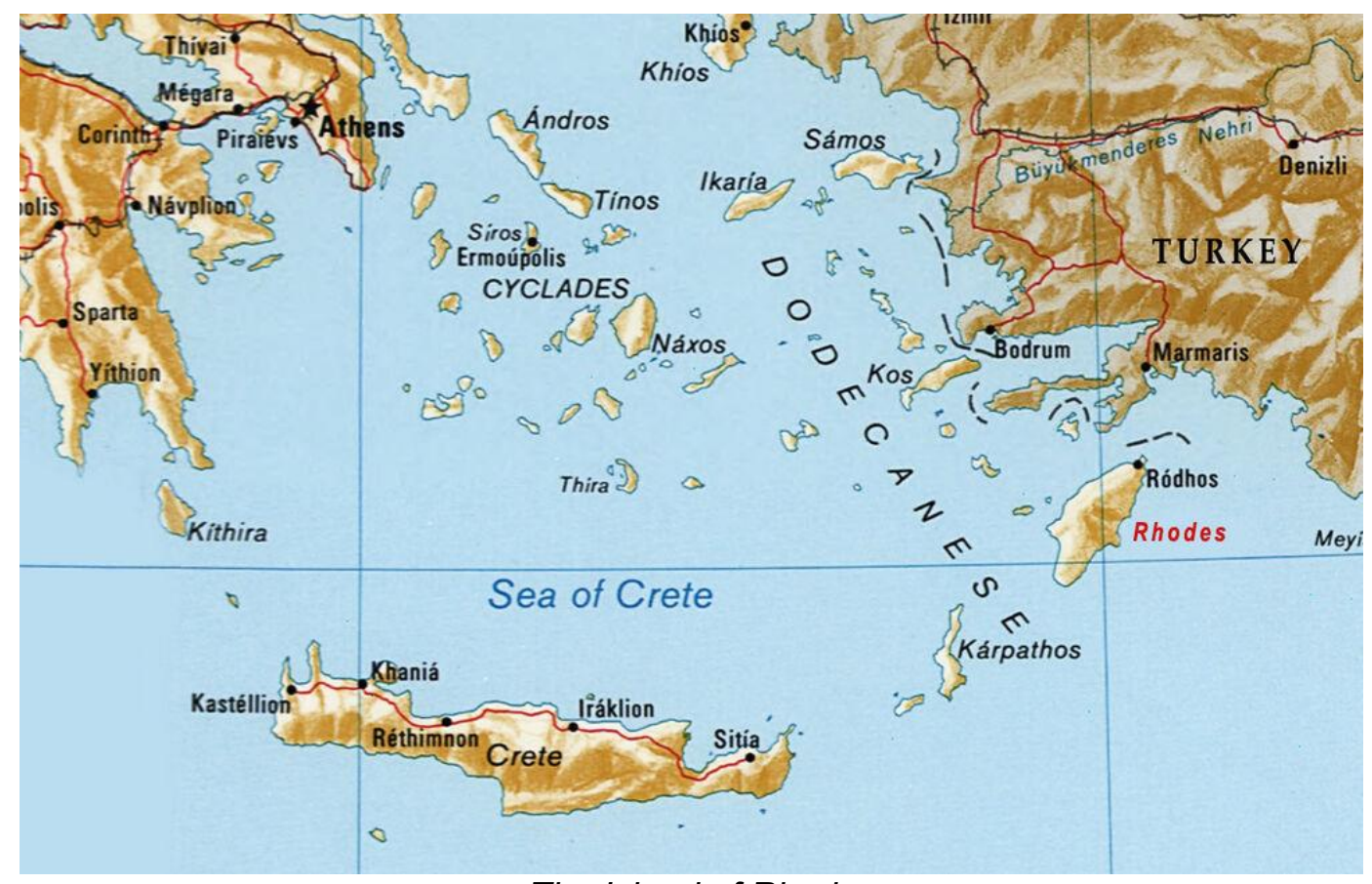
The Island of Rhodes