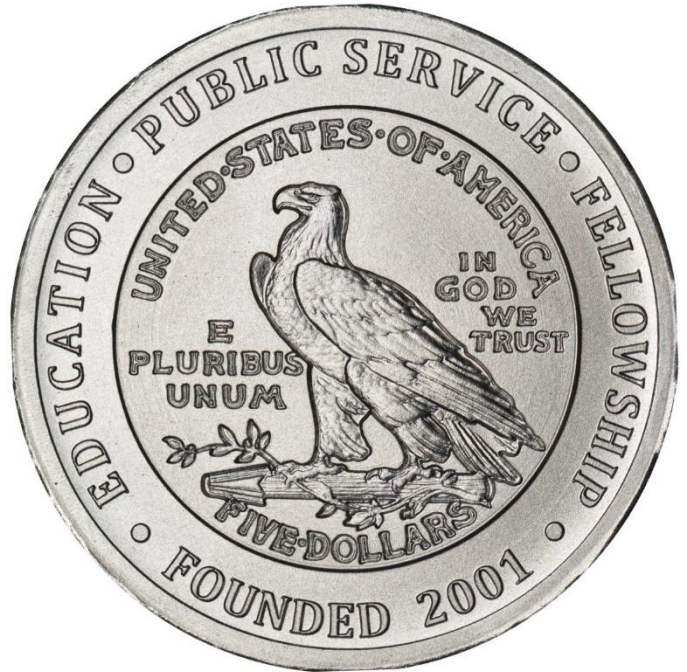
Only 40 silver medals were minted.