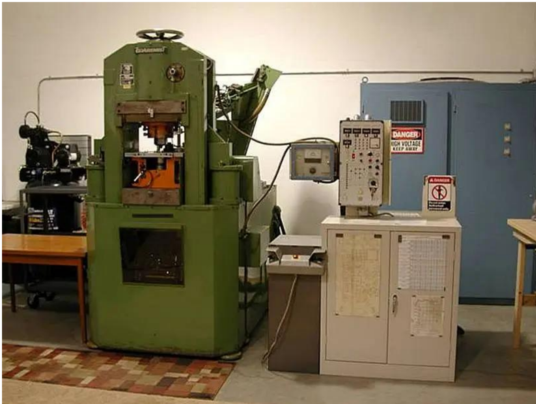
The Moonlight Mint's Grabener Coin Press