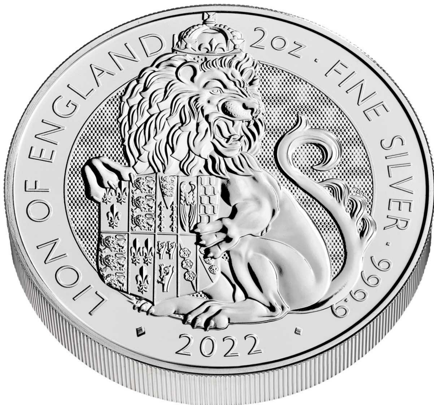
The Lion of England (bullion version)

The king of the beasts is one of the oldest and most iconic beasts in heraldic art. Used on the shield of England for as long as one has existed, the lion first appeared in heraldry in the twelfth century.