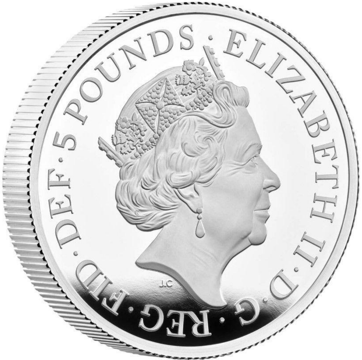
The obverse of the 2022 coins depicts Queen Elizabeth II