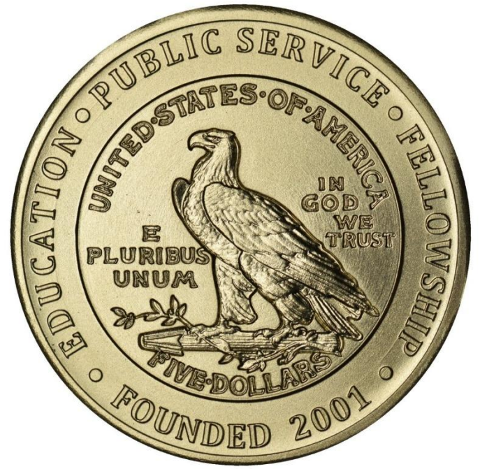
The brass medal is the rarest MCCC medal with a mintage of 20.