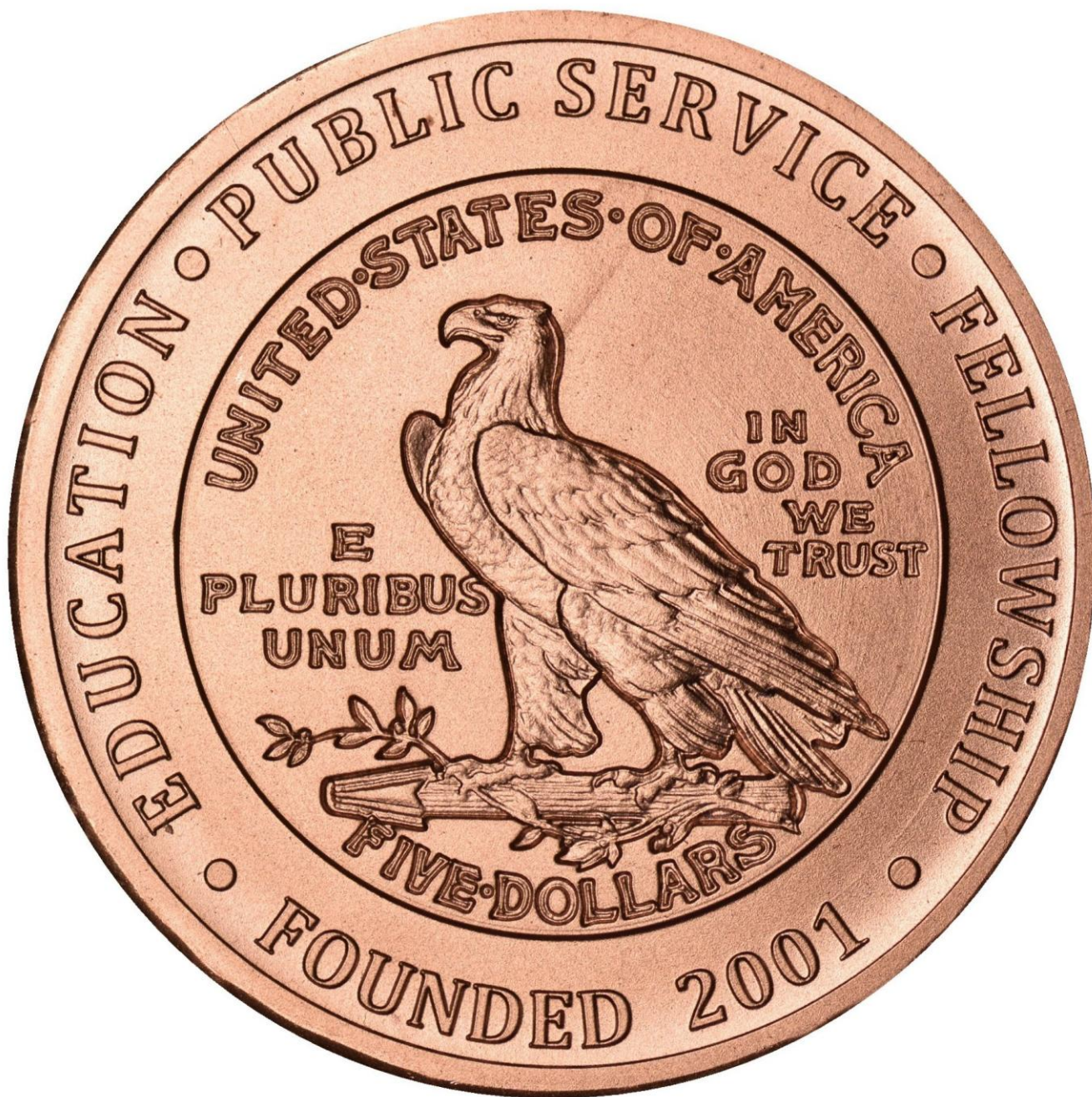
The 2025 MCCC medal depicts a $5 gold Indian Head coin.