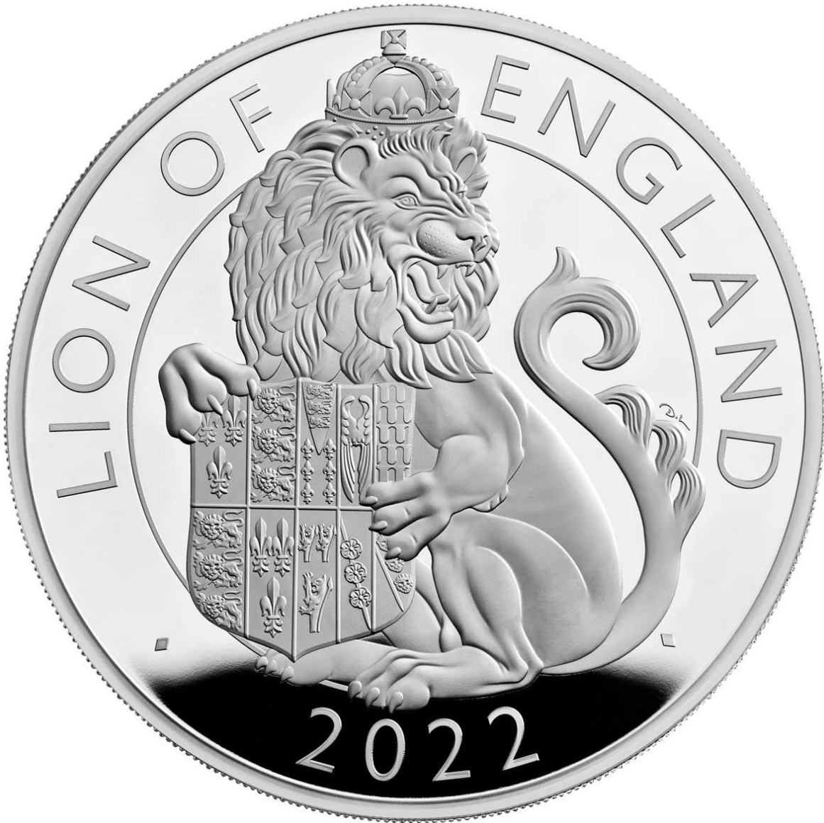
The Lion of England (proof version)