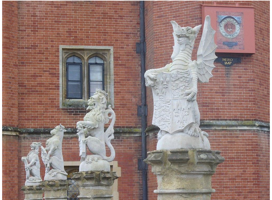
left to right: Mortimer panther; Clarence black bull; Mortimer lion; Royal dragon.

Both the bullion and proof editions will have the same 10 reverse designs. The order of release varies between bullion and proof quality. The silver series is available in a range of weights, including 1oz, 2oz, 5oz, 10oz & 1kg (same reverse designs), and is available in varying weights from ¼ oz to 1 oz in gold and platinum variations. Not all weights will be available for each type and some of the silver coins will be available in an antique finish. Finally, a copper-nickel £5 coin will also be available for collectors.