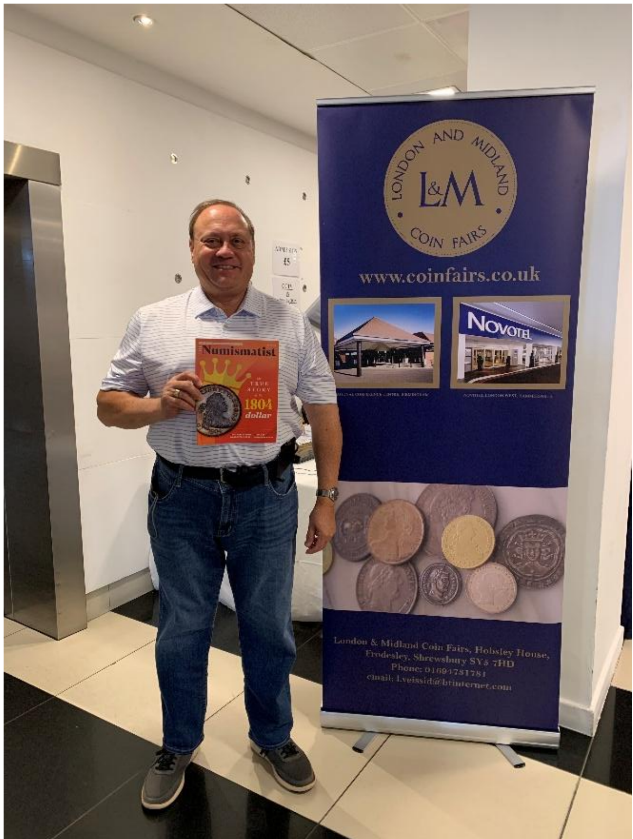
The author at the entrance to the London Coin Fair