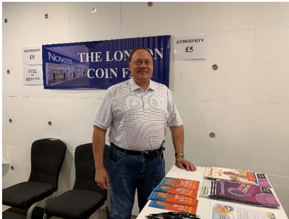
The author by the table he had to put out ANA materials at the London Coin Fair