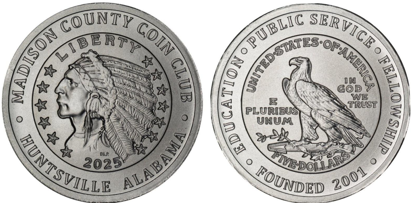
Unique Silver 2025 Medal without Serial Number