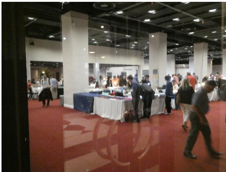
London Coin Fair, London, England on September 6, 2025

It was interesting to see the differences and similarities between a British coin show compared to a U.S. coin show. It was a great experience.