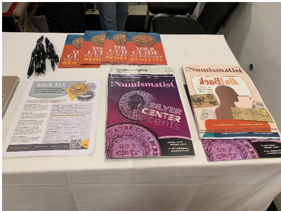
ANA materials given out at the London Coin Fair