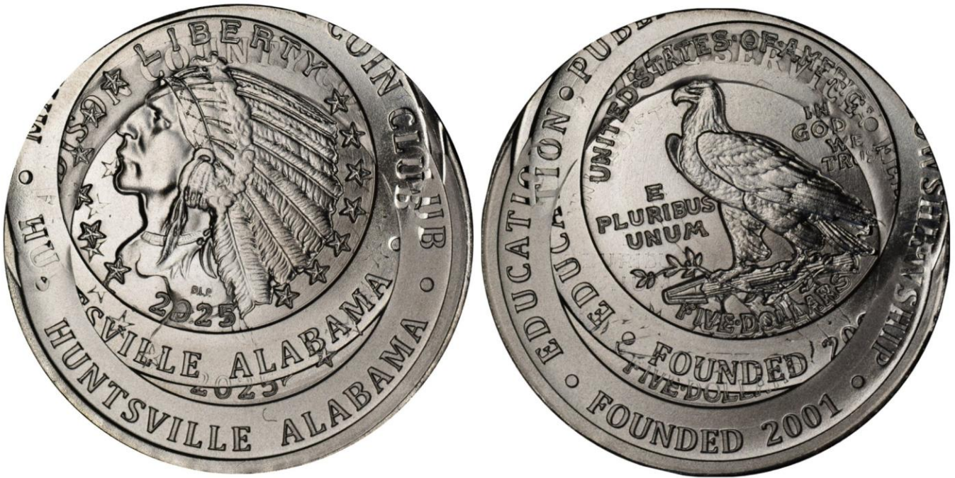
Unique Double Struck 2025 Medal