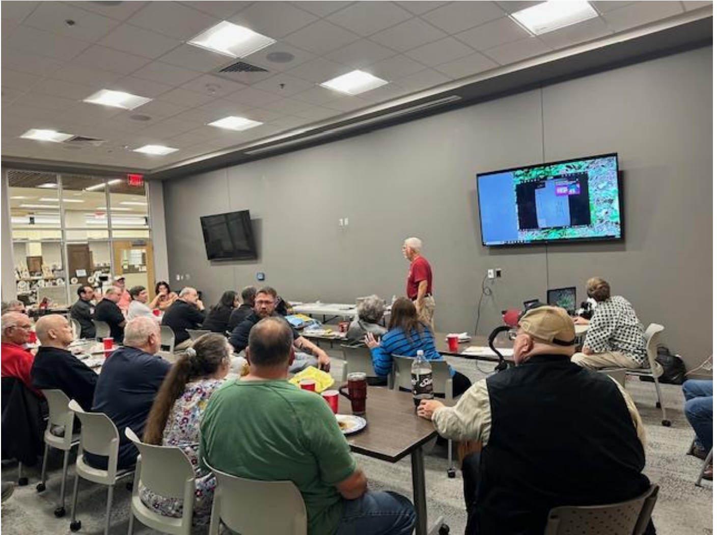
The crowd settles in.

Why not bring a friend to the next meeting?