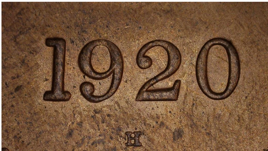
The Narrow Date Variety. Note the alignment of the digits.