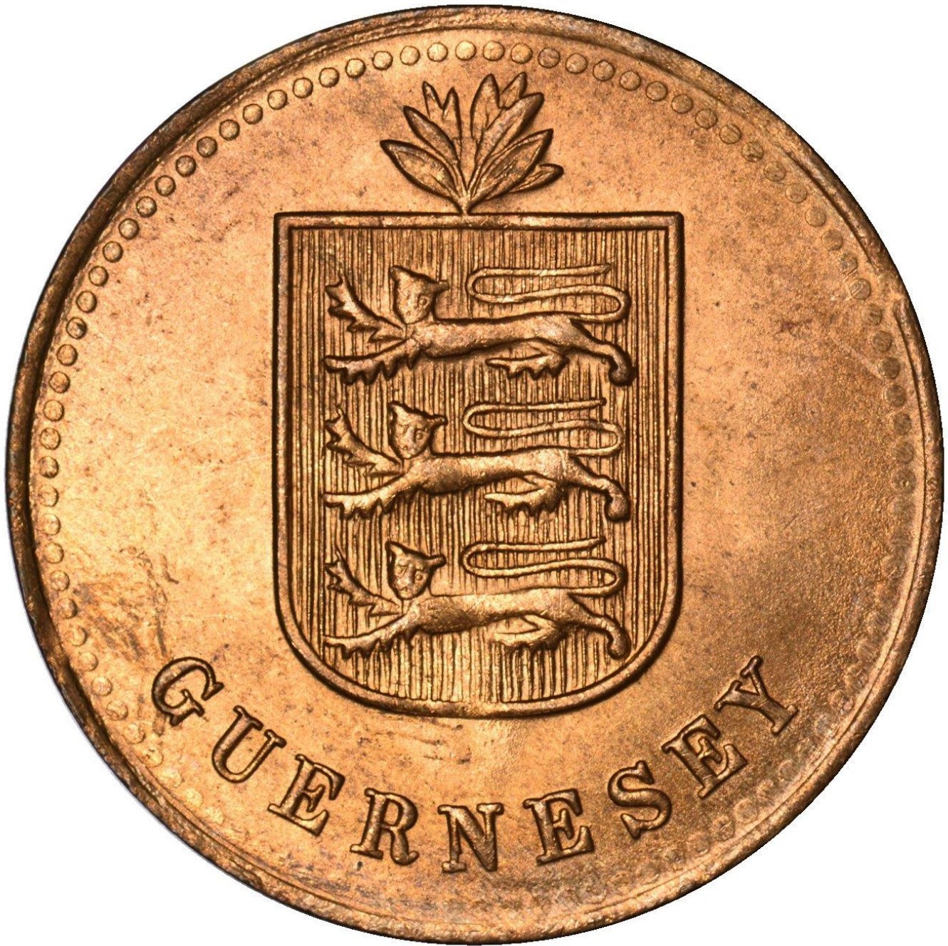
The obverse of the Guernsey 1920-H Four Doubles typically have a weak border of beading.