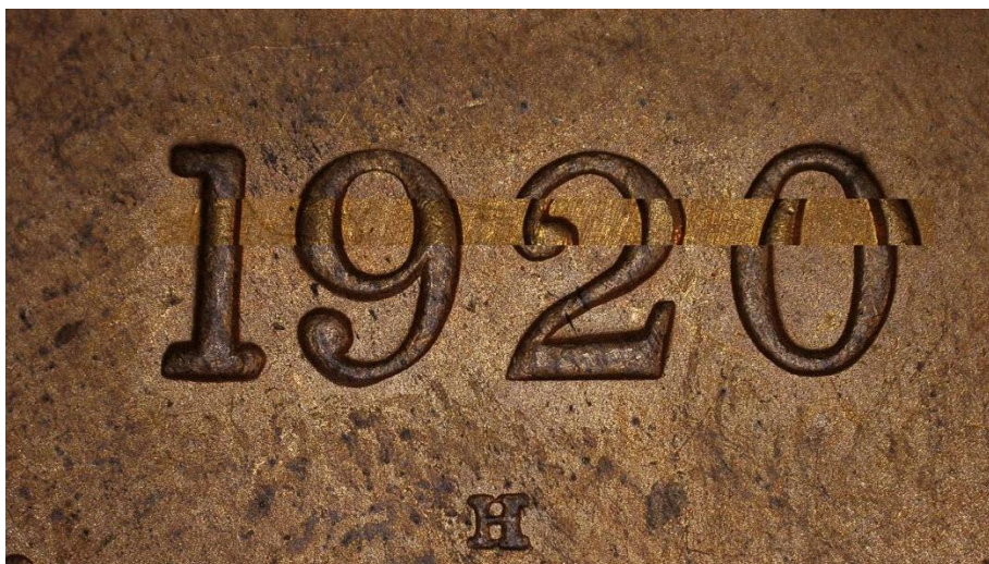
Overlaying the Wide over the Narrow