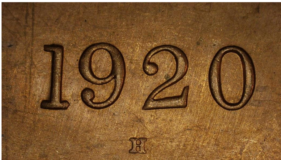
The Wide Date Variety The 9 is slightly raised and the 2 is crooked.