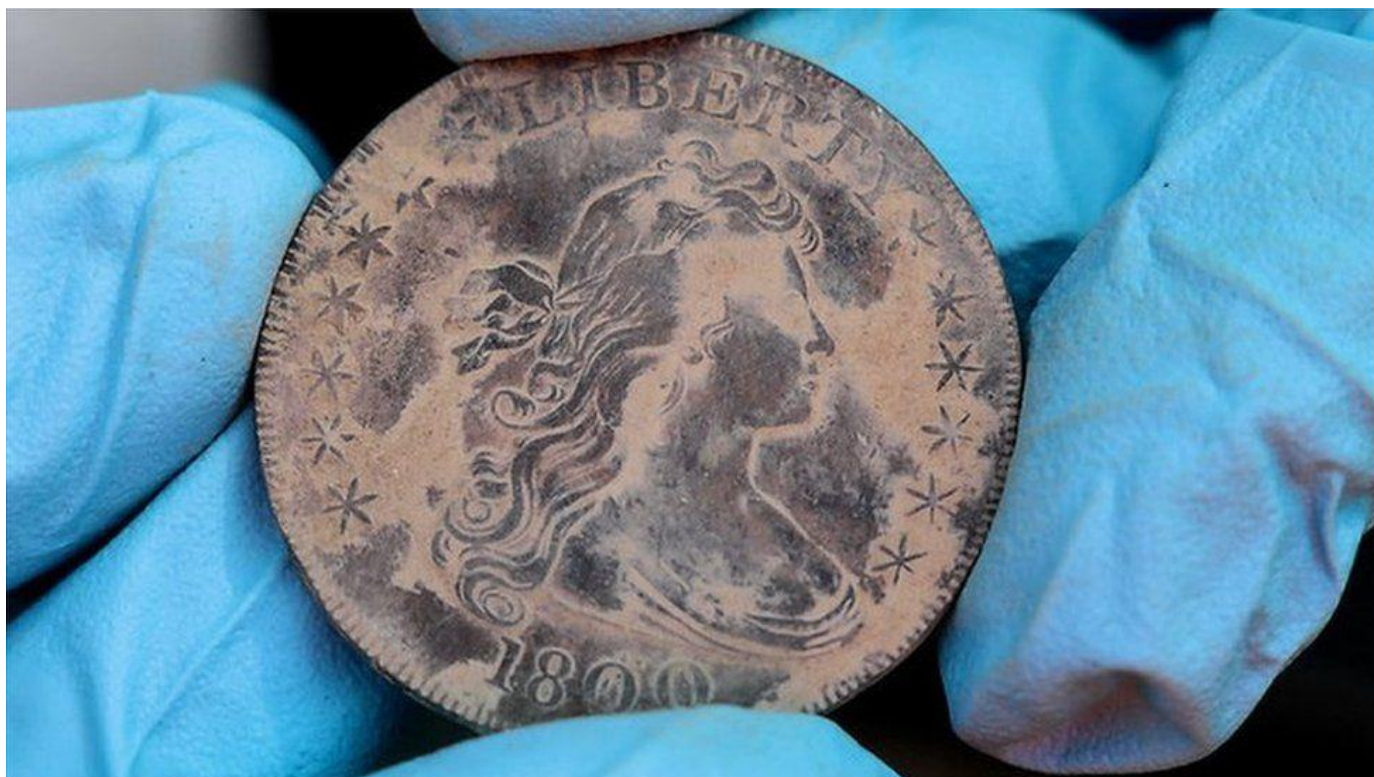
The 1800 Dollar Coin