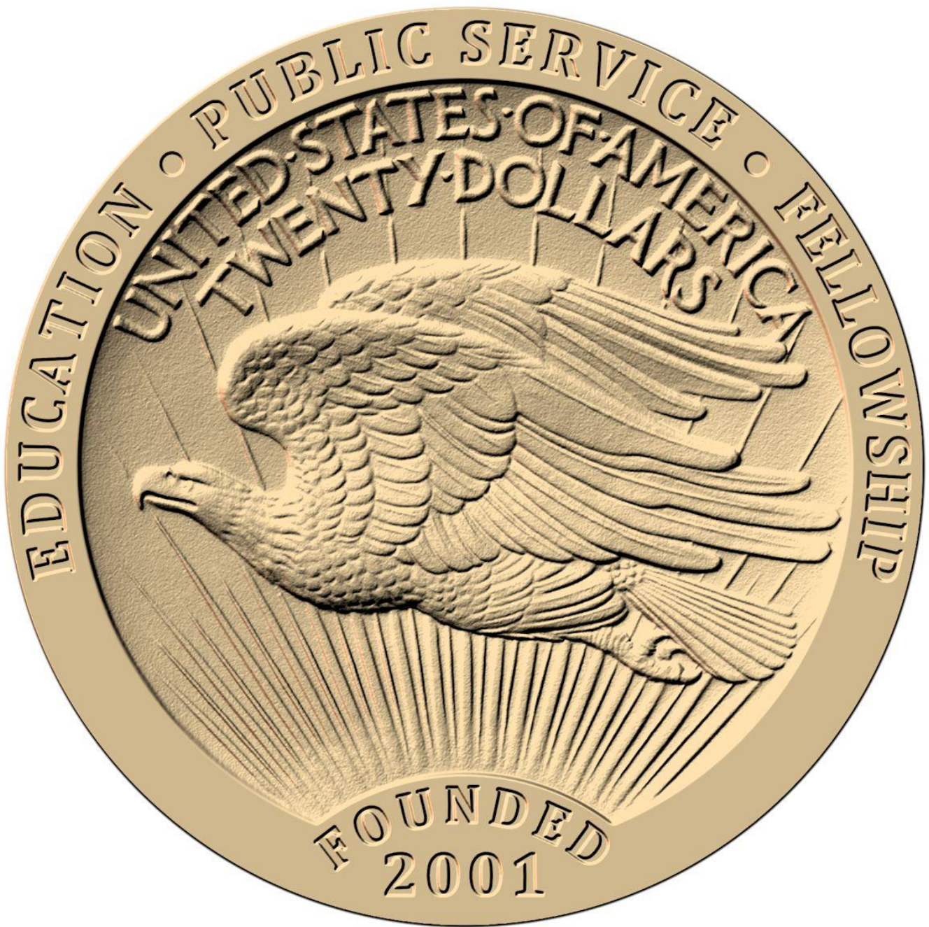
The Reverse of the 2024 Club Medal

Deadline for ordering your medal is November 30!