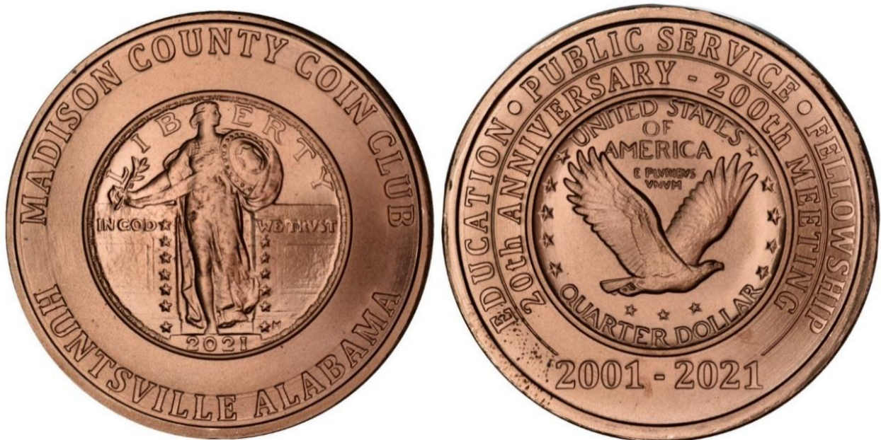
The Club's 2021 medal