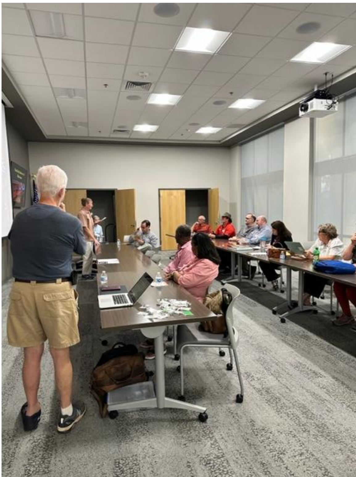
The club starts the meeting.