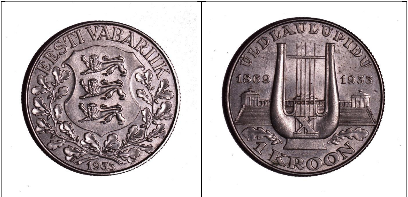
1933 One Kroon From Estonia