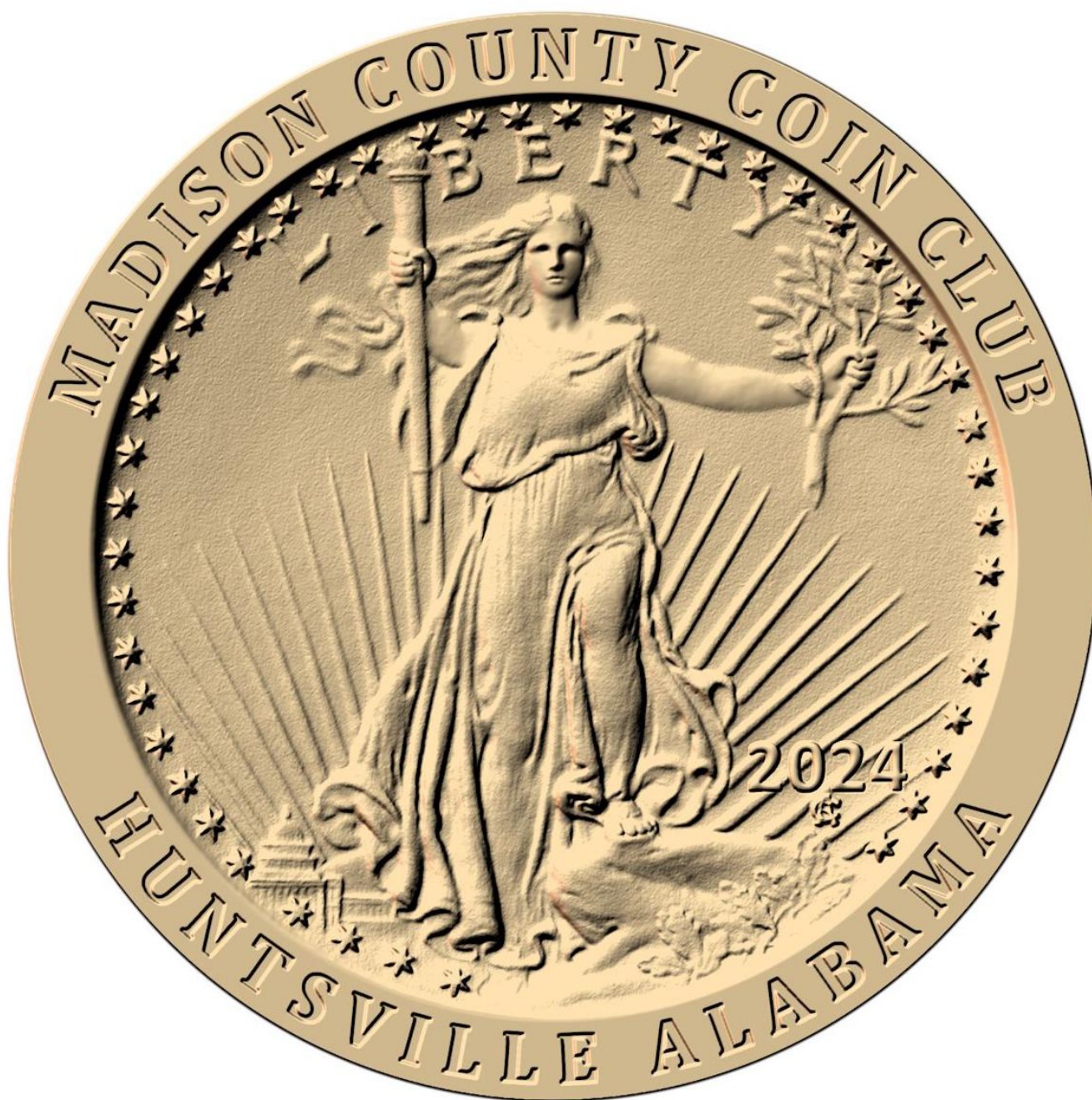
The Obverse of the 2024 Club Medal

Visit us on the web at http://mccc.anacclubs.org/