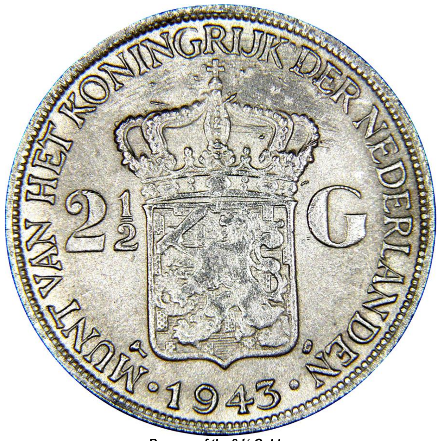
Reverse of the 2 ½ Gulden

A crowned Dutch shield divides the date and the value below, with Denver mintmark to the right of the shield at the bottom.