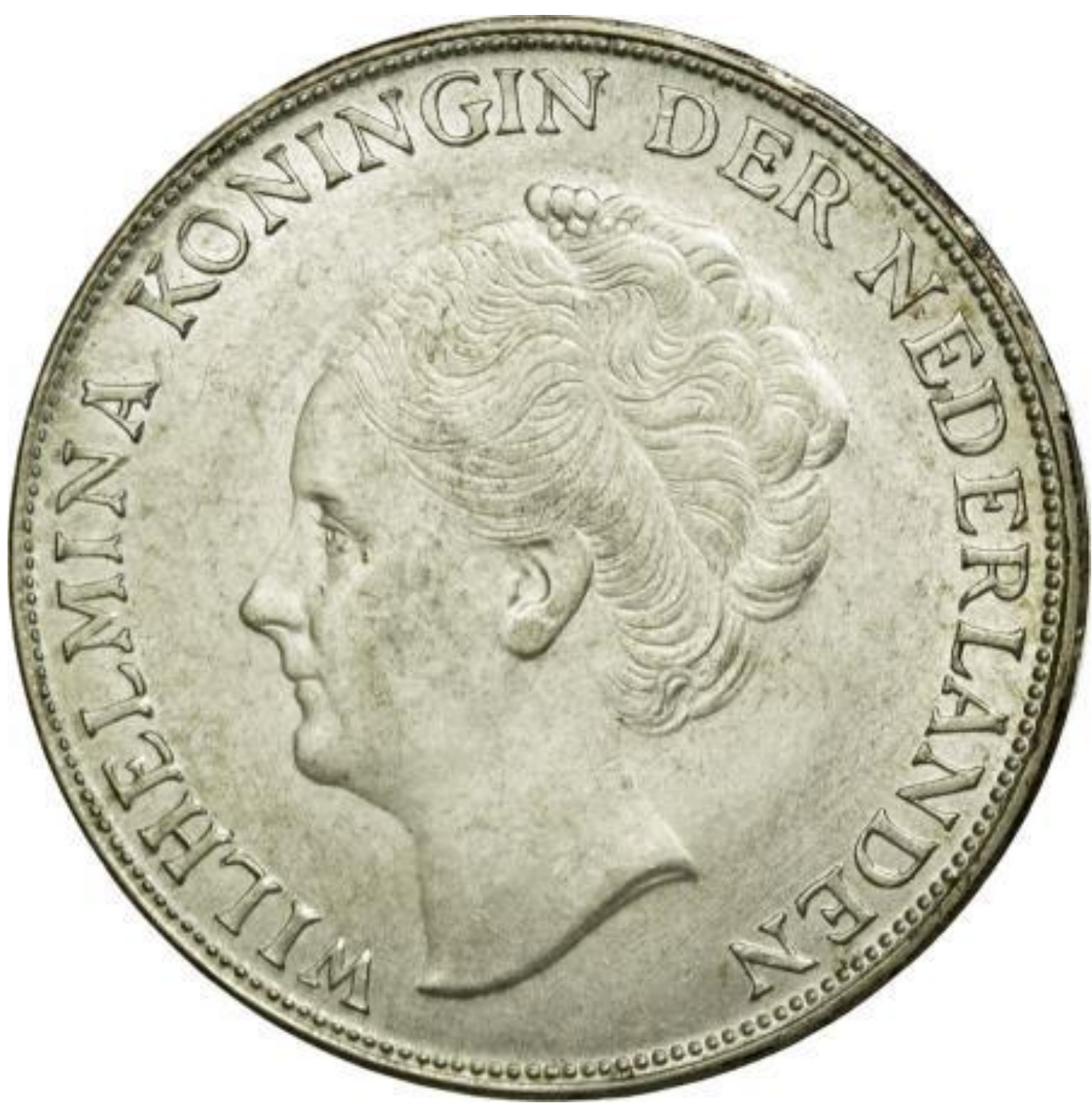
Obverse of the 1 Gulden