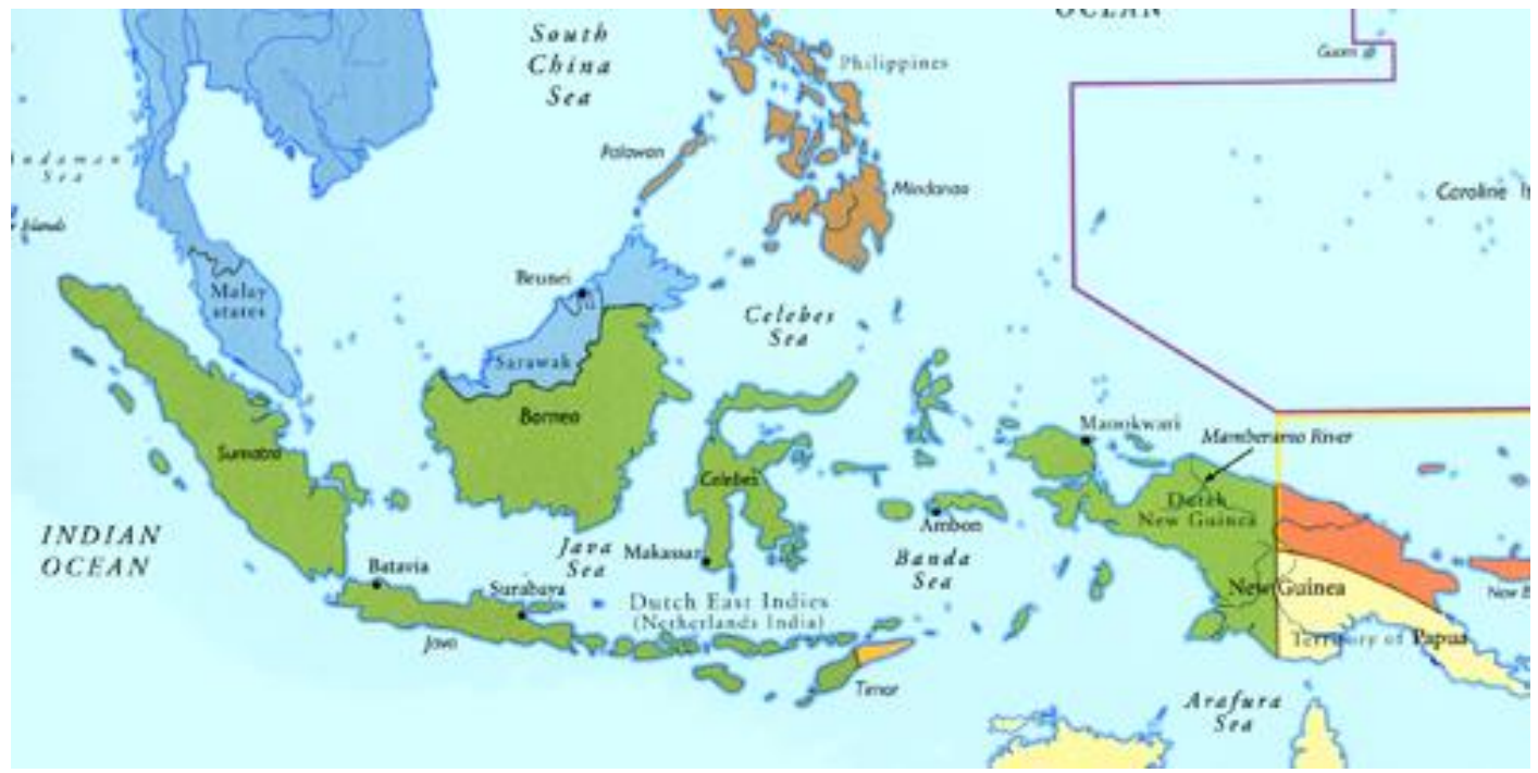
The Netherland East Indies

During World War II the U.S. mints produced coins for the Dutch colony of the Netherlands East Indies. Over this four-year period, all three mints help produced over 1.7 BILLION coins including a half cent, cent, 2 ½ cents, 1/10 gulden, ¼ gulden, 1 gulden, and 2 ½ gulden coins. These coins were planned to be used after the end of the war. Unfortunately for the Dutch plans, after the Japanese occupation officially ended on August 15, 1945, two days later Sukamo, an Indonesian statesman, declared his country independent from the Netherlands. A four-year war followed and eventually Indonesian gain their independence.