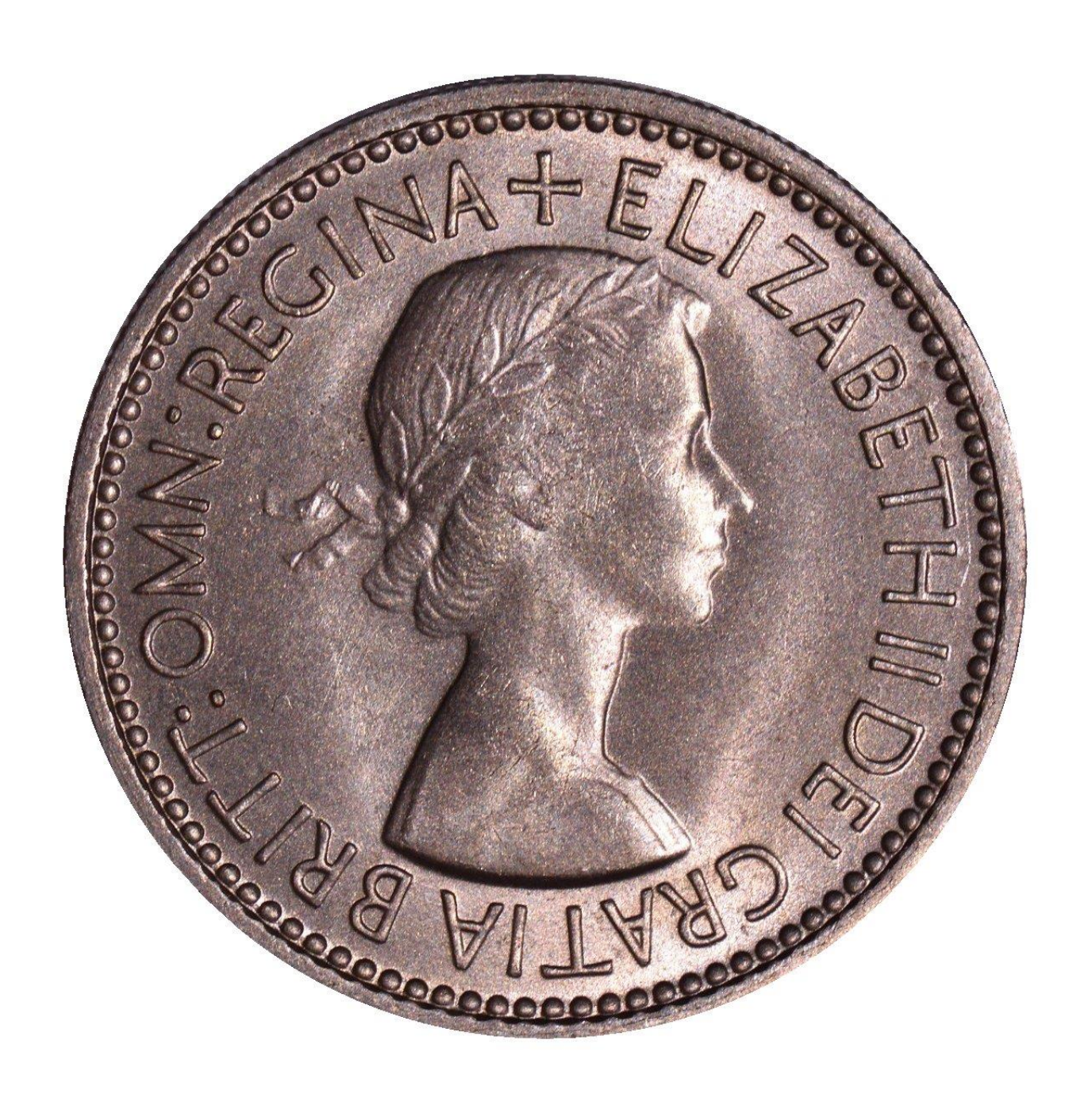
The obverse used in 1953