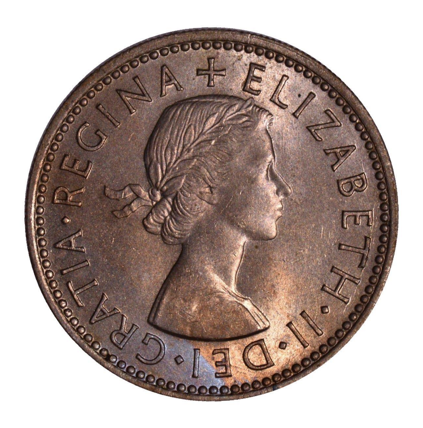
The obverse used from 1954 to 1970