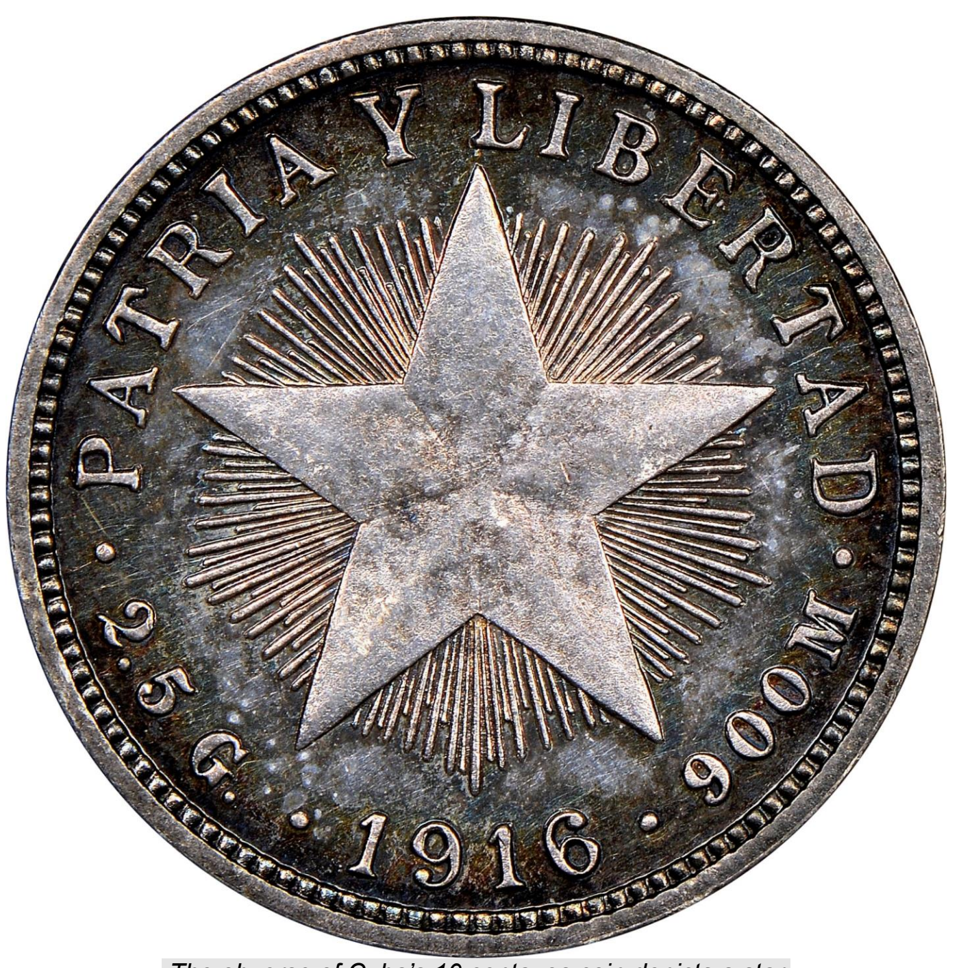
The obverse of Cuba's 10 centavos coin depicts a star.