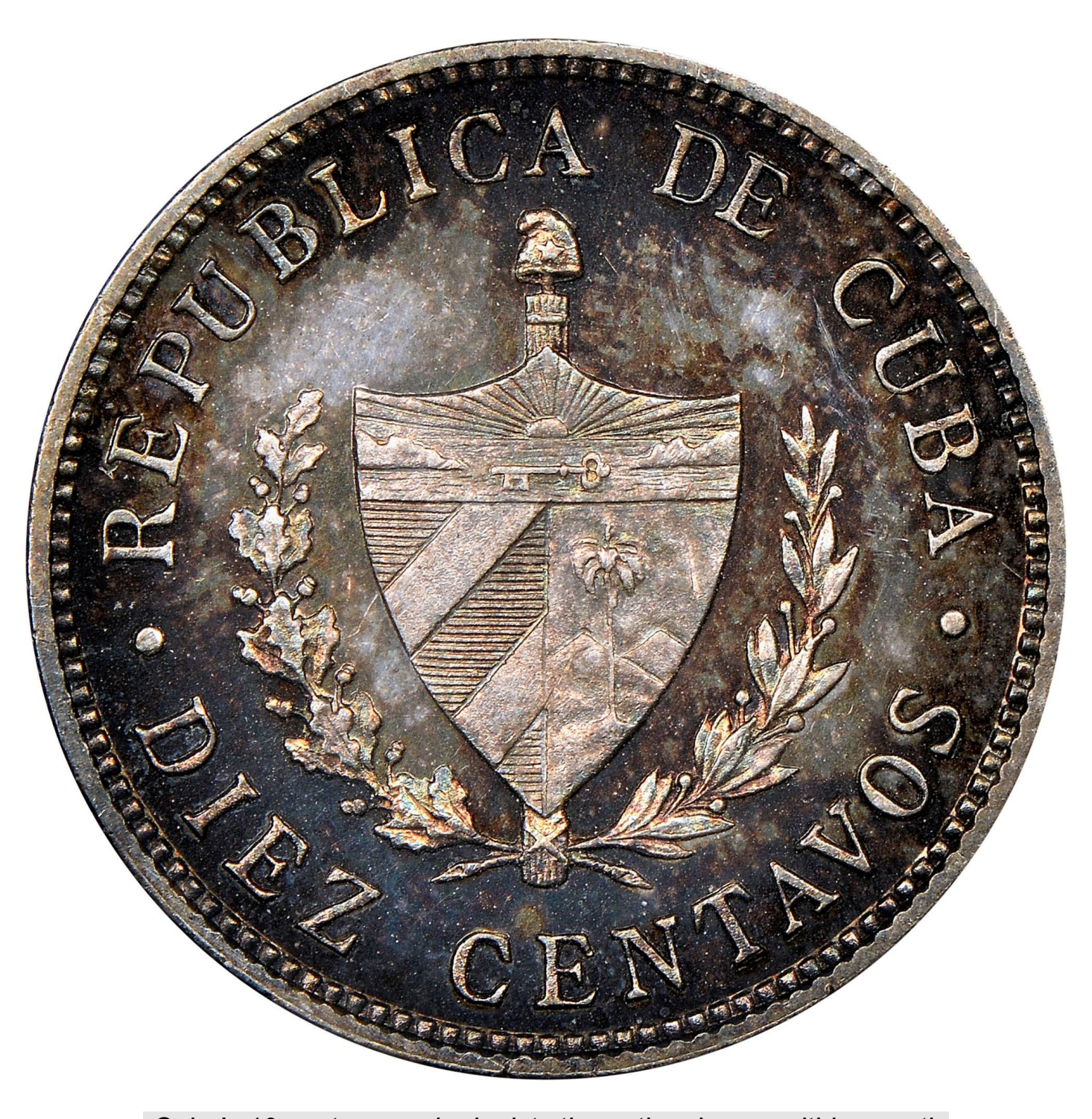
Cuba's 10 centavos coin depicts the national arms within wreath, denomination below