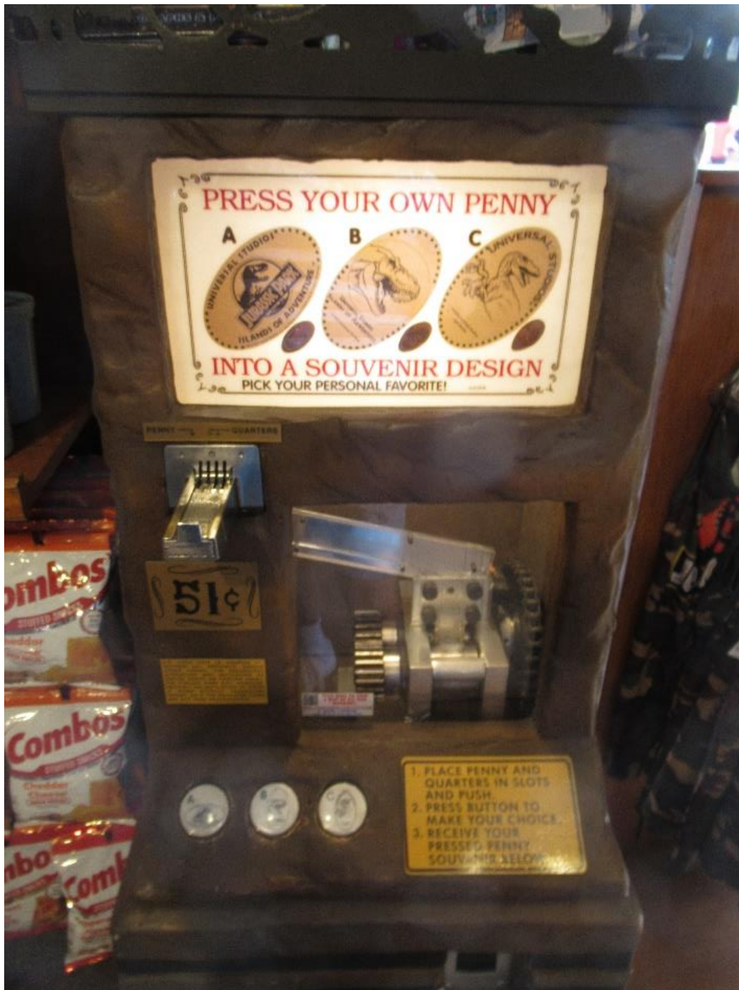
Only old 51¢ Rolling Machine Found at Universal

During my January 2022 Orlando, FL stay, I went to other places in the area and found more rolling machines. These rolling machines were like the current Universal ones, they cost $1 per design and take $1 notes or use credit and debit cards. The cents used are zinc ones. I guess that more rolling machines will be converted to the new $1 type as time goes on.