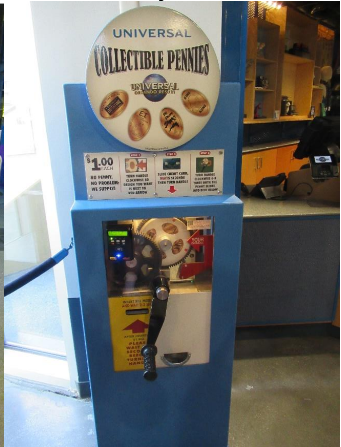
Comparison of Changes to the Same Rolling Machine at Universal

The above photos show the same rolling machine with the same four designs, one year apart.