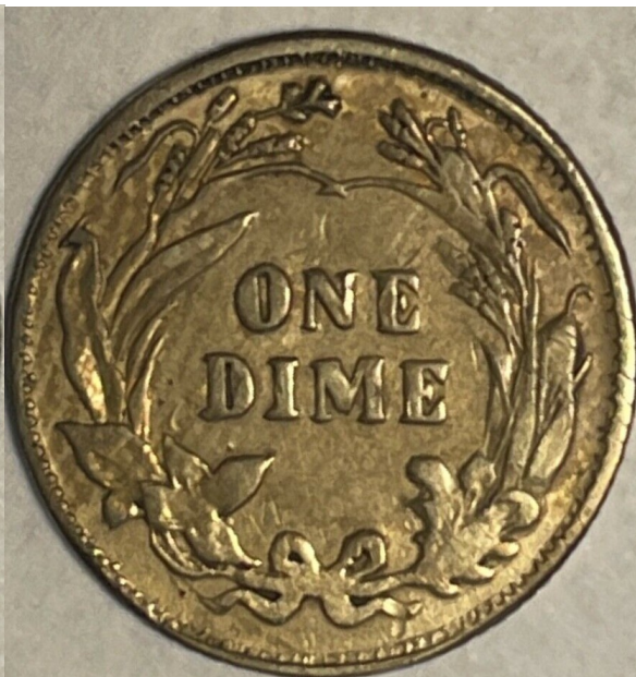
Contemporary Counterfeit Found on eBay (2021)