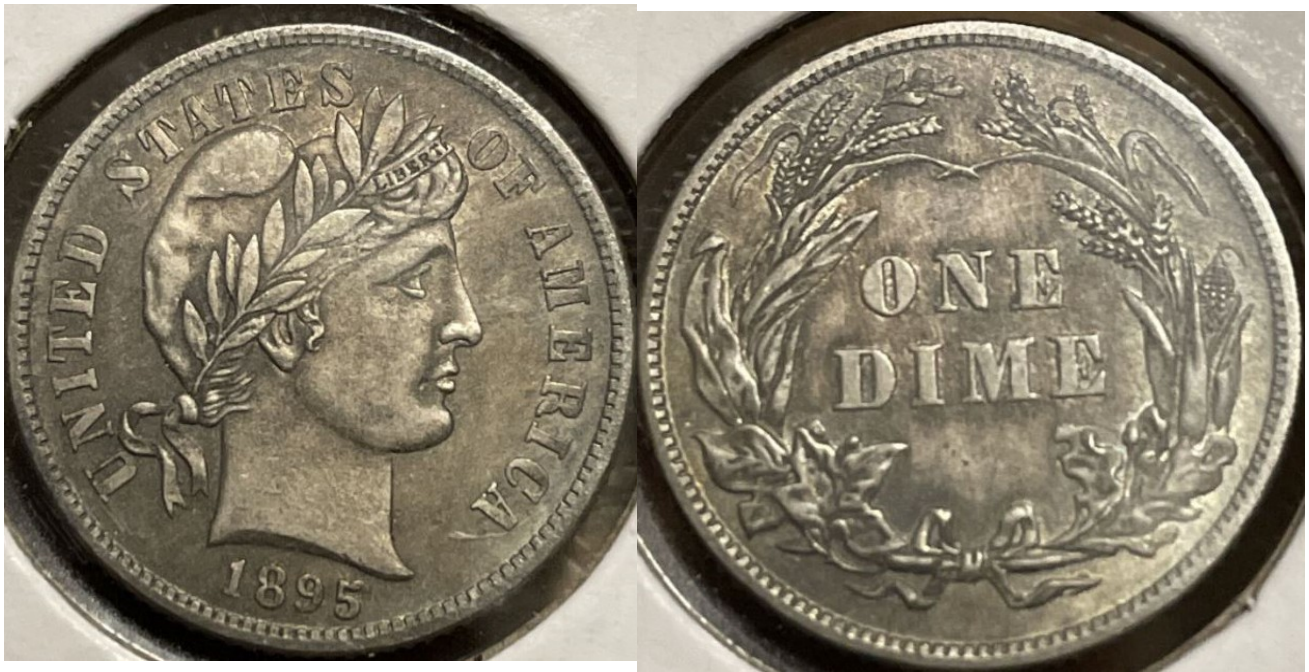
“Modern” Counterfiet Found on eBay (2021)

For this counterfiet, many of the details are incorrect. The letters in “LIBERTY” are not the correct shape and size. Secondly, all of Liberty’s facial features look “masculine” from the eyes to the lips. In addition, the width of the numbers in the date are too small. As for the reverse, its details looked “dull” and “cartoonish”. Still, a better copy than the first example.