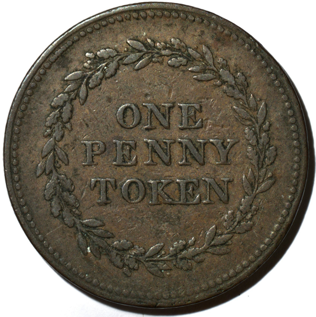
The reverse depicts a wreath. (Actual size is 34 mm.)

A collection of tokens of this period is usually left to a very discriminating collector who painstakingly will form a collection over a period of many years. A collector of these tokens will need the Paul and Bente Withers book, British Copper Tokens 1811-1820 , published by Galata Press in 1999. The book is well researched with excellent photos, and realistic rarity ratings, and has done much to revive interest in the series. Unlike many of the British Conder / Provincial tokens of the late 1700s that were made for collectors, this series was meant to circulate. They are from the time of the Industrial Revolution, and many of the pieces pertain to the mining industry, others to merchants, and some to the workhouses. While many of the rarities are truly rare, that does not necessarily translate into expensive. With that said, expect to pay a few hundred dollars for a piece in this condition.