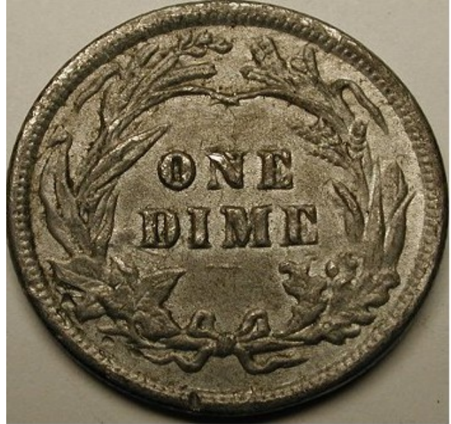
Cast in Base Metal from Damaged Forms Images from the John Frost Collection