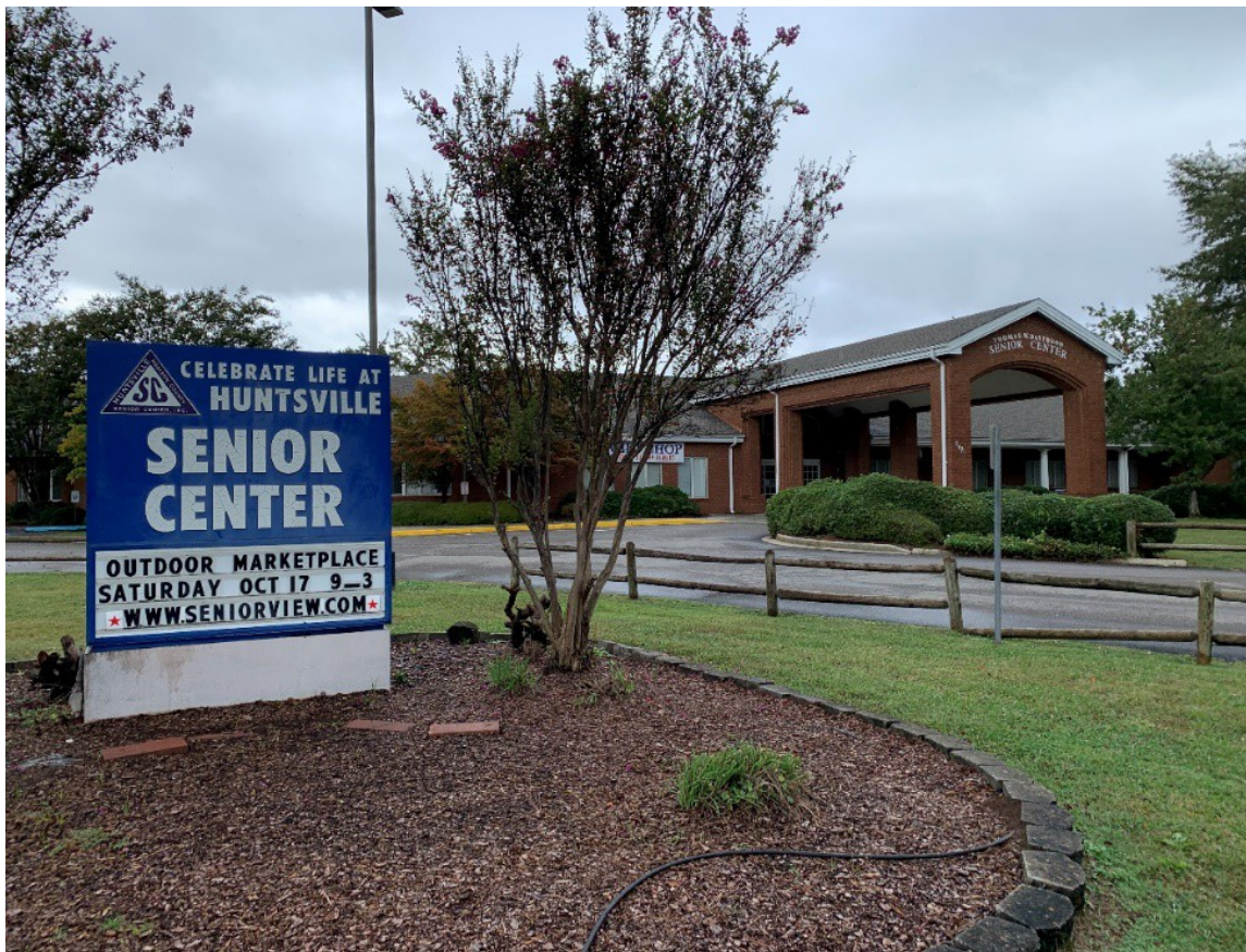
Huntsville Senior Center

The table below is a listing compiled by me from reviewing the MCCC Secretary's notes and the MCCC Newsletter for the meeting number, meeting dates, location, and reasons for changes.