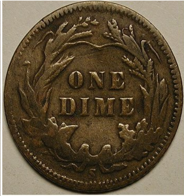
Die Struck in Copper Images from Jim Carr Collection

As I was reviewing coins on eBay recently, I discovered two additional counterfeit Barber dime examples. The example depicted below was such a "crude" copy, it made me laugh when I found it! Lady Liberty looked like Crusher's mother from Bugs Bunny fame!