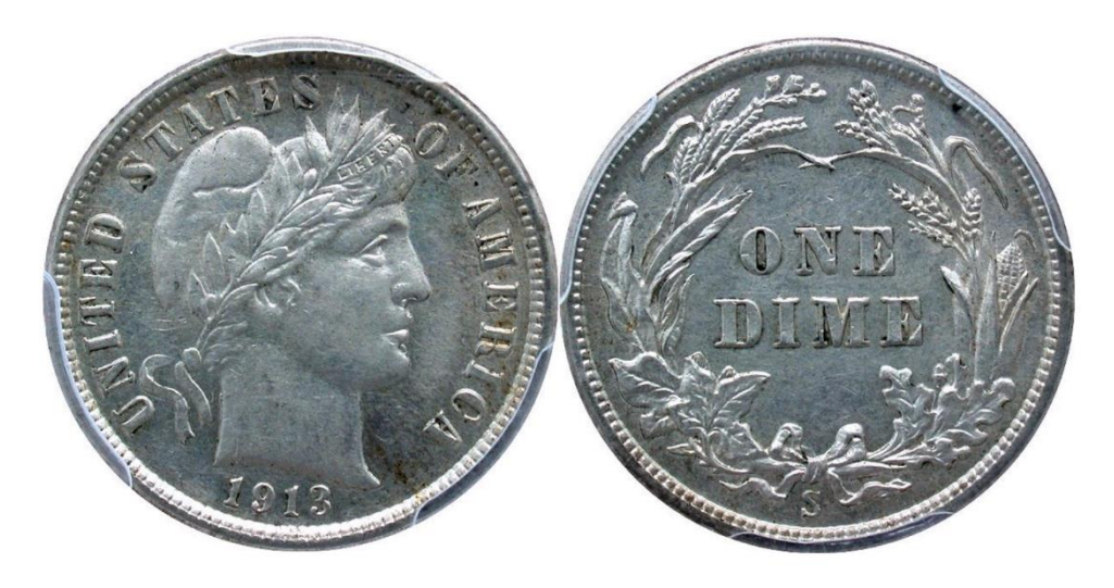
1913-S AU58 PCGS

As most of you know, I mainly collect Barber dimes. As I began reviewing the Barber dime inventory at the show, I noticed a trend – the majority of the high quality dimes were graded MS64 through MS67, with an occasional VF or EF coin. What was vastly lacking at the show were coins graded between AU50 and MS63. I did find a few in this category: