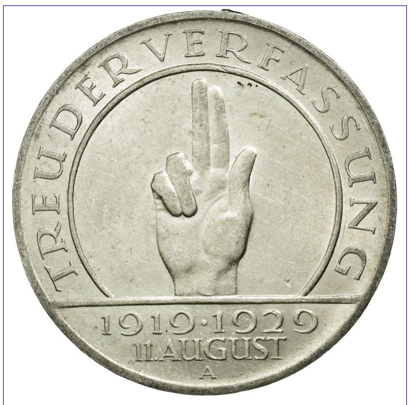
The obverse of the 1929 3 Mark Constitution Commemorative