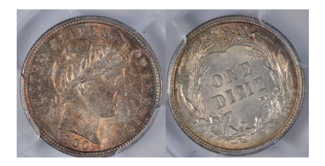
1900 MS63 PCGS