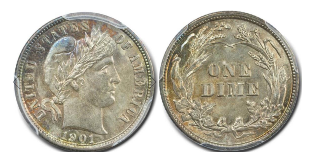
1901 MS62 PCGS