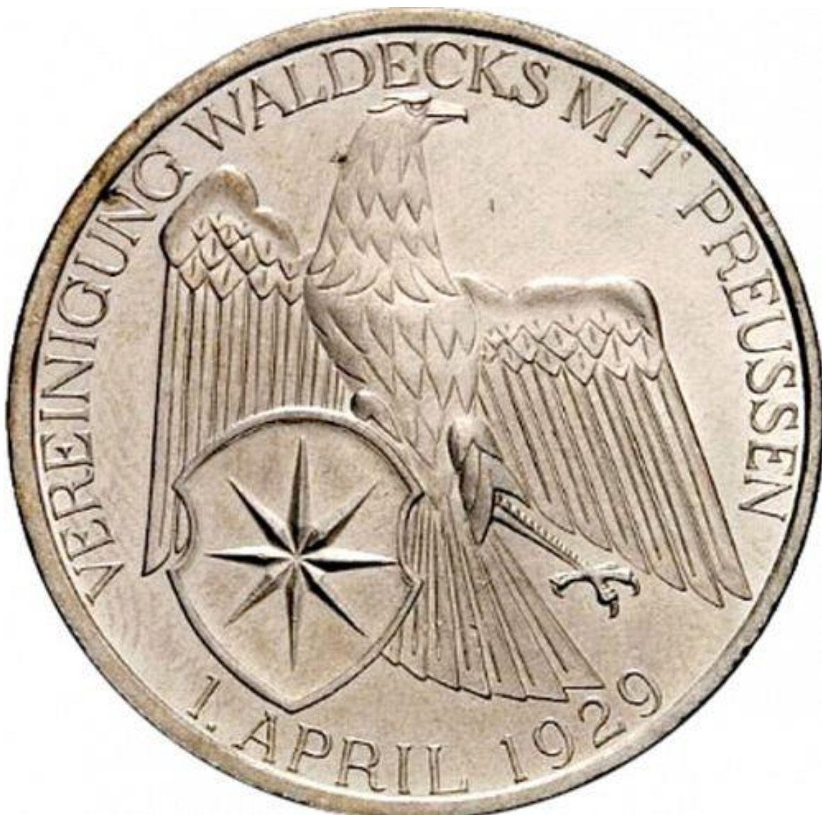
The obverse of the Waldeck/Prussia Union Commemorative

Visit us on the web at http://mccc.anacclubs.org/