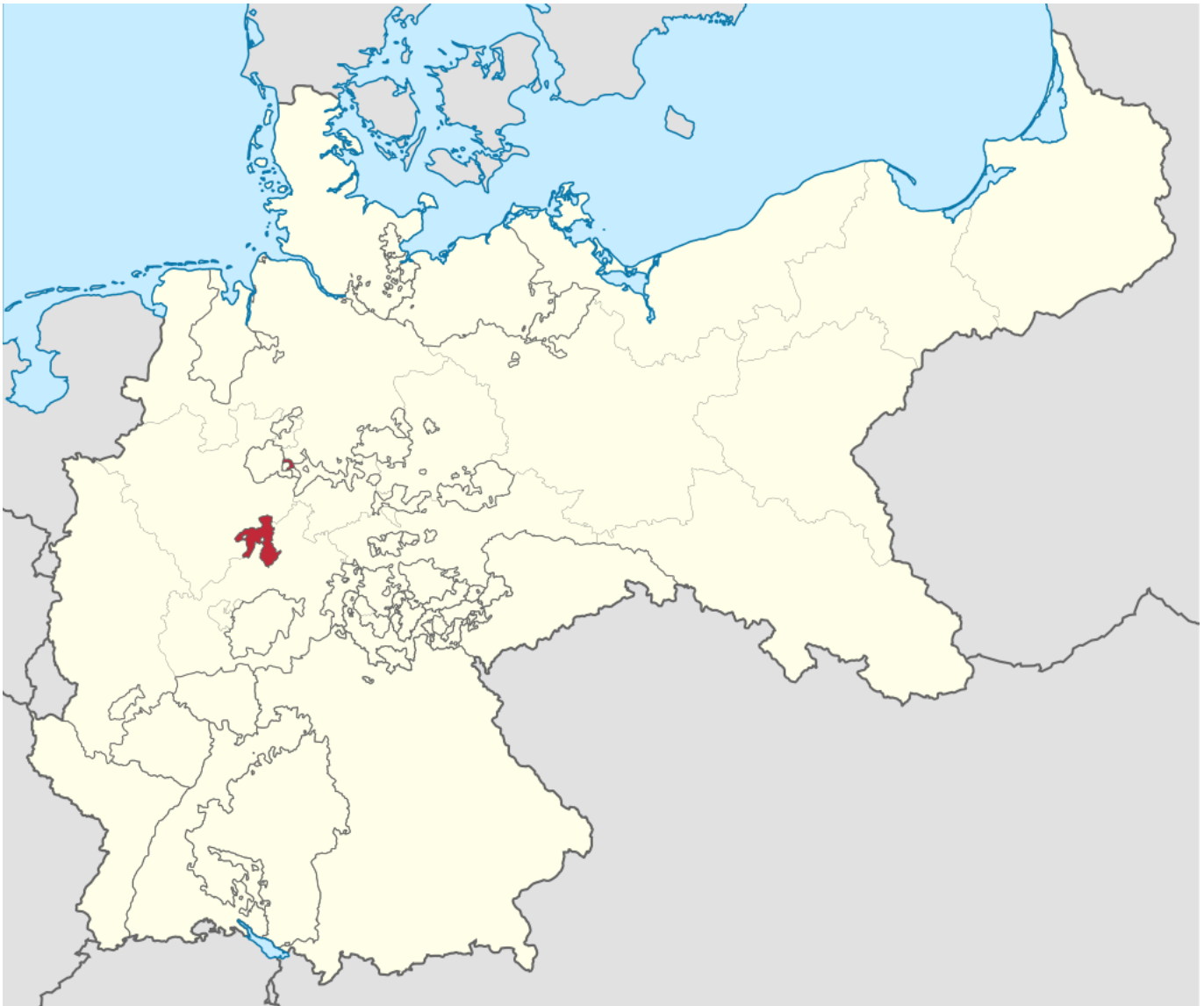
Waldeck within the German Empire. The small northern territory is Pyrmont while the southern lands are Waldeck.

Why not bring a friend to the next meeting?