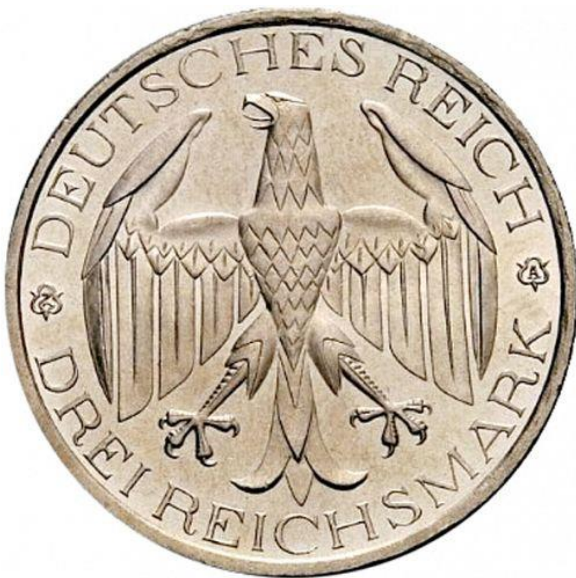
The reverse of the Waldeck/Prussia Union Commemorative