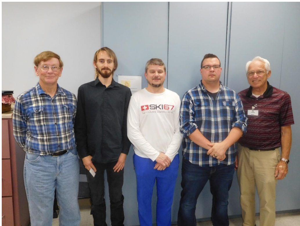
2020 MCCC elected officers