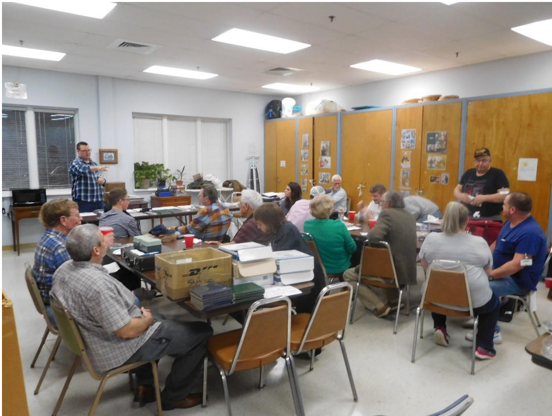
Auction in progress at the meeting