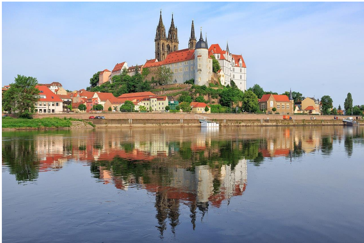
Albrechtsburg and Cathedral

Why not bring a friend to the next meeting?