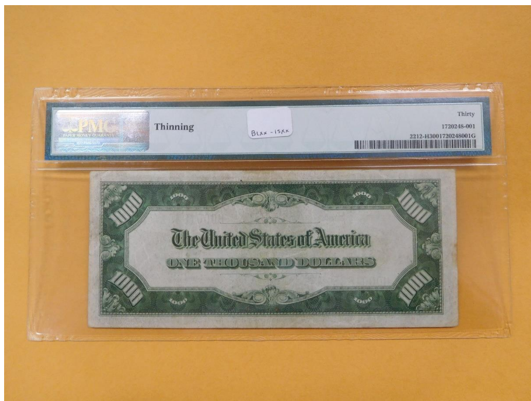
From the collection of Greg Ward, shown at the meeting Back of $1000 note, series 1934A