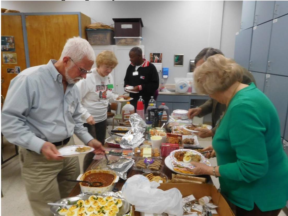
Club members enjoying the holiday pot luck dinner