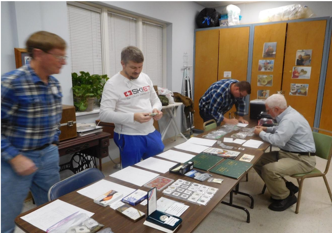
Club members getting ready for club auction at November 26 meeting