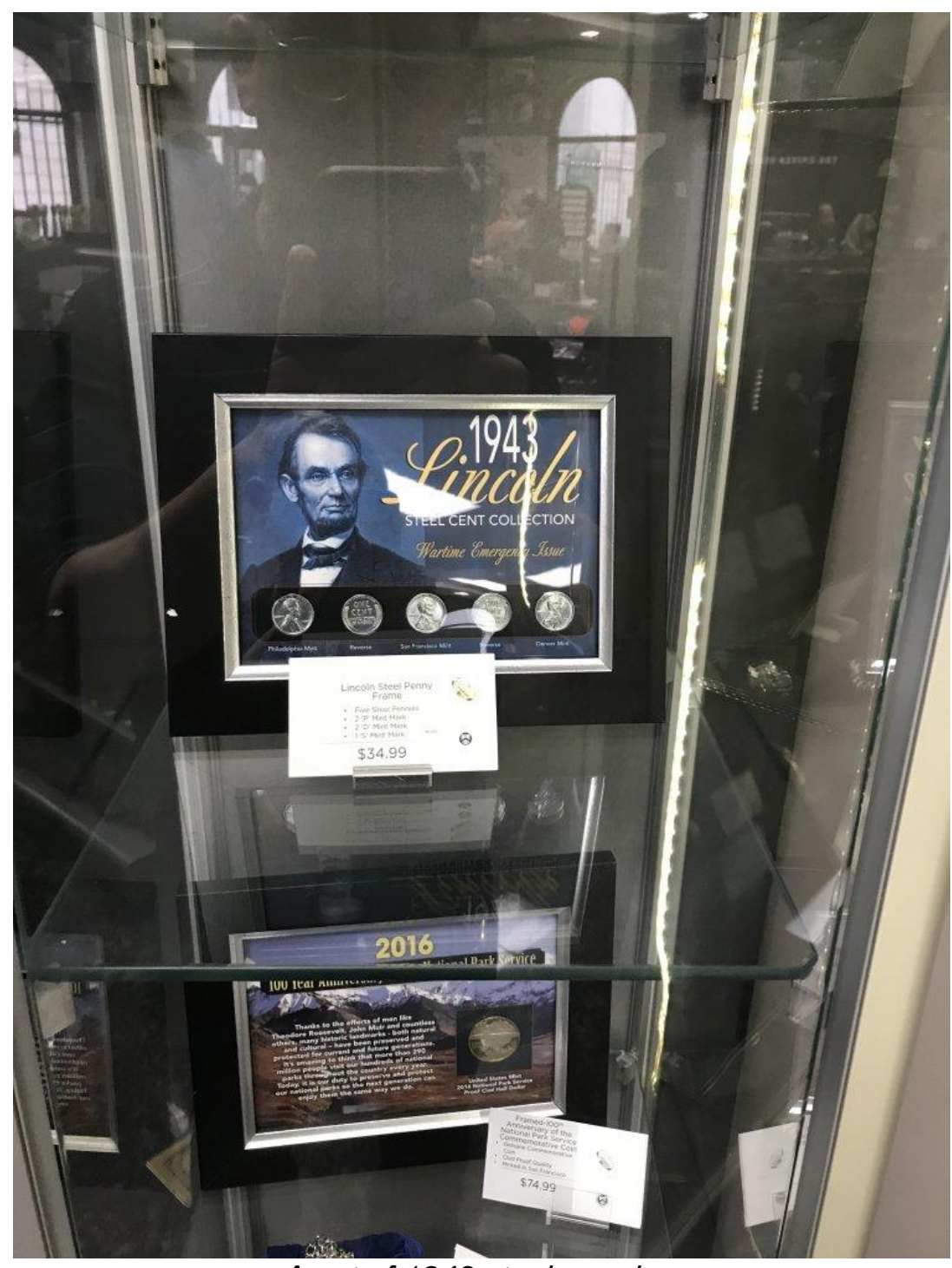
A set of 1943 steel pennies.