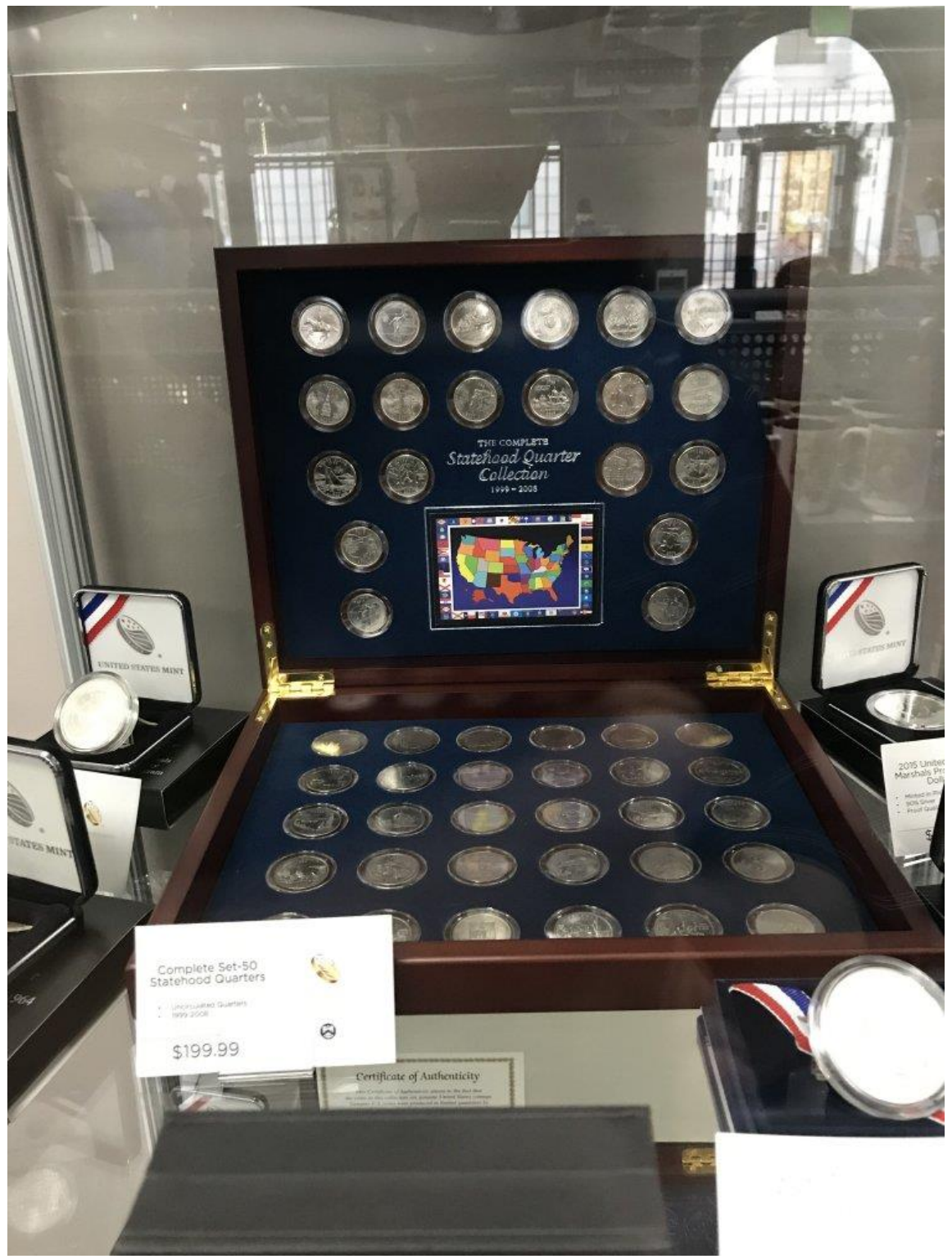
A set of state quarters in a nice wooden display box.