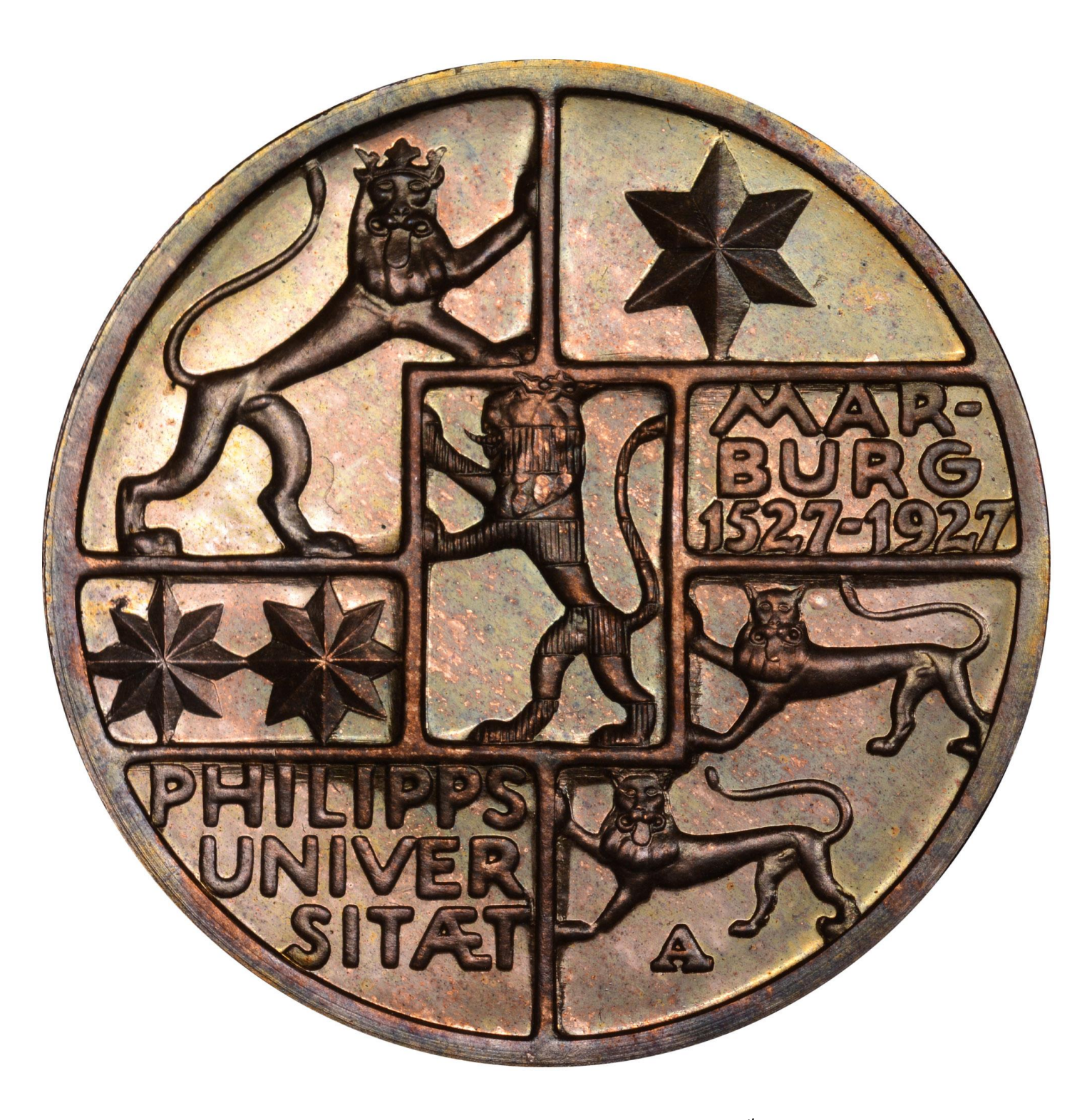
This 3 mark commemorative was issued in 1927 for the 400<sup>th</sup> anniversary of Philipps University. Also note that the edge inscription "EINIGKEIT UND RECHT UND FREIHEIT" means "Unity and Justice and Freedom."