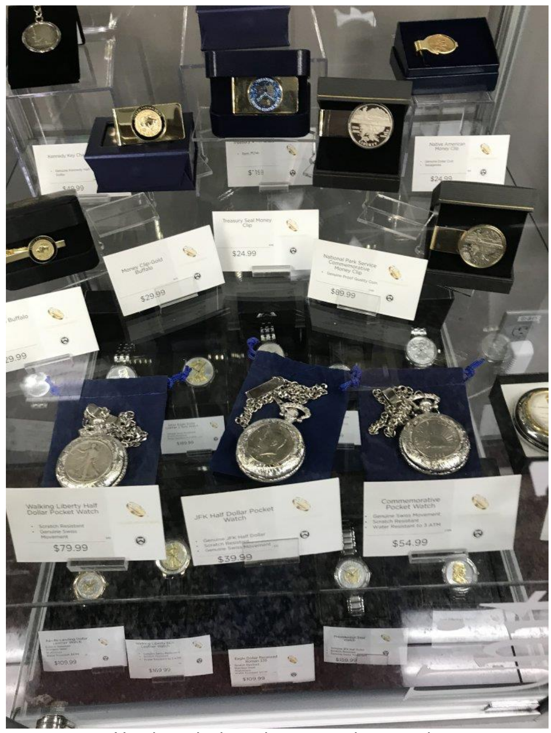
Numismatic time pieces are also on sale.