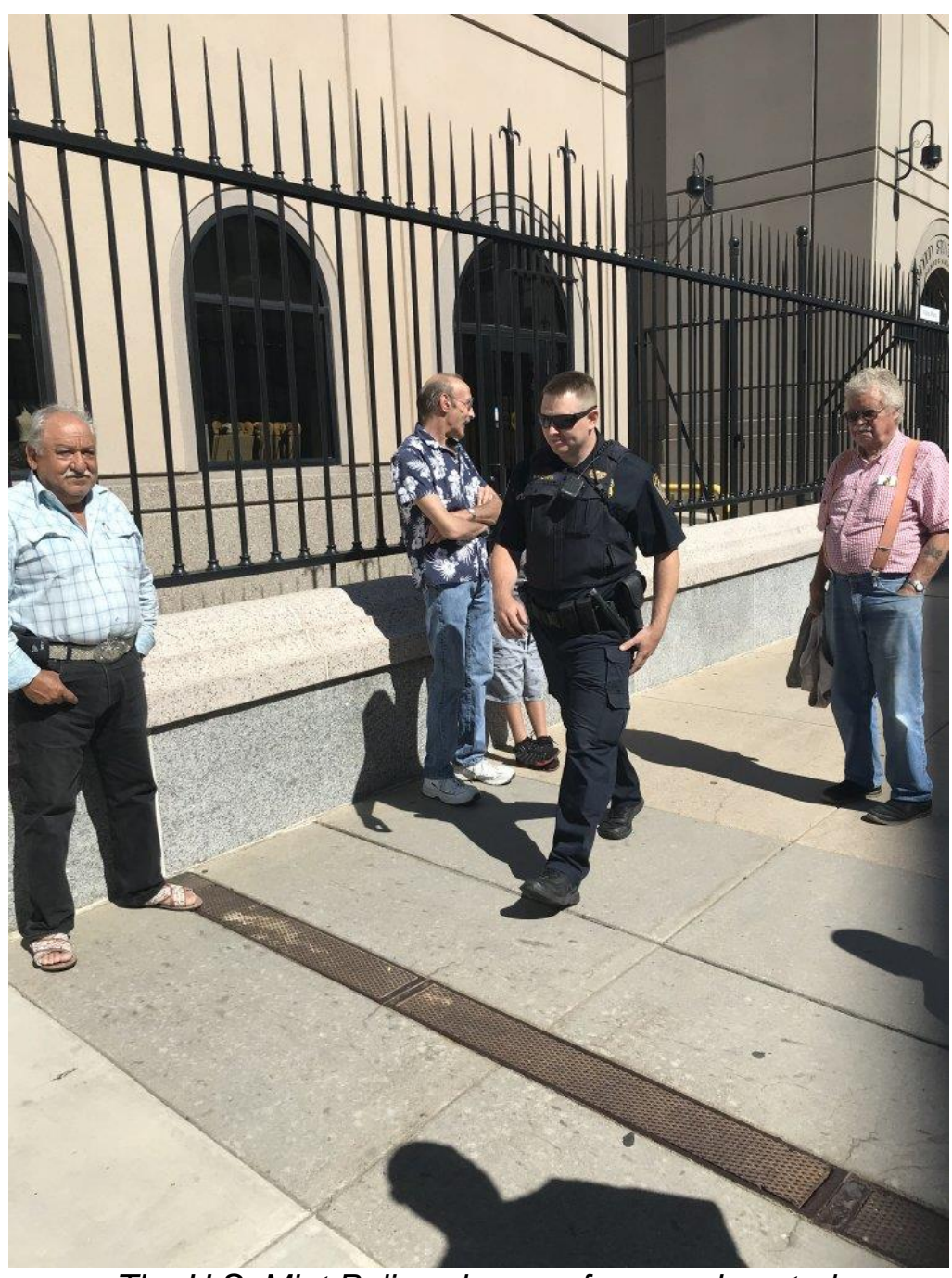
The U.S. Mint Police show up for crowd control.