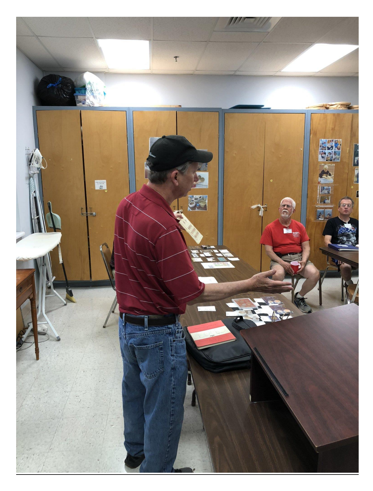
The Auction Begins.