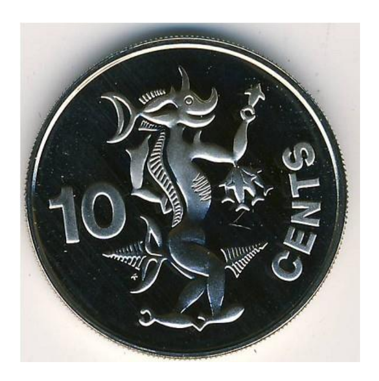
A Coin from the Solomon Islands

Rules for users of the member notice page: All notices are free and should be directed to the editor of the Madison County Coin Club newsletter. Notices will be limited to a maximum of 8 lines, including the name and contact information. The person entering the notice must answer all responses to notices. Preference will be given in the following order to notices when the page is oversubscribed in a single month: