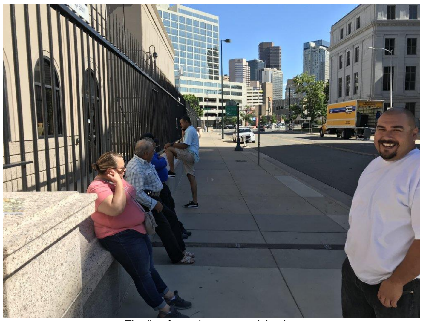
The line forms in eager anticipation.

"Numismatics, like some aspects of astronomy and natural history, remains a branch of learning in which the amateur can still do valuable work, and it is on the great collecting public, or rather on that part of which is interested in the subject at a scientific level, that the progress of numismatic science largely depends."