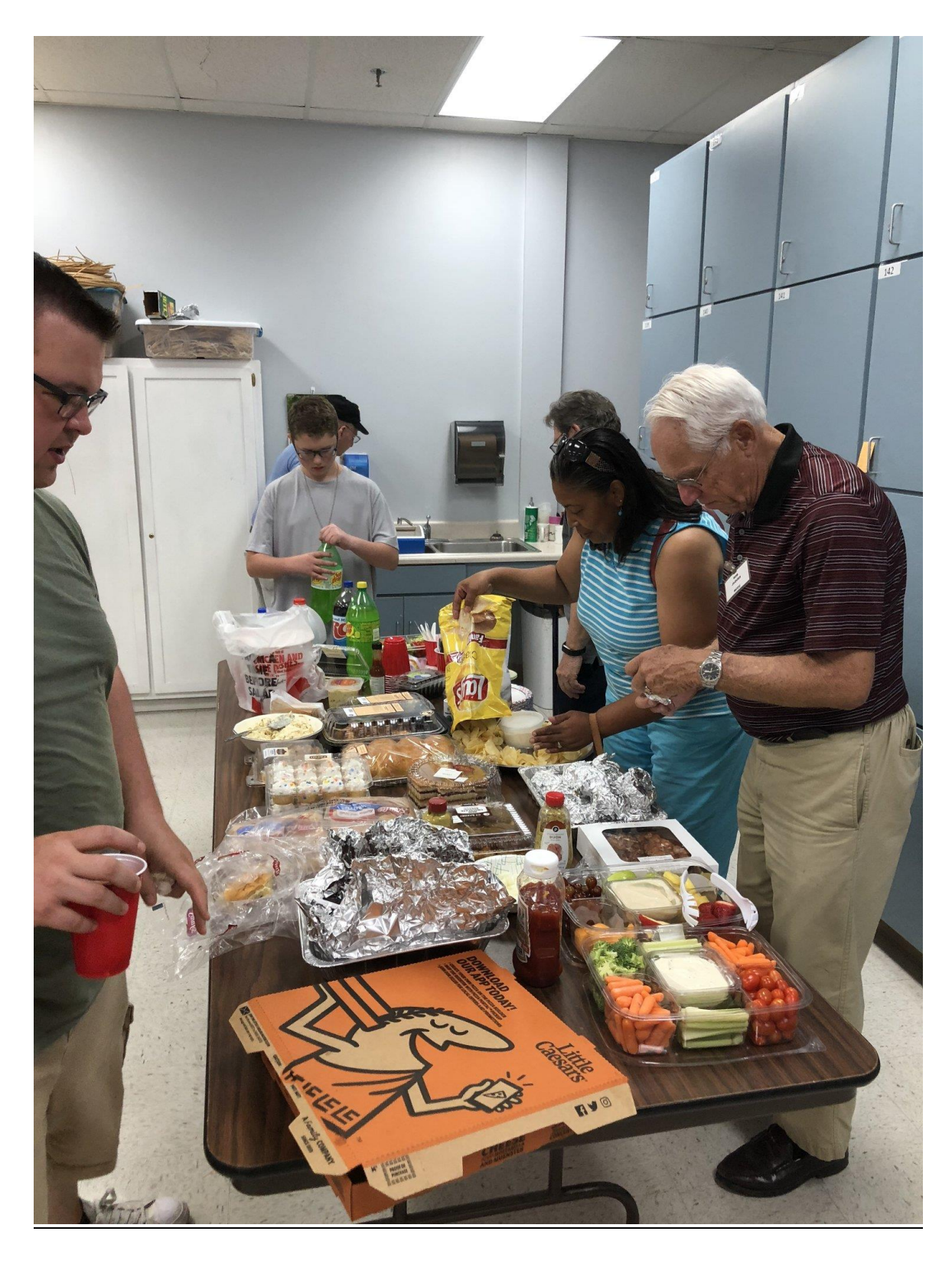
Good times had by all.