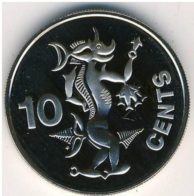
A Coin from the Solomon Islands

Rules for users of the member notice page: All notices are free and should be directed to the editor of the Madison County Coin Club newsletter. Notices will be limited to a maximum of 8 lines, including the name and contact information. The person entering the notice must answer all responses to notices. Preference will be given in the following order to notices when the page is oversubscribed in a single month: