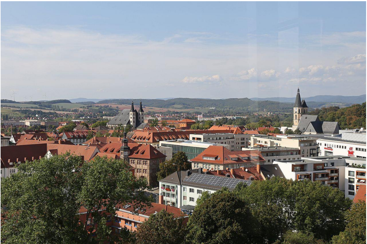
View of the city center