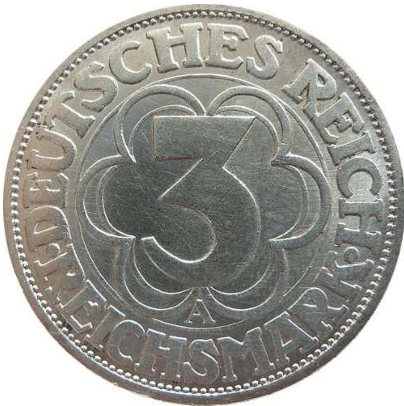
The reverse of the 1927 3 mark Nordhausen commemorative. Note that only 100,000 3 mark coins were minted.