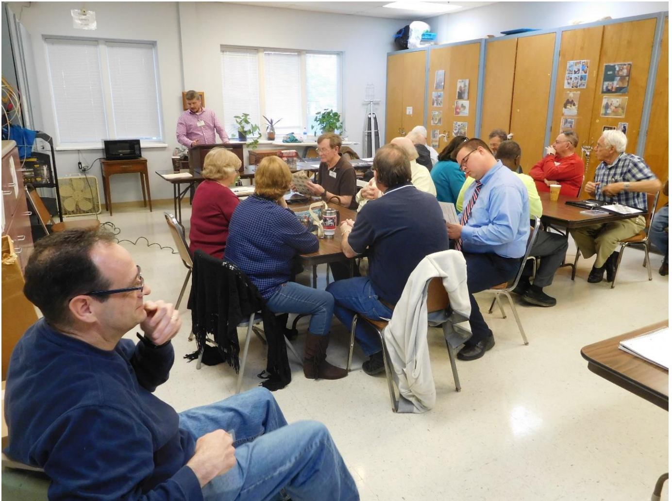
Members and guests at the meeting

Just a reminder- the next meeting after April's meeting will be on June 25. The meeting will be the biannual Pot Luck, Auction and Member Selling Night. Please make plans to bring a food dish to share with your fellow club members. The club provides the drinks, paper plates and plastic items.