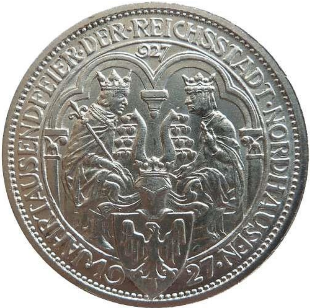
The obverse of the 1927 3 mark Nordhausen commemorative depicts the King Heinrich I and Queen Mathilde

Visit us on the web at http://mccc.anacclubs.org/