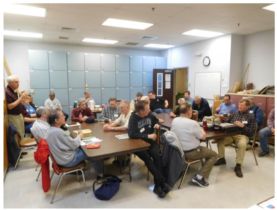
Members and guests at the meeting