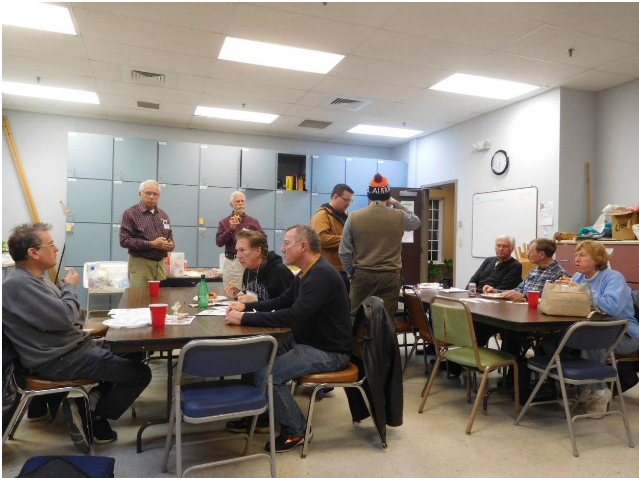
Members and Guests at the Meeting