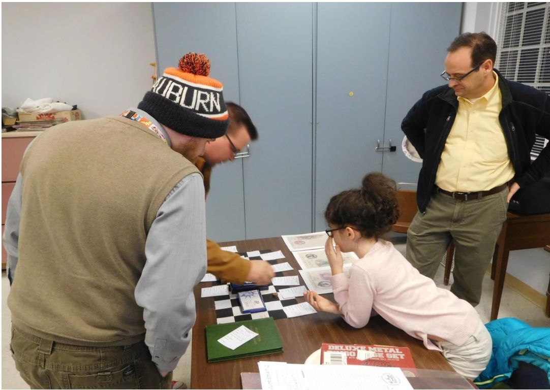
Club Members looking at auction lots