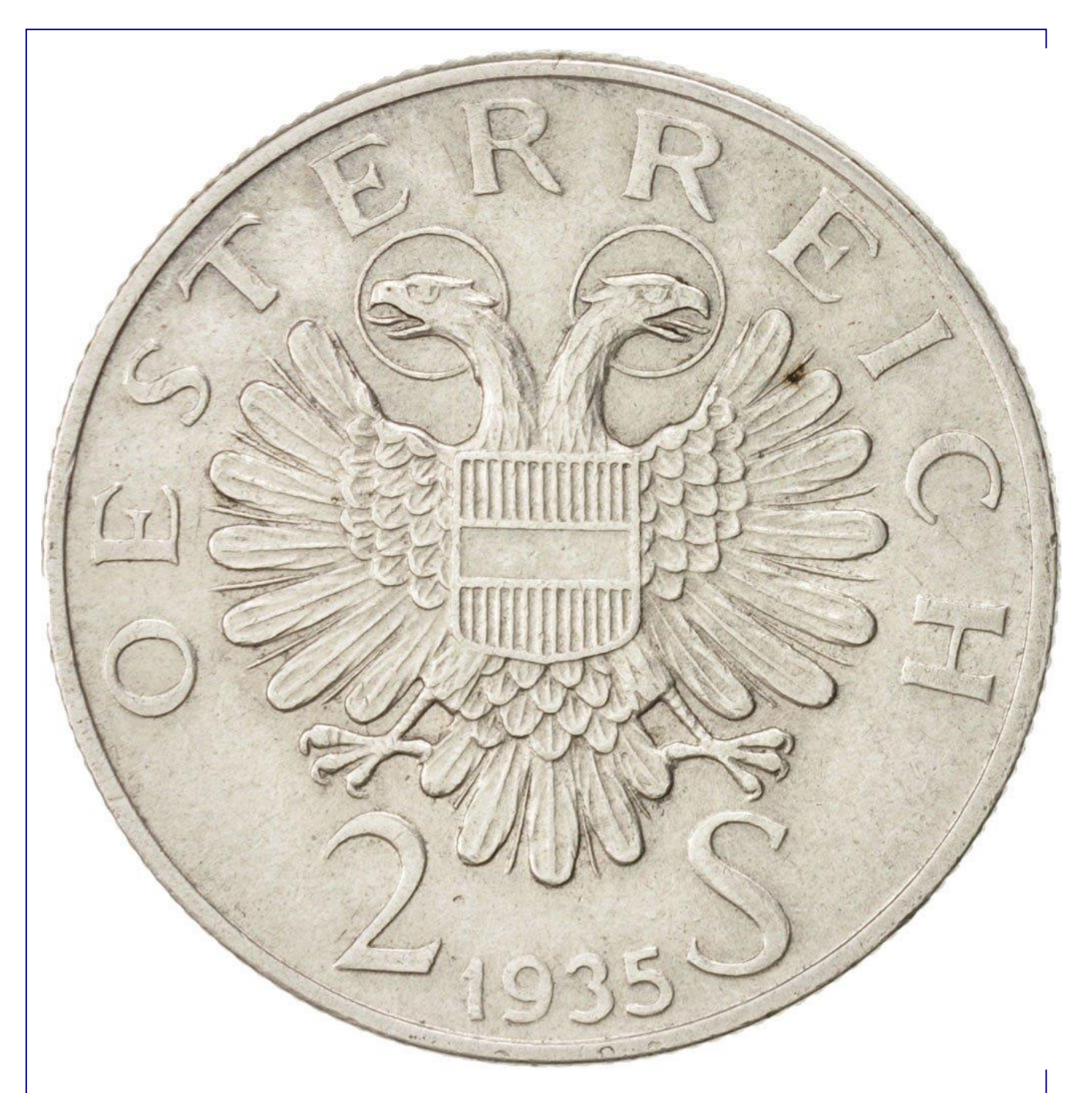
The reverse of the Austrian 1935 2 schilling commemorative