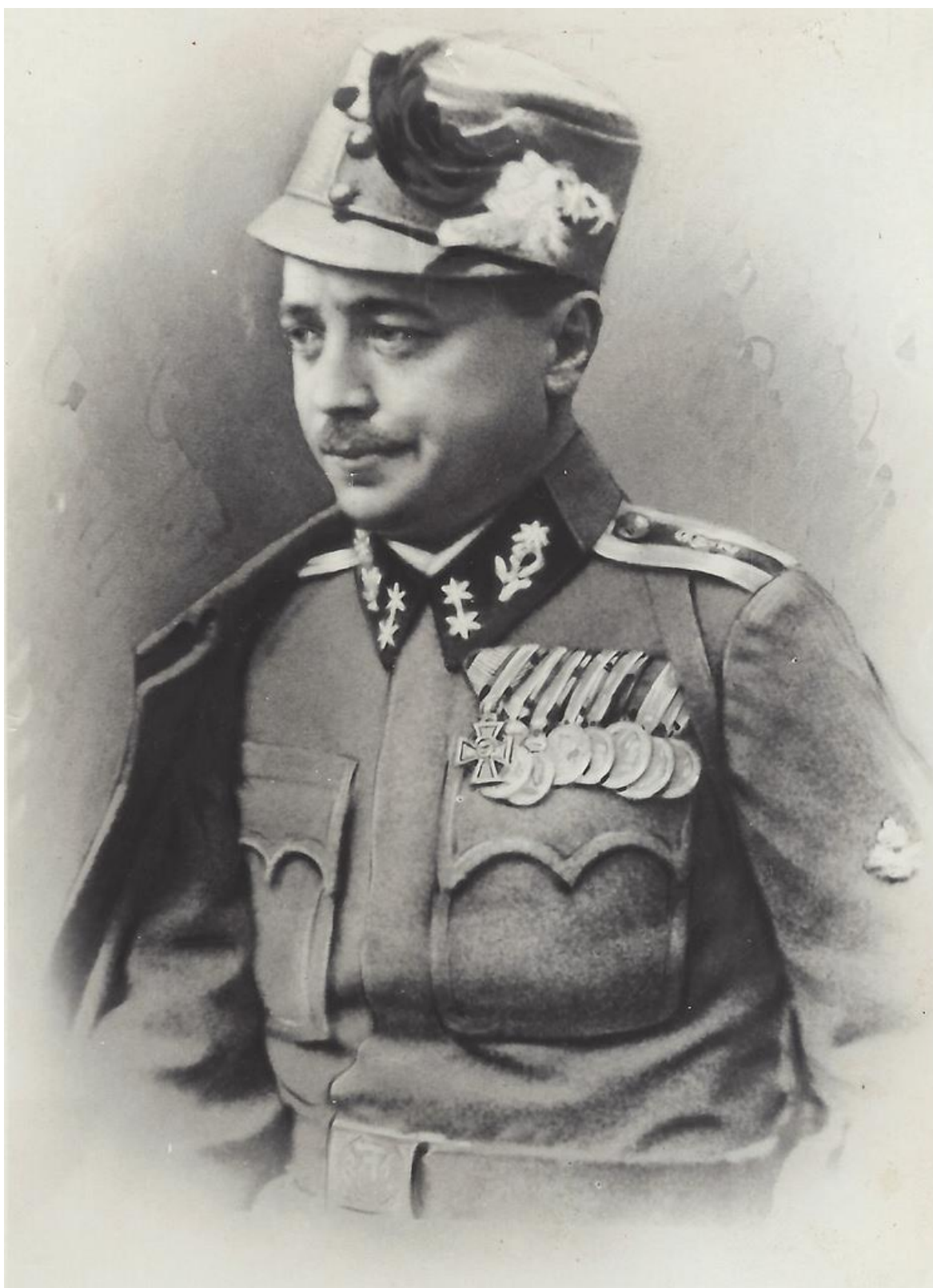
Dr. Engelbert Doffuss