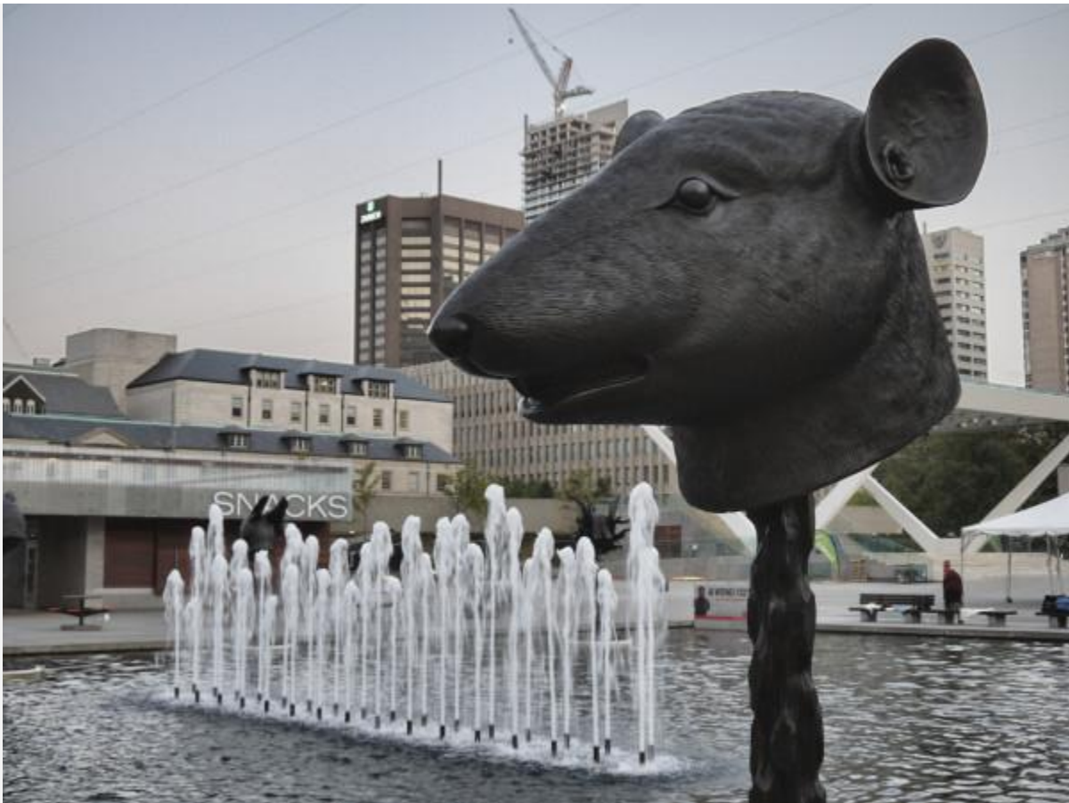
The rat represents wisdom, while the ox symbolizes diligence.