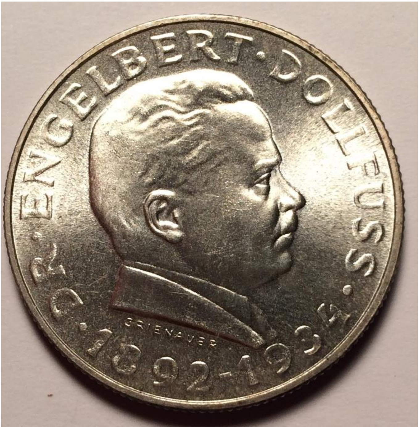
The obverse shows his bust facing right and the inscription Dr. Engelbert Dollfuss 1892-1934