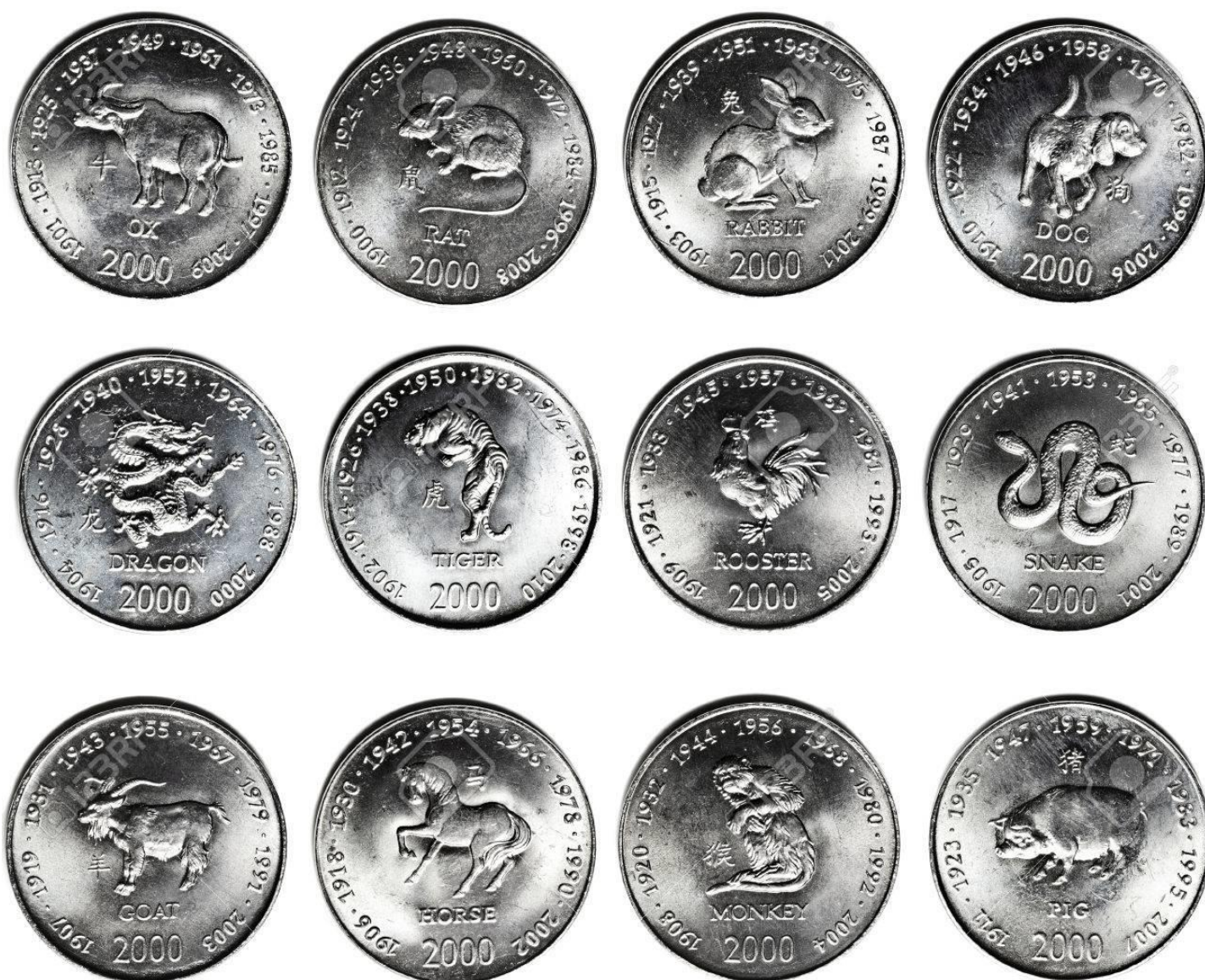
A set of 12 coins Chinese Zodiac 10 shillings Republic of Somalia 2000 year, OX, RAT, RABBIT, DOG, DRAGON, TIGER, ROOSTER, SNAKE, GOAT, HORSE, MONKEY, and PIG

Visit us on the web at http://mccc.anacclubs.org/