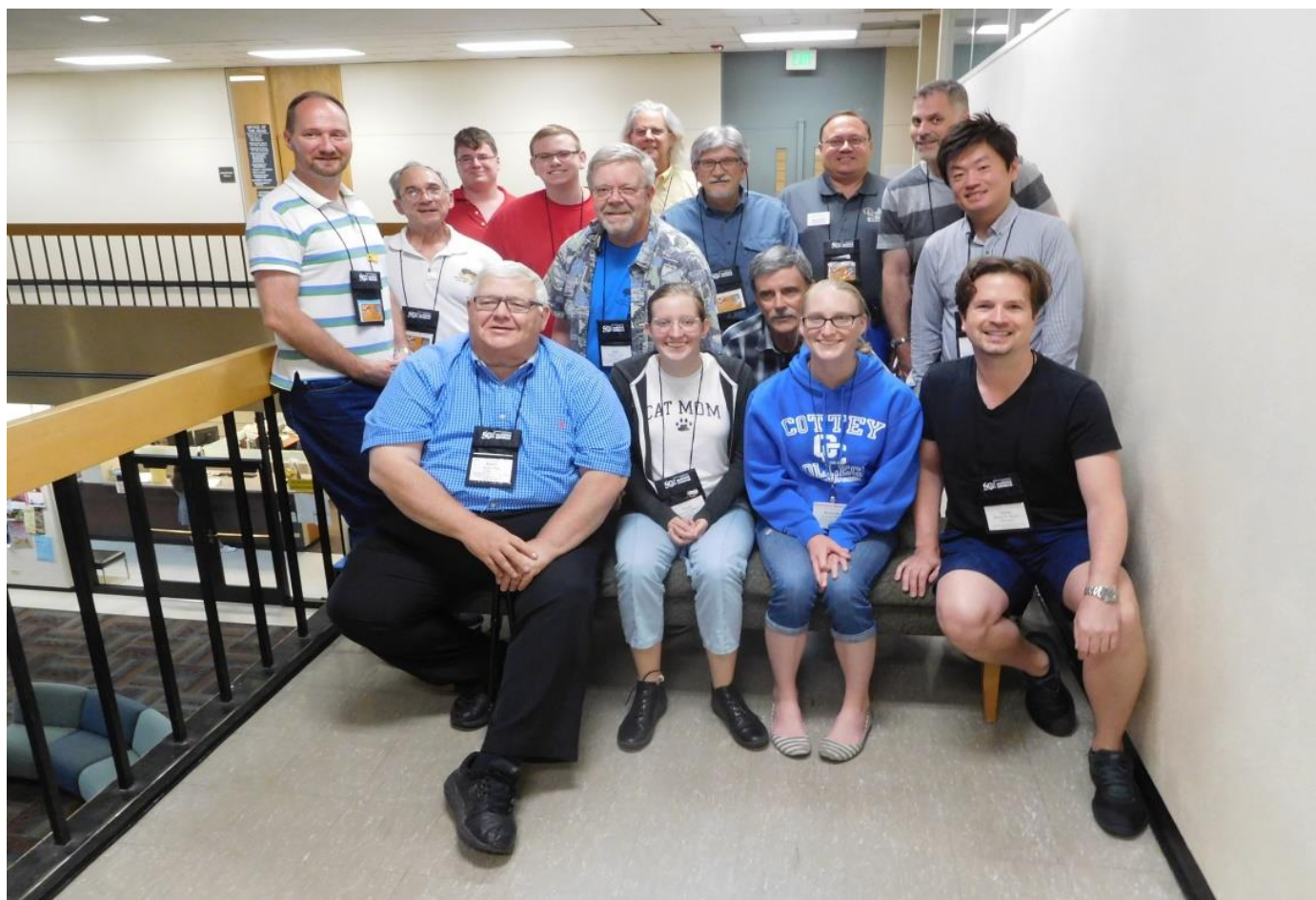
"Numismatic Publishing" Class Photo, June 20, 2018

at Summer Seminar are recognized experts in their numismatic field and freely share their knowledge, time, experience and research. There were a number of out of class activities such as touring local attractions, taking mini-seminars in the evening, attending the Young Numismatist (YN) auction, or going to the Colorado Springs Coin Show. Extended hours at the ANA Headquarters allowed access to the Money Museum, library, and gift store. The ANA staff was involved in all activities and provided great support to both instructors and students. If you have not attended an ANA Summer Seminar session, I highly recommend you do. The ANA and a number of numismatic organizations offer full and partial scholarships. Please check the ANA's web site ( www.money.org ) and other numismatic organizations web sites or publications for scholarship application and information. Thank you to the Georgia Numismatic Association (GNA) for awarding me the scholarship to allow me to attend the ANA Summer Seminar in 2018.