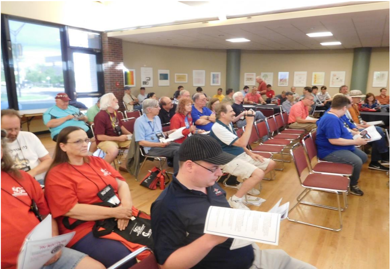
Large turnout for YN Auction held on June 19, 2018 at Colorado College