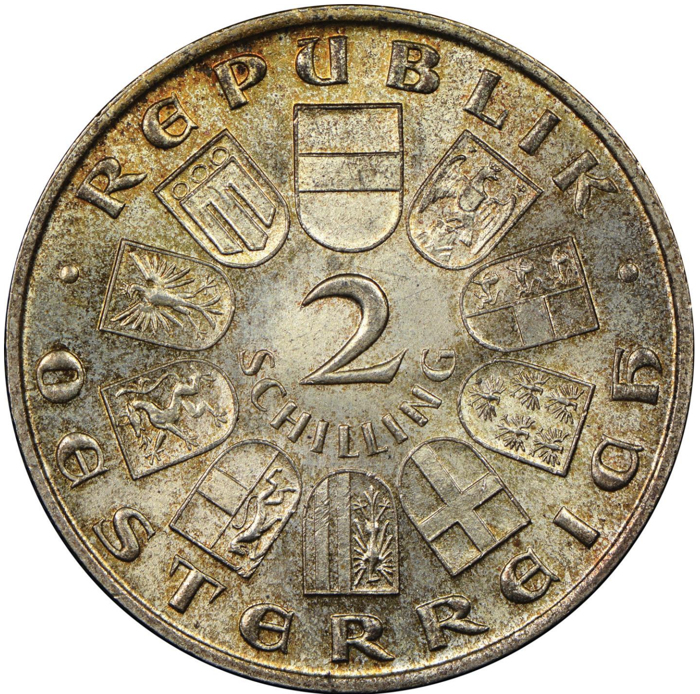
The reverse of the 1933 Austrian Two Schilling Commemorative