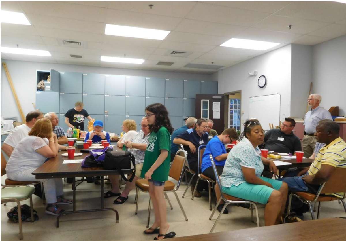
Club members enjoying the pot luck dinner

Why not bring a friend to the next meeting?