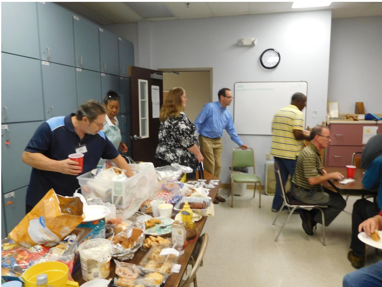
Members at the pot luck dinner with plenty of food to go around

The June 26 Independence Day celebration pot luck dinner, Buy/Sell/Trade Night and Auction was a great success. The meeting room was full of people. There was plenty of food to go around, and the auction sold everything except one lot. I want to thank everyone that bought some food to share.