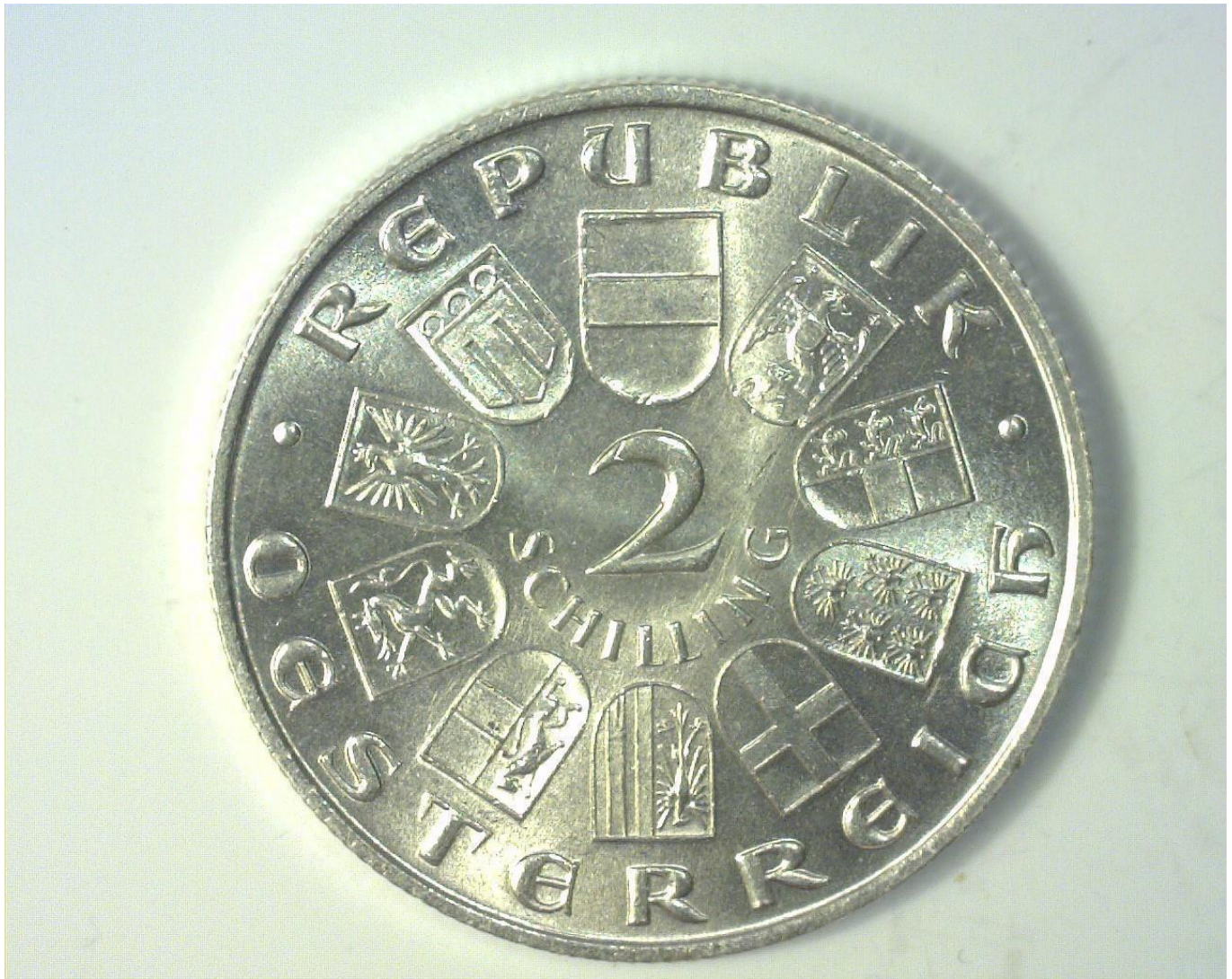
The reverse of the 1932 Austrian 2 Schilling