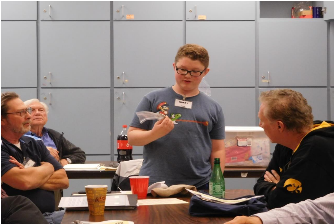
Show and Tell time