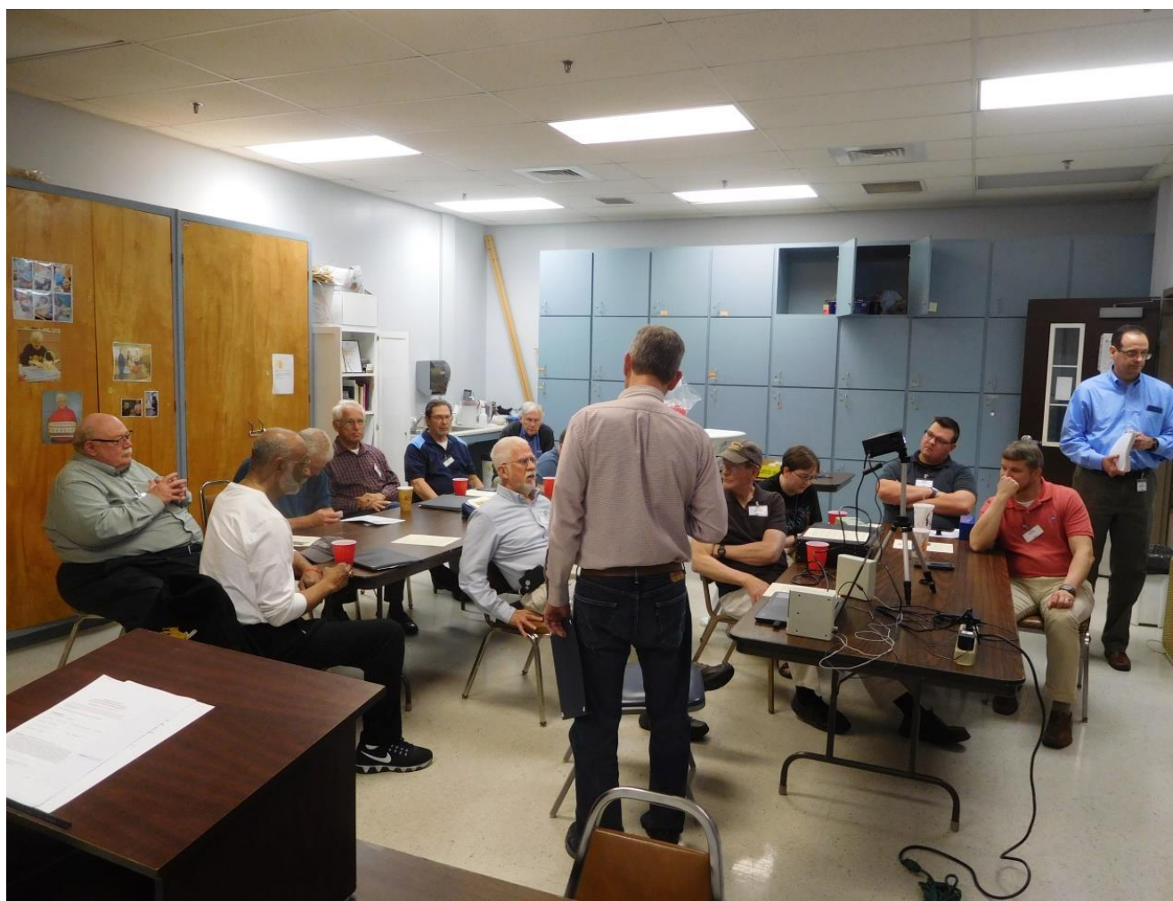
Members at the meeting April 24