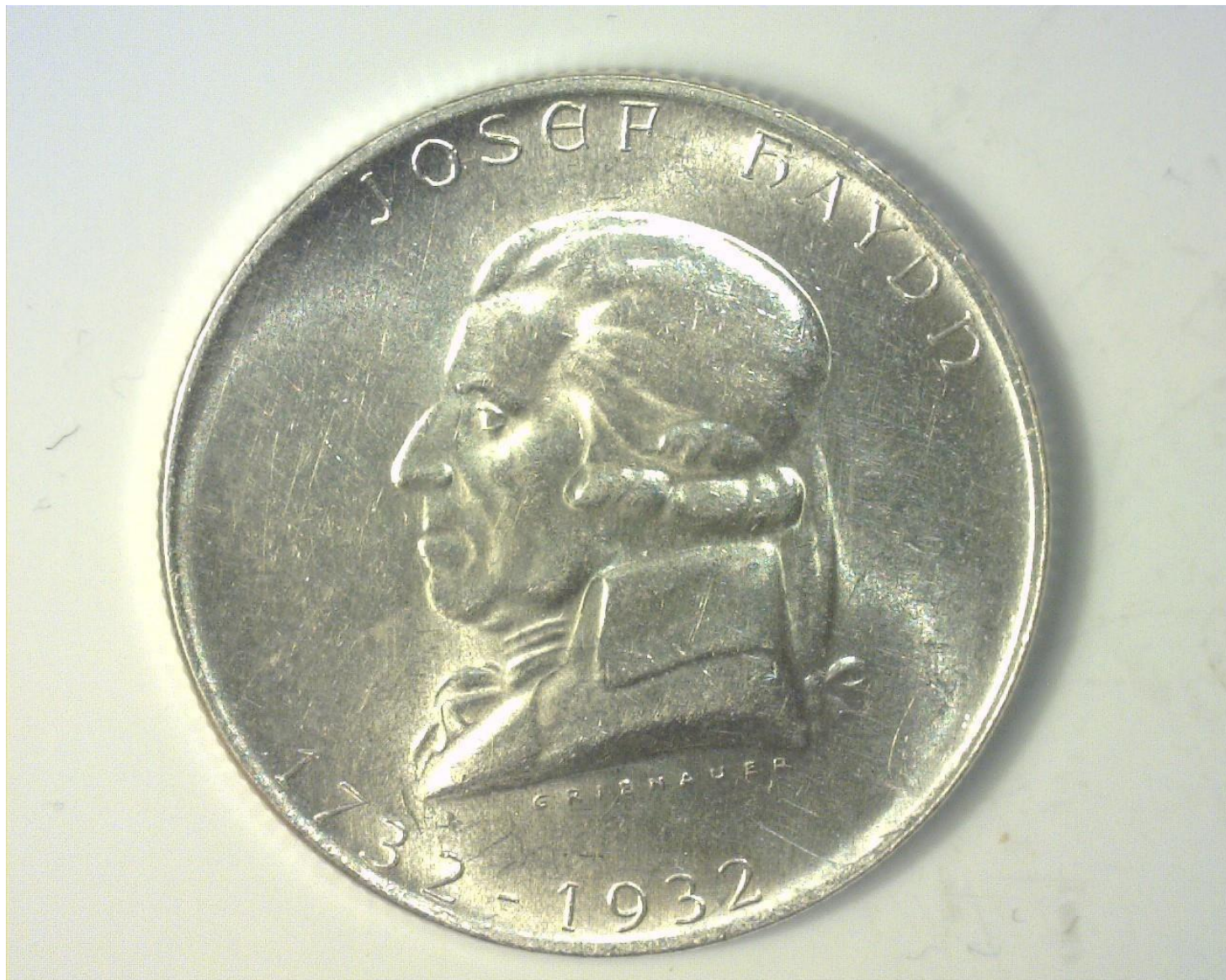
The obverse of the 1932 Austrian 2 Schilling