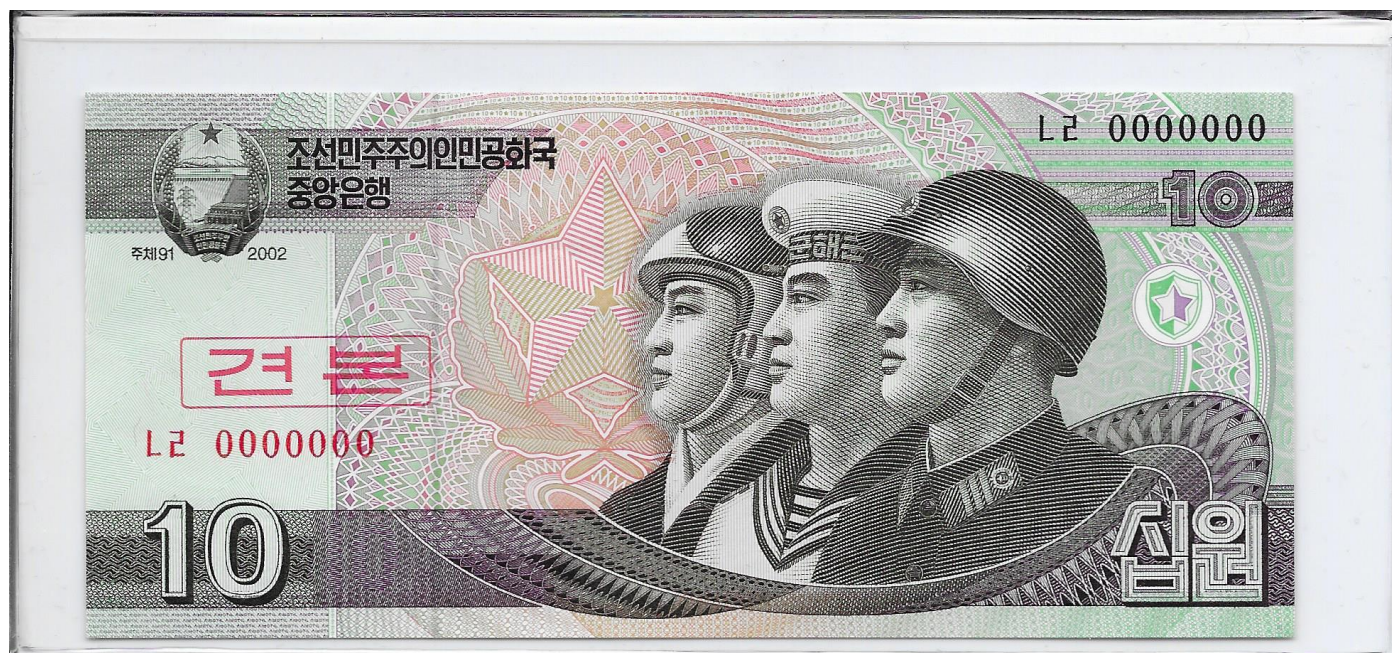
The front of the North Korean Specimen Note