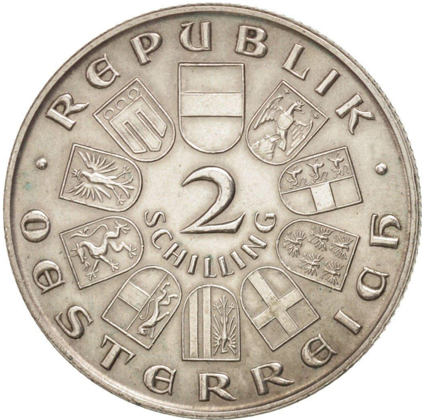
The 1930 Austrian Two Schilling Commemorative has the same reverse as the 1929 coin.