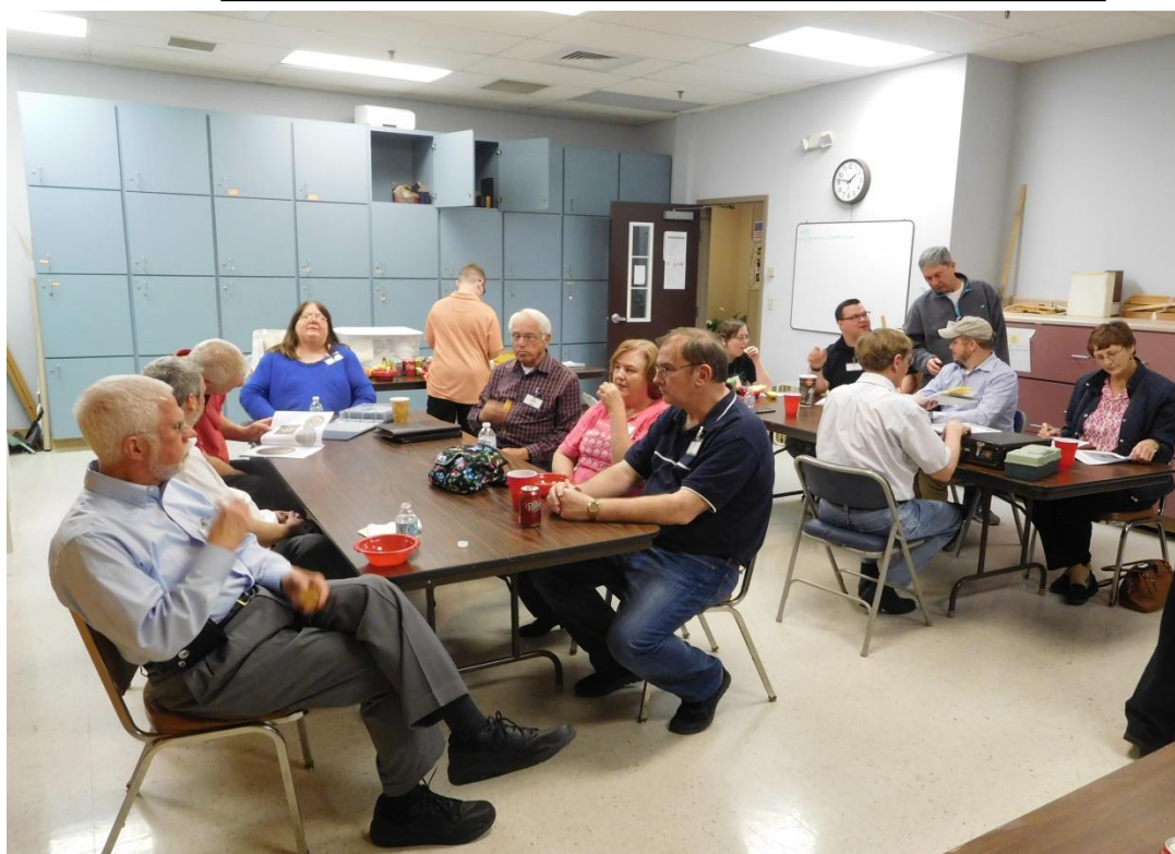
MCCC Members at February 27 Meeting