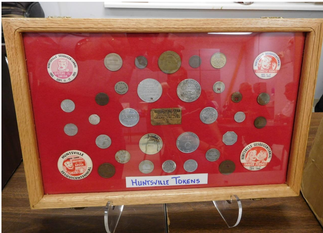
Display case Huntsville Tokens Charles Cataldo brought to the club meeting