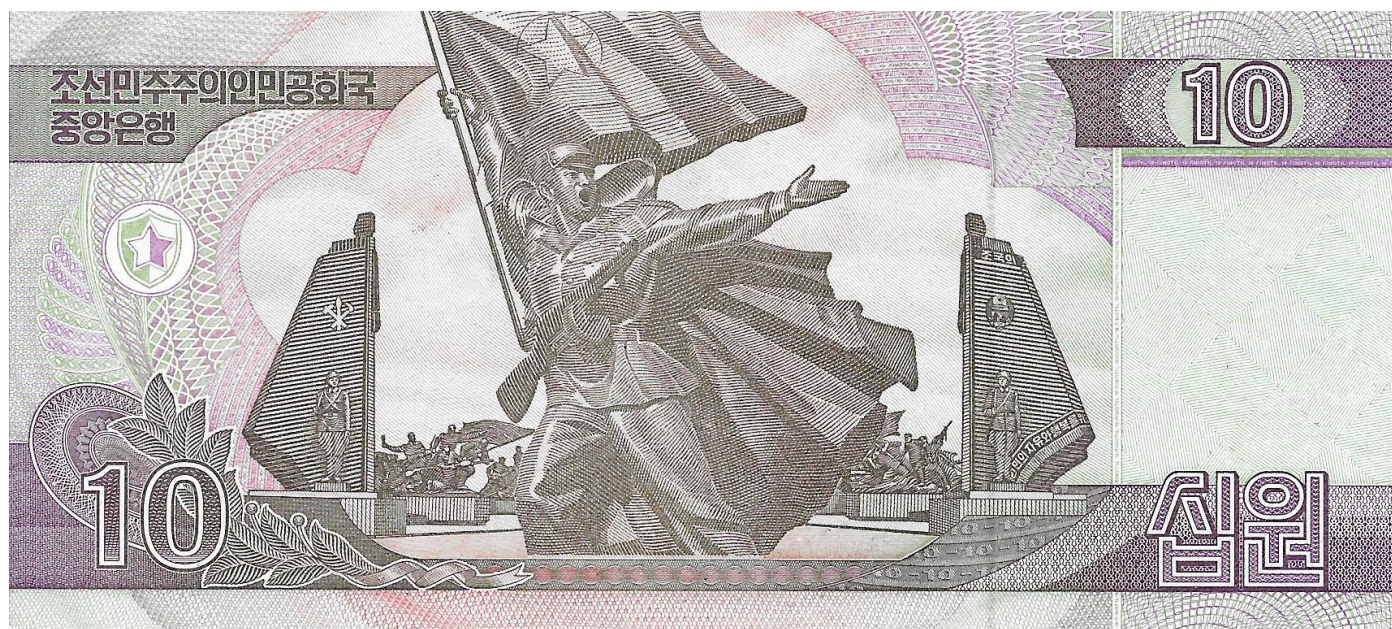
The back of the North Korean Specimen Note