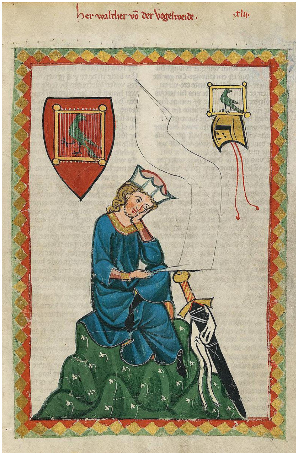
Portrait of Walther von der Vogelweide from the Codex Manesse .

The Codex Manesse is a book of songs/poetry, the single most comprehensive source of Middle High German Minnesang poetry, written and illustrated between c. 1304 when the main part was completed, and c. 1340 with the addenda.