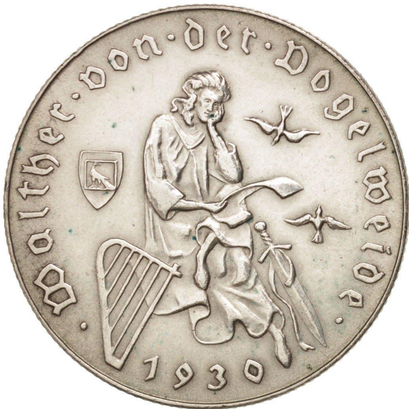
The 1930 Austrian Two Schilling Commemorative was issued for the 700 th anniversary of the death of Walther von der Vgelweide.