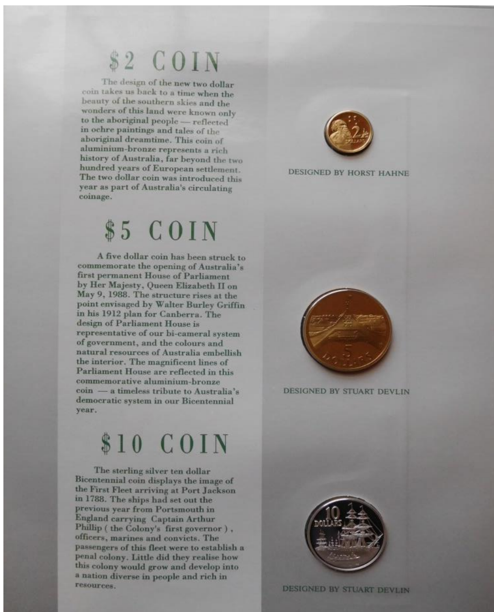
Obverse of Australian Coins from above

On September 11, I was the guest speaker at the Australian Numismatic Society (ANS) monthly meeting. I met about six ANA member at the meeting. I brought copies of the awarding winning MCCC Newsletter and The Numismatist and passed these out. One thing I learned in Australia is that the coin collectors I met strongly do not like “slabbed” coins and strongly disagree with the American grading companies using U.S. coin grade standards for Australian coins. The Australian coin grading standard is much tighter than the U.S. standard. Australian coins are stilled graded on “technical grade” versus in the U.S. “market grade”.