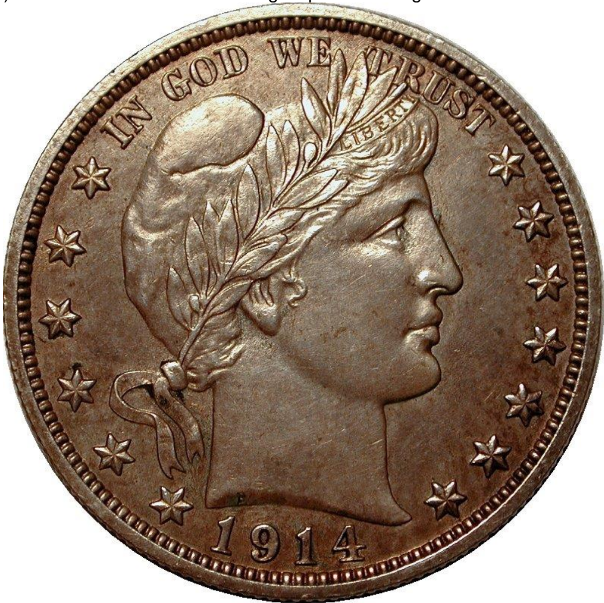
The obverse of the 1914 half

I have been a life-long collector of Barber Halves, and like many collectors, always searching for a "better grade". In the case of the 1914 Half, I was looking to improve on my F-12 grade with a VF or better coin. I knew this was going to be a challenging task so I was being patient, hoping I would find one at a coin show or online. One evening, in June 2010, I was searching the internet for the elusive grade I was pursuing. To my surprise, I found an exquisite example in AU+ condition for sale on Ebay. It was a true auction, and I was fortunate to be the highest bidder ($712) at the hammer. That was a bargain price for the grade!.