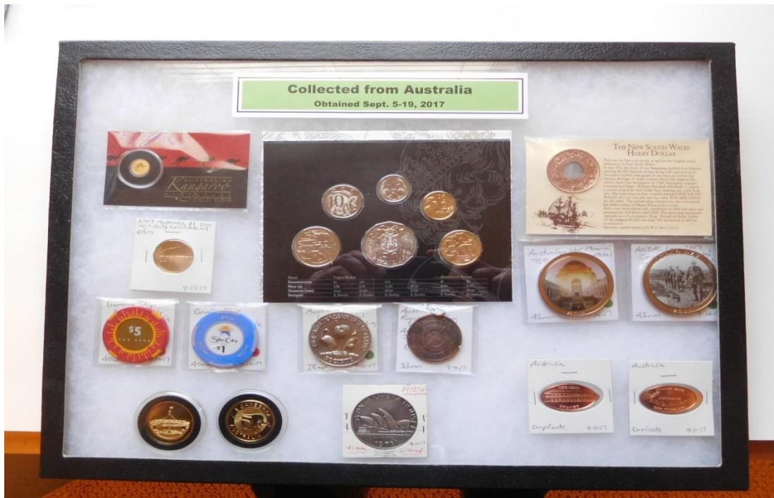
Display case of Australian Numismatic Items I got during my trip in Australia