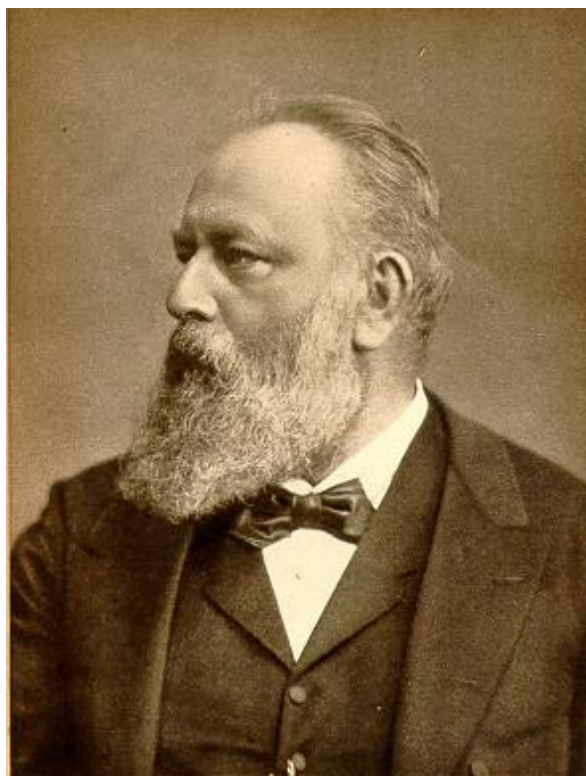
Theodor Billroth, considered the father of modern abdominal surgery, is honored on the Austrian 1929 two schilling coin.