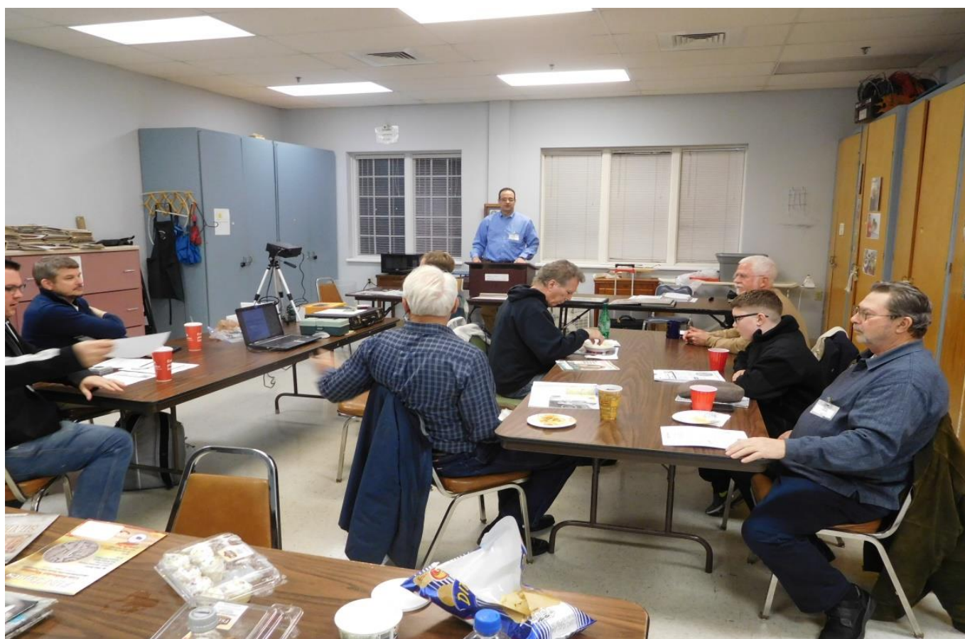
MCCC Members at January 23 Meeting

Please bring your ANA Membership Card or ANA Number to the meeting. We need to sign the yearly ANA form, and MCCC receives a $5 credit towards ANA club dues.