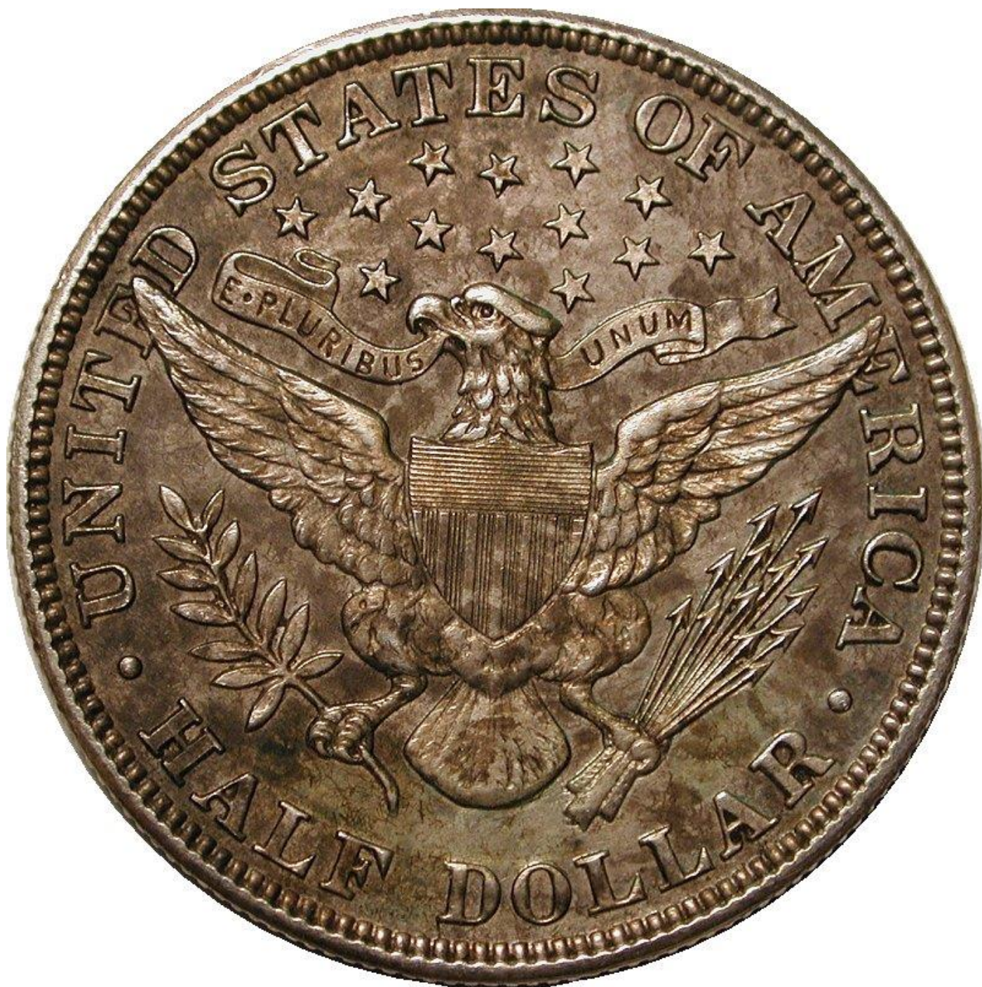
The reverse of the 1914 half

I received the coin about 5 days after auction and was very pleased with its sharp detail and patina! I estimated the grade to be at least AU-55. I promptly put the coin in my Dansco album and marked it off my "Need" list.