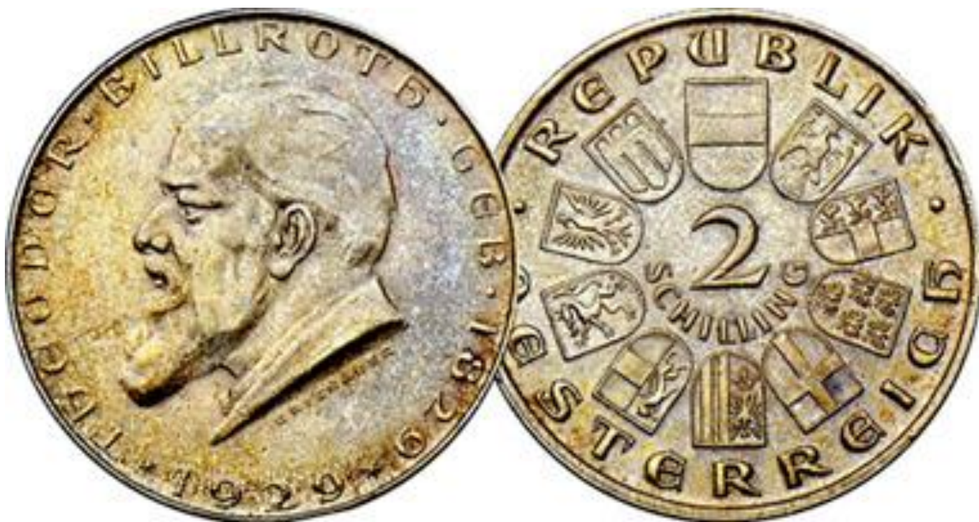
The 1929 Austrian Two Schilling Commemorative