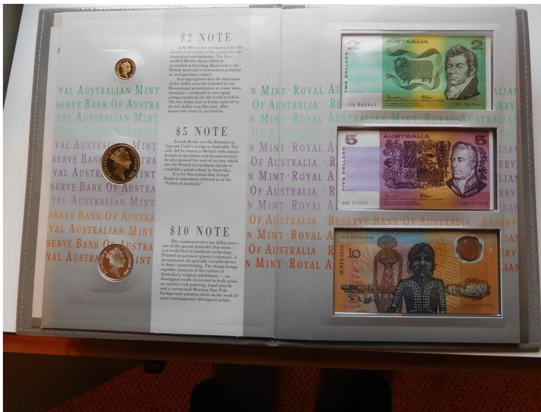
1988 Australian Special Commemorative Coins and Bank Notes Collection I got in Sydney