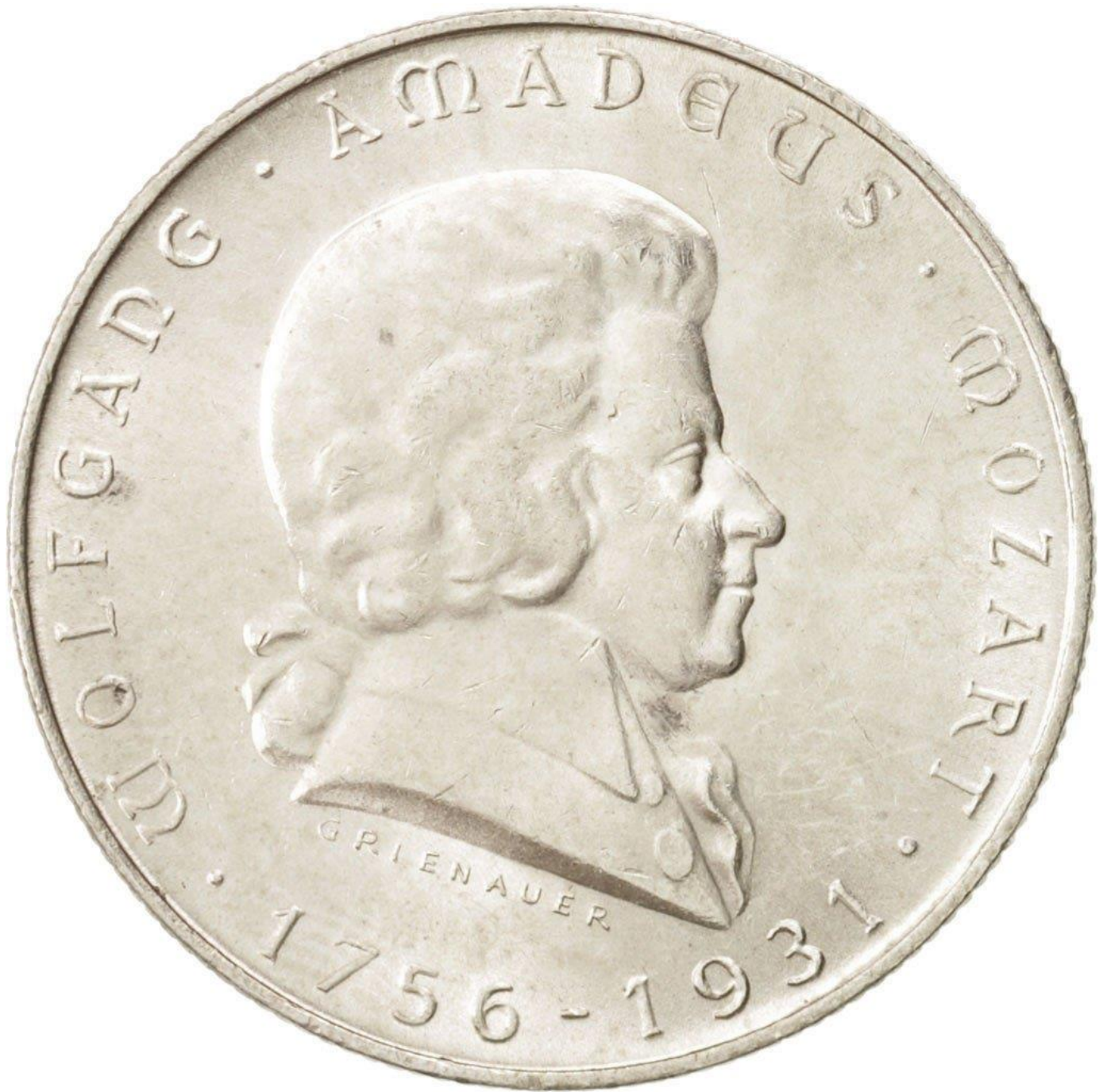
The 1931 Austrian Two Schilling Commemorative was issued for the 175 th anniversary of Mozart's birth.