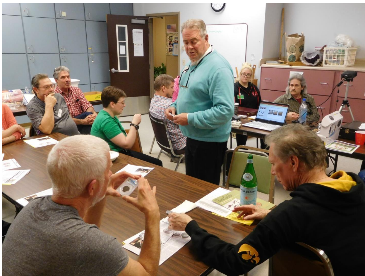
Governor Ellsworth during his presentation showing copper coins to the group