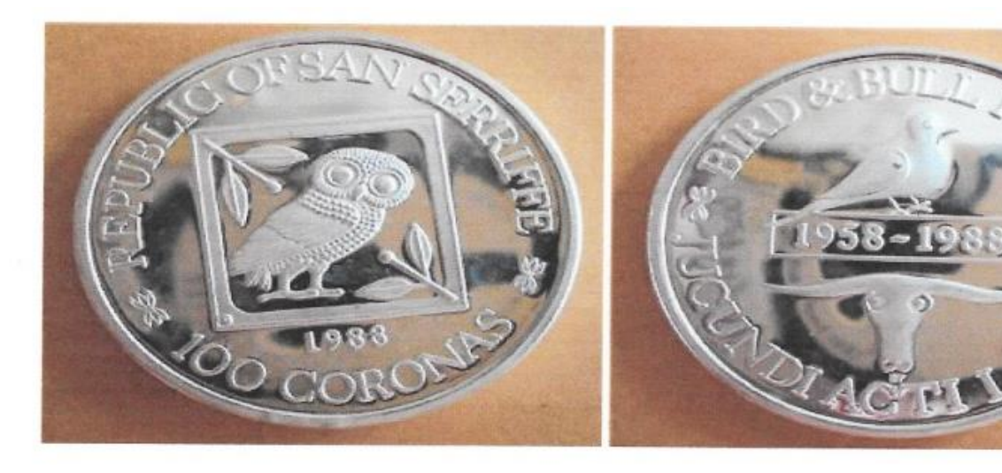
100 CORONA .999 SILVER COIN

So if you want to have fun at a large coin show, see if you can find any San Serriffe currency and the silver coin.