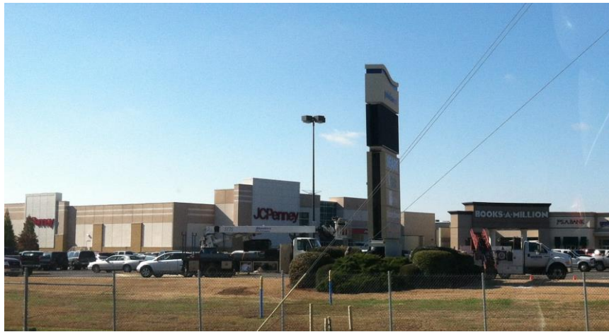
The Gadsden Mall

The policeman said that the robbers had evidently been watching me as I left the show and saw me place the briefcase behind the driver's seat. It all happened so fast. I was stunned. This was the first time I had ever been robbed and I was getting mad.