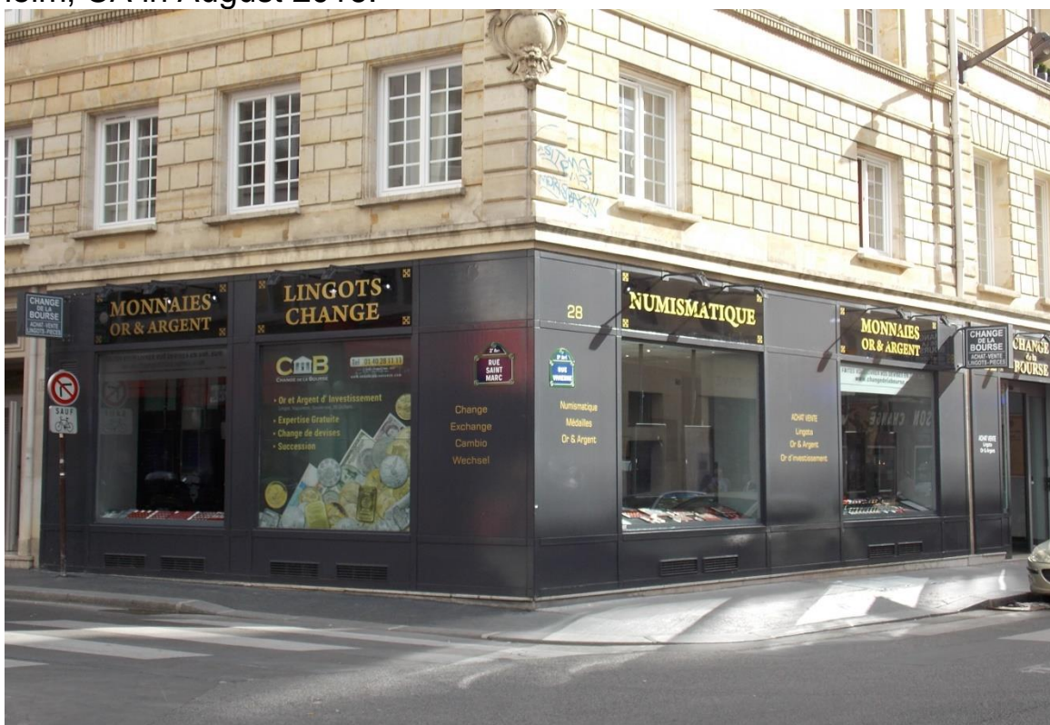
Numismatic Shop in Bourse Area of Paris Many numismatic items were displayed in the windows.

The largest coin gallery in Paris is cgb.fr, located at 36 rue Vivienne. cgb.fr is an ANA member, and employees attend ANA coin shows in the U.S. We spoke with one who attended and worked at the companies tables at the World's Fair of Money in Anaheim, CA in August 2016.