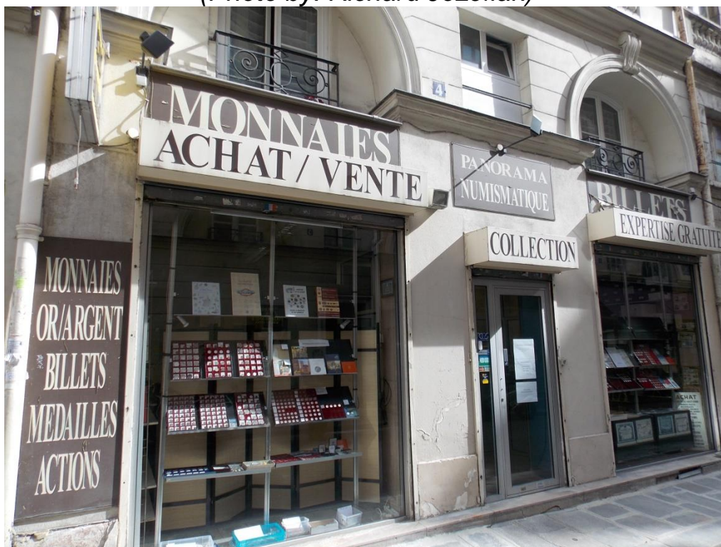
Numismatic Shop in Bourse Area of Paris

Language was not a problem. The coin shops that the author visited had employees that spoke English, and the coin shops visited took credit cards. All prices were in Euros, and a calculator was handy to convert to U.S. dollars for comparison.