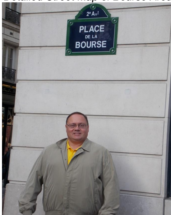
The author on Place De La Bourse in Paris, France