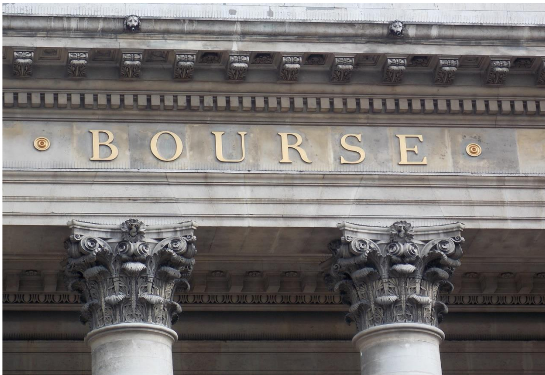
Palais de la Bourse, the name of the building in gold