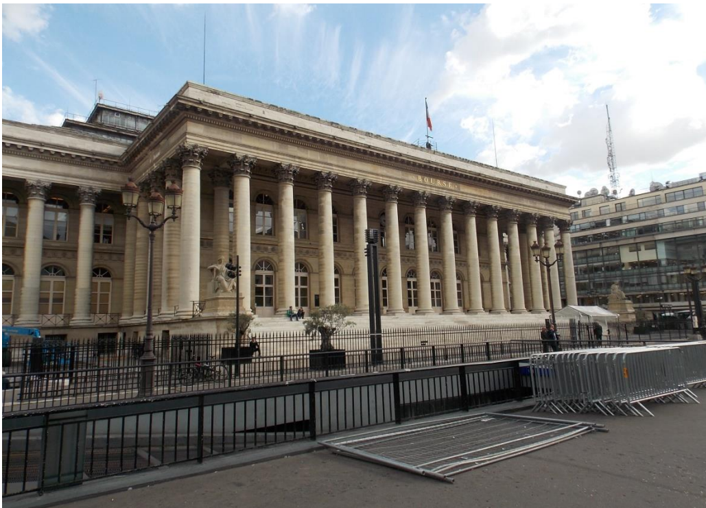
Palais de la Bourse, located in the Opera Quarter of Paris, France A number of security fences surround the building

The author and his wife had the opportunity to go to Paris, France in September 2016. We spent an afternoon to track down the Bourse building and see what coin shops were in the area. A friend in Paris was very helpful to identify for us the area we should visit.