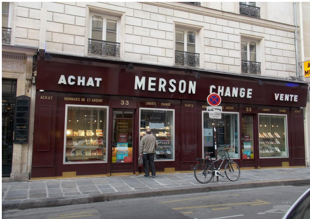
Numismatic Shop in Bourse Area of Paris