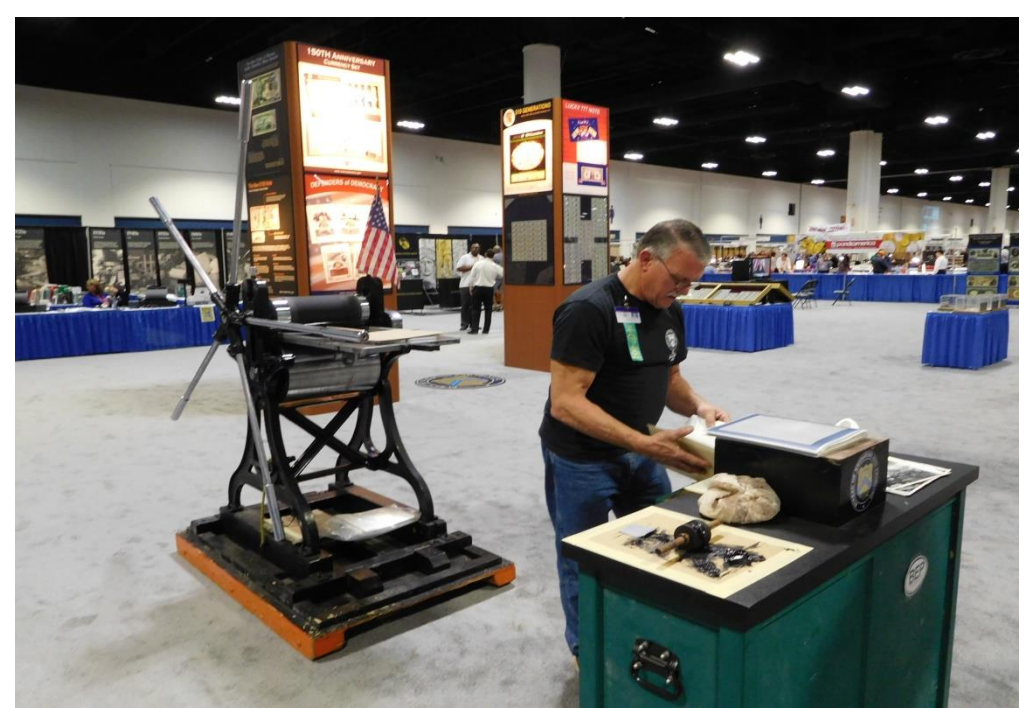
The United States Bureau of Engraving & Printing (BEP) had a large exhibit area. A printer used the spider press to produce souvenir cards (100 total) for the F.U.N. Convention. These were only available by entering and attending drawings held during the convention. A winning ticket allowed a person to buy the intaglio souvenir card for $50.