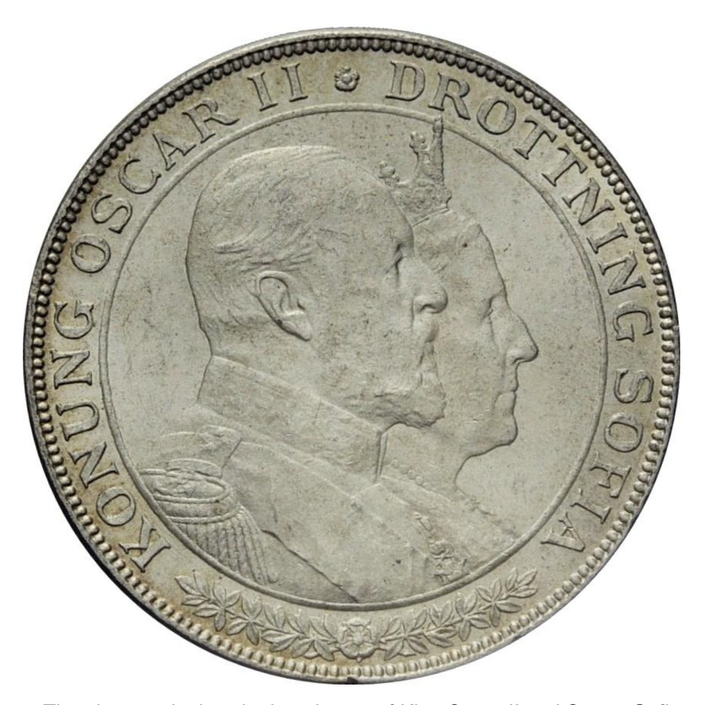
The obverse depicts the bust image of King Oscar II and Queen Sofia.

The mintage of this Stockholm-struck coin was 251,000. Nicely preserved examples are still very moderately priced.