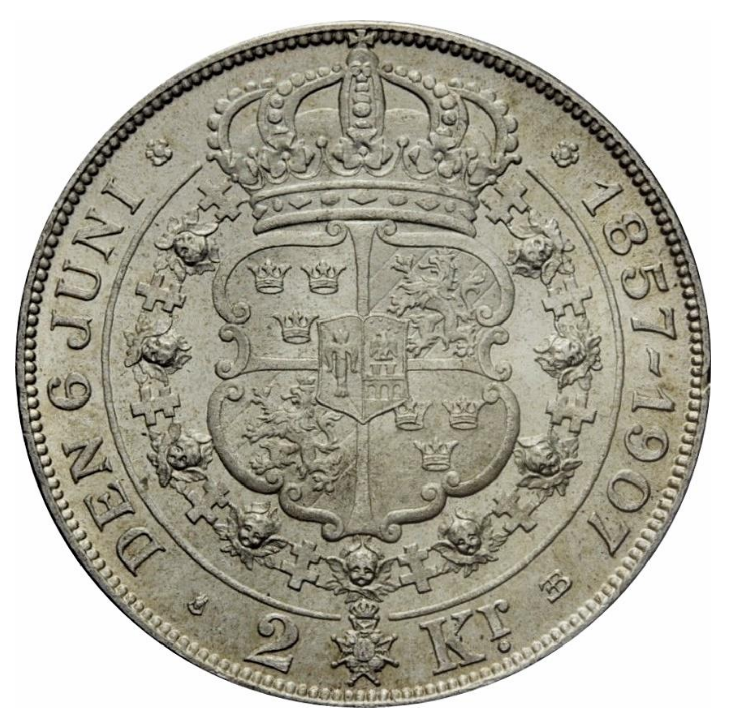
The reverse depicts the Swedish crowned arms within order chain.