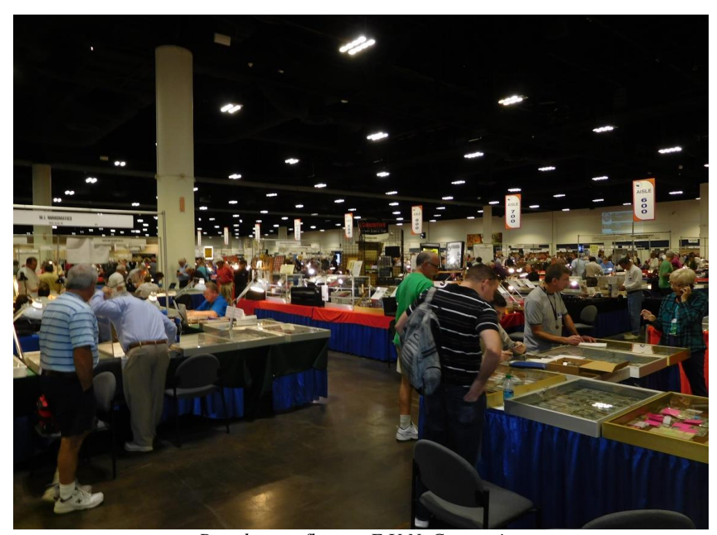
Busy bourse floor at F.U.N. Convention