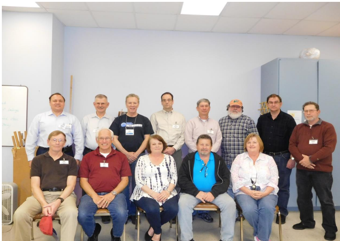
MCCC Members at 15 th Anniversary Celebration