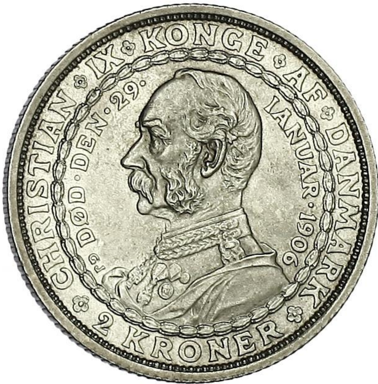
The reverse of the 1906 Danish 2 Kroner depicts King Christian IX