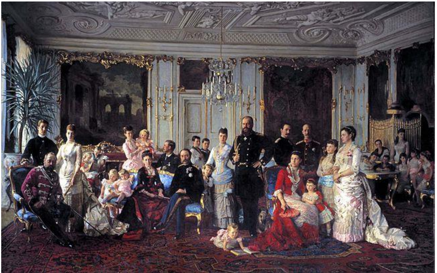
Christian IX with family gathered in the Garden Hall of Fredensborg Palace in 1883 by Laurits Tuxen

In many ways Frederick VIII was a liberal ruler who was much more favorable to the new parliamentary system than his father had been. Because of his very late accession to the throne he had only a few years to show his ability and he was weakened by ill health.