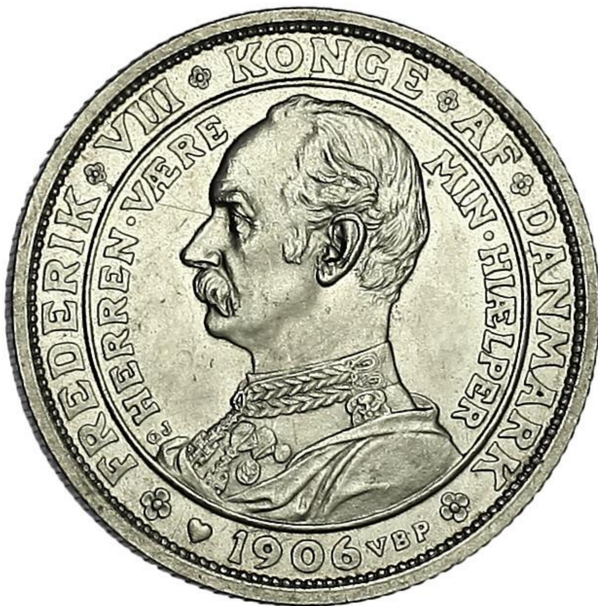
The obverse of the 1906 Danish 2 Kroner