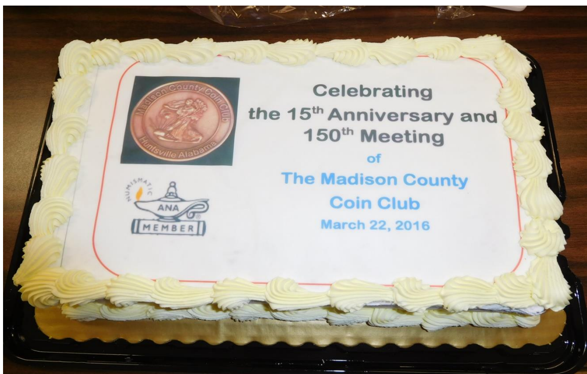
Special Cake to Celebrate the 15 th Anniversary and 150 th Meeting

I gave the program for the evening "15 Years of the Madison County Coin Club". The club has issued a number of collectables over the years, and these were on display. A special cake to celebrate the event was cut. Photos from the past 15 years were shown.