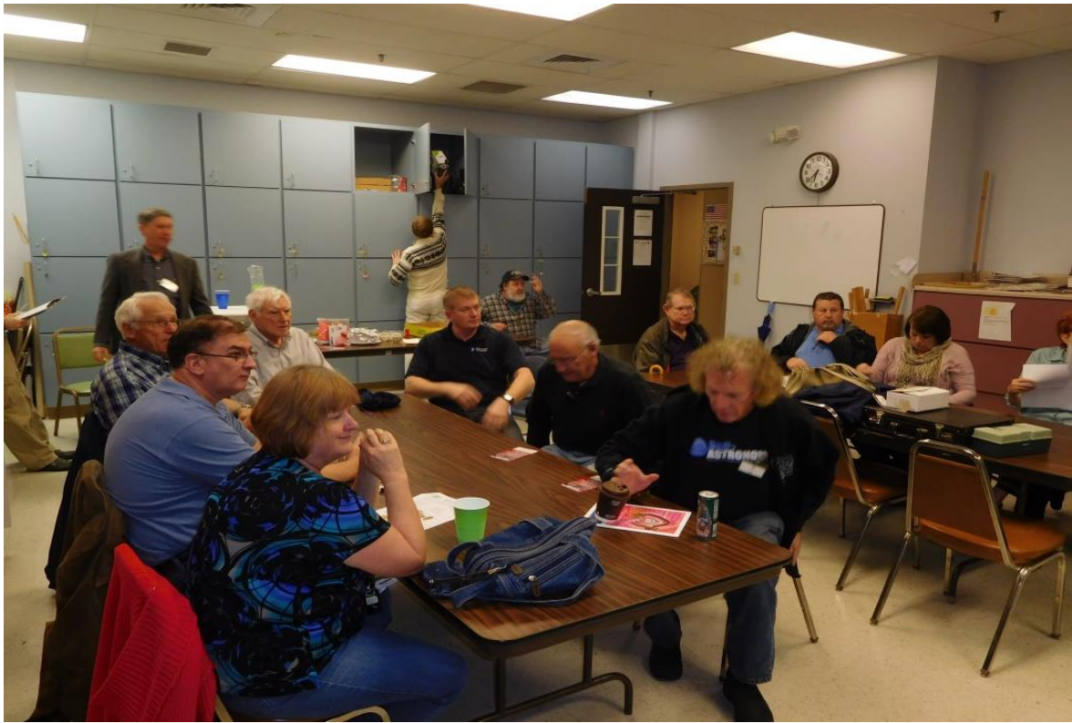
Members at the February 23 meeting