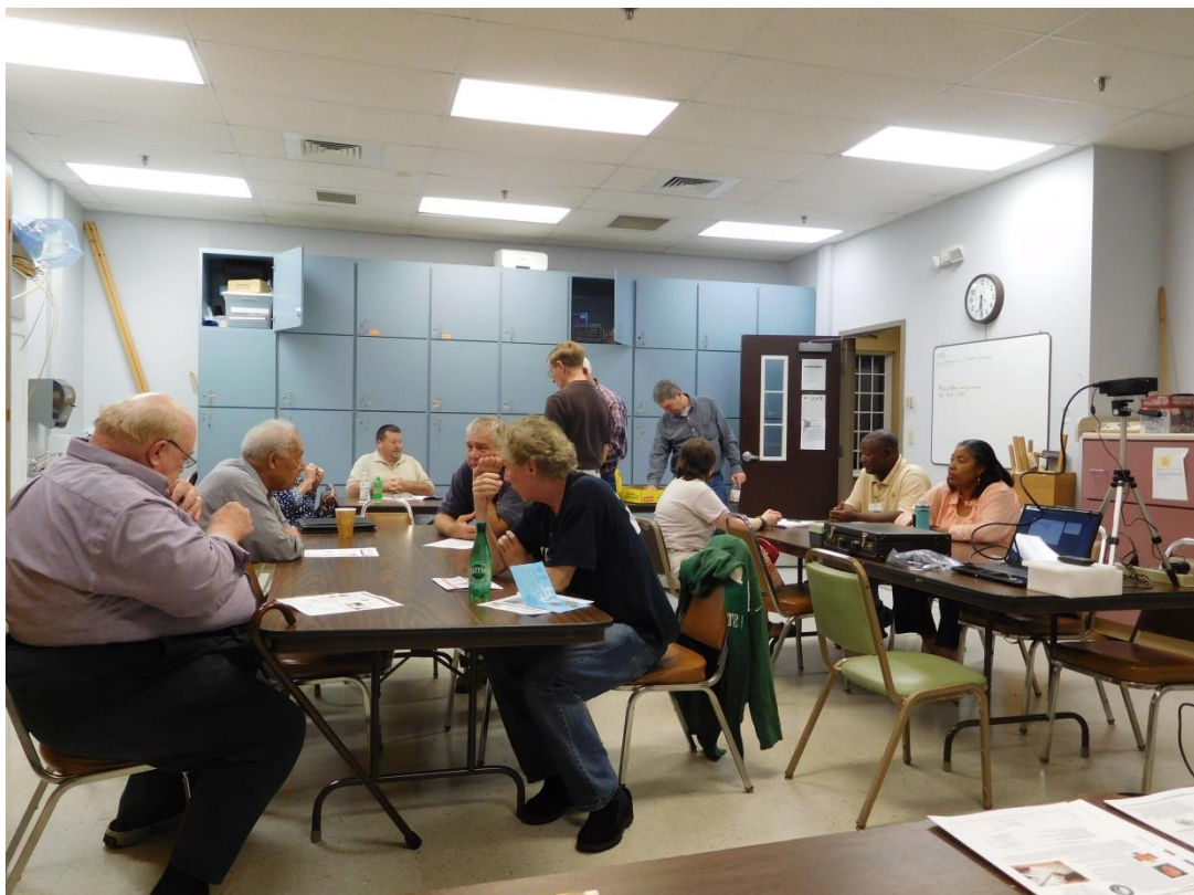
Club Members at the October 25 meeting