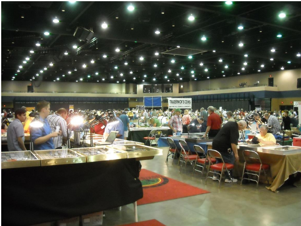
Busy bourse floor