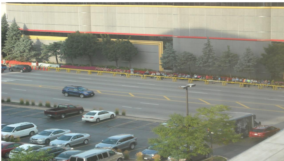
People waiting at the Convention Center to buy one 2014 Kennedy Proof Gold Half Dollar

There were Rosemont Police (paid by the ANA) to keep order outside of the convention center. People in line were not allowed to leave the line and return. The U.S. Mint only sold 500, 2014 Kennedy Proof Gold Half Dollars per day, and there were many more people in line than this. Due to safety and security reasons, the ANA withdrew permission for the U.S. Mint to sell the 2014 Kennedy Proof Gold Half Dollars on Friday and Saturday.