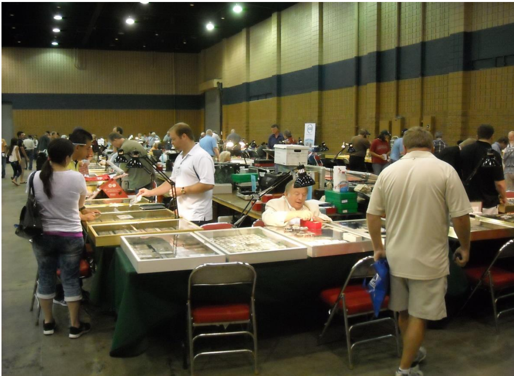
Busy bourse floor