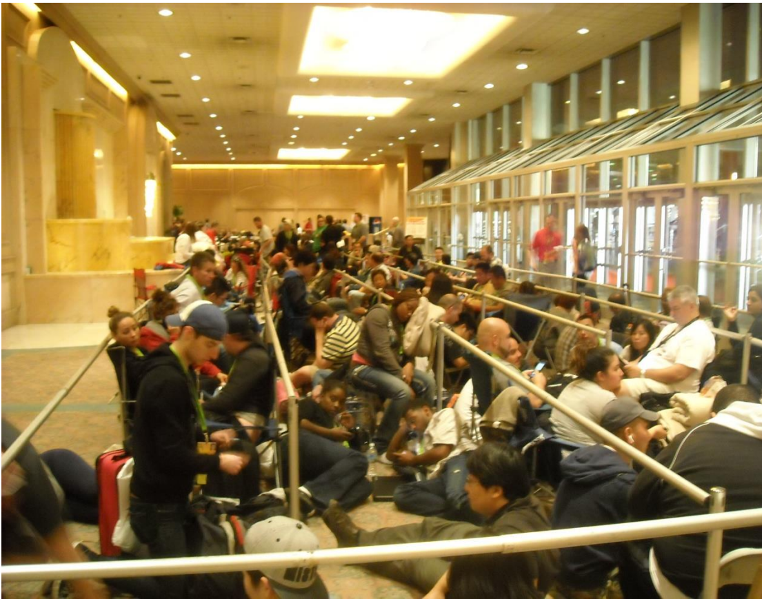
The 500 people that made it into the Convention Center on Thursday, August 7 at 8 am

On Thursday, August 7 at the 4 pm ANA Awards Presentation, Member & Donor Reception, I was honored to receive the 2014 Adna G. Wilde Jr. Memorial Award for Excellence. The award states: