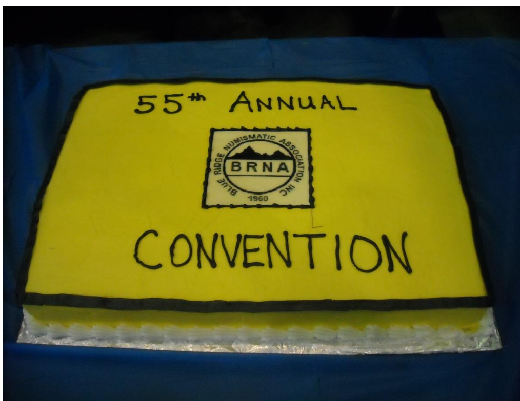
Anniversary cake cut at show opening, 10 am on August 15