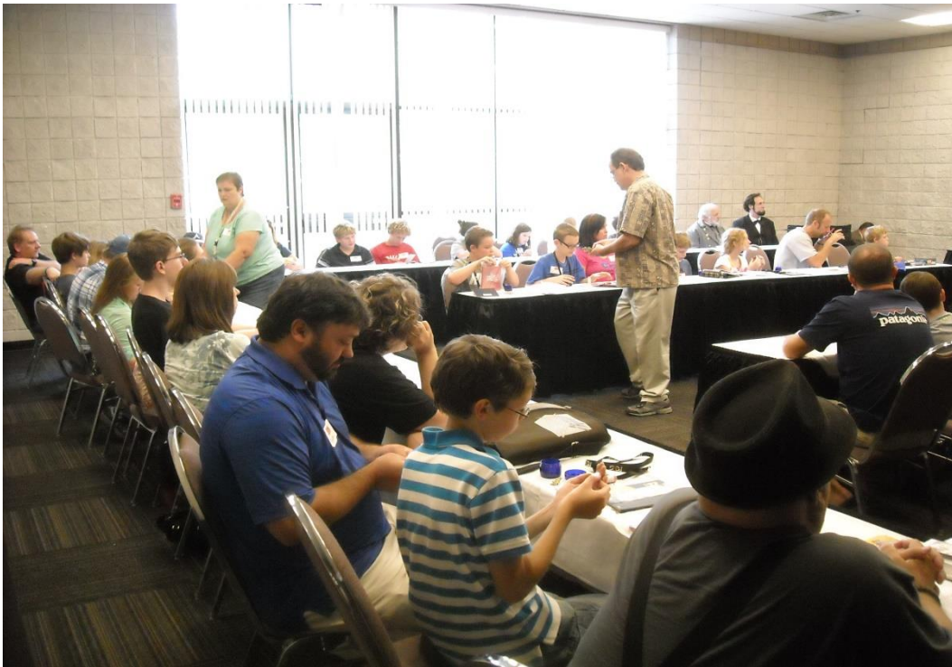
YNs receiving numismatic items during YN Program