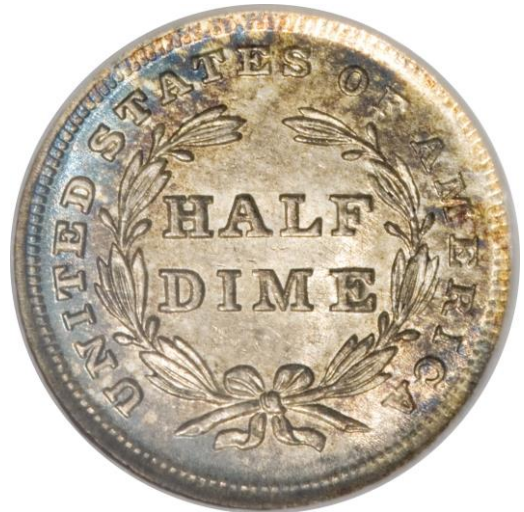
An 1833 half dime

Please bring a coin, medal, note, or something for Show- and-Tell.