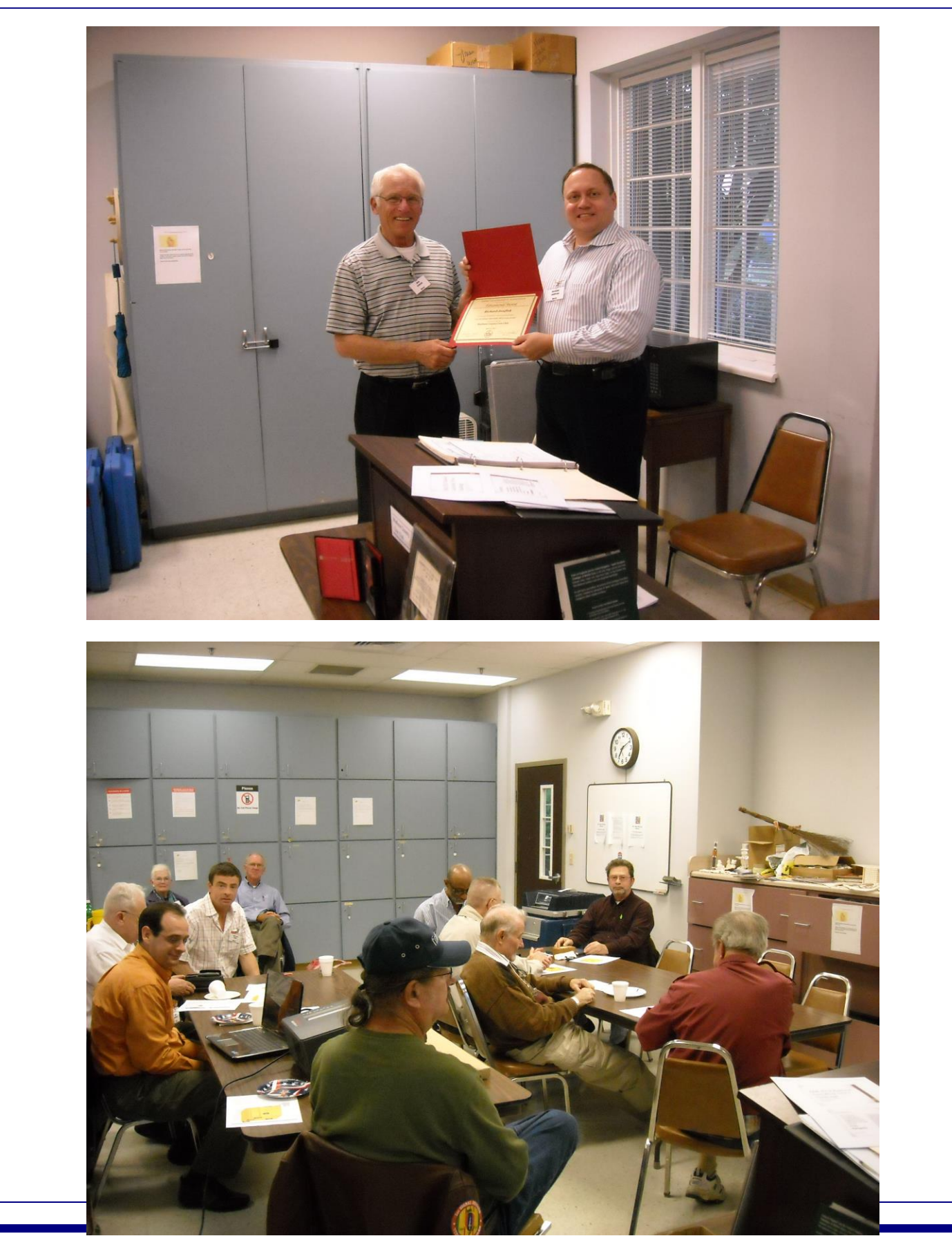
Some Scenes from the Last Meeting