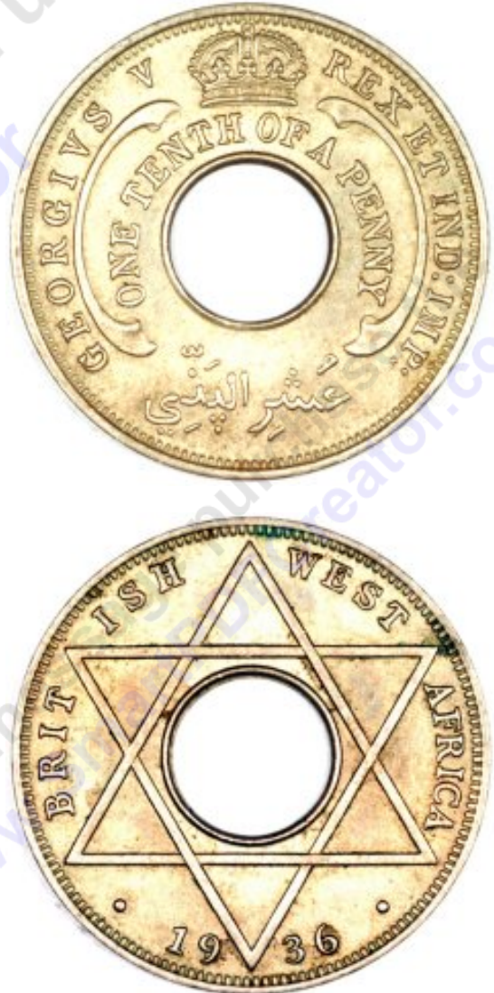
A 1936 1/10 th of a penny from British West Africa

February is British Commonwealth coin month. So whether if you wish to trade, sell, or buy some shillings, florins, or half crowns, the coin club's February meeting is the place to be!