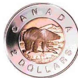
2 Dollar Coin "Toonie"

Looking for numismatic information concerning the Island of Jersey, Channel Islands. Especially interested in magazine or newspaper articles. Contact: Harold at hkfears@knology.net or 256-881-6268.