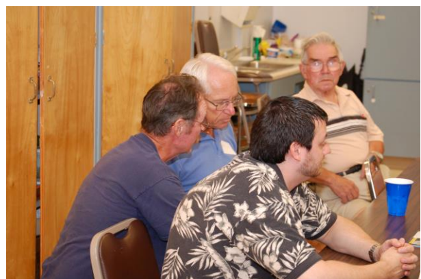
The gang in 2007