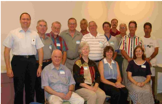
Group photo of members attending 25 th meeting.