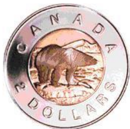
2 Dollar Coin "Toonie"

Looking for circulated contemporary Canadian coins. Also have a few available, including some older items. Contact: Mike at mcampbell7@juno.com