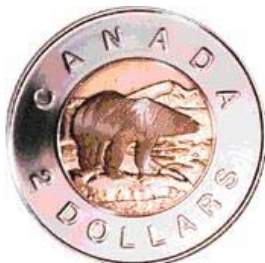
2 Dollar Coin "Toonie"

Looking for numismatic information concerning the Island of Jersey, Channel Islands. Especially interested in magazine or newspaper articles. Contact: Harold at hkfears@knology.net or 256-881-6268.