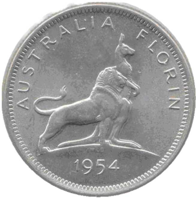
The reverse depicts a lion and a kangaroo

Prior to this issue, the legend on the 1953 florins was "ELIZABETH . II. DEI. GRATIA. REGINA +". The deletion of the religious title F:D: (Defender of the Faith) caused such controversy that the obverse legend was changed to: "ELIZABETH. II. DEI. GRATIA. REGINA. F: D: +"