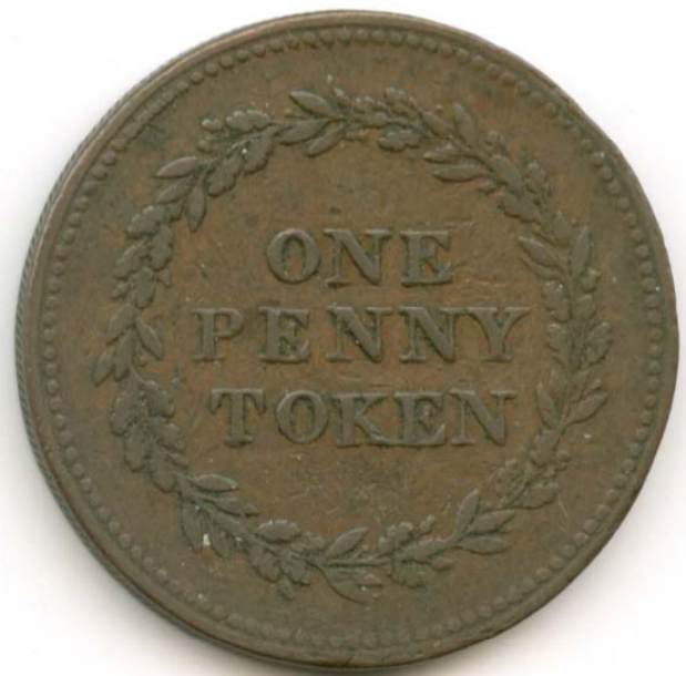
The reverse of the Jersey Guernsey and Alderney/Wreath penny token