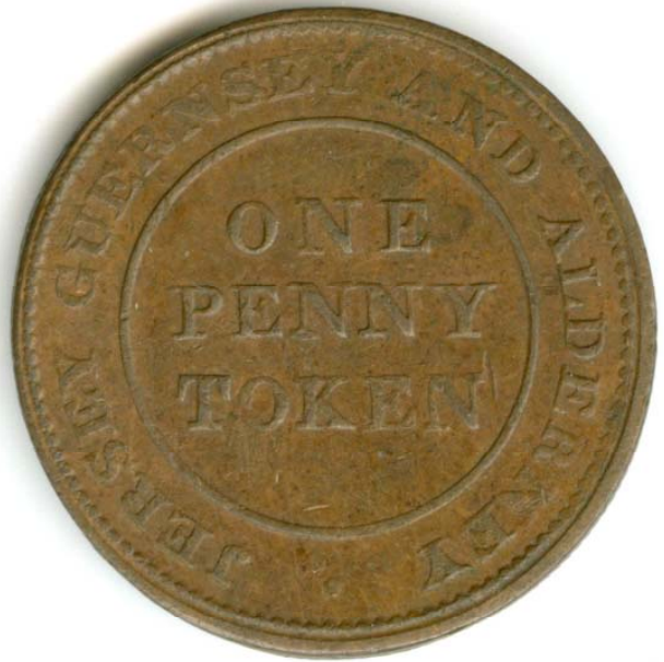
The obverse of the Jersey Guernsey and Alderney/Wreath penny token

If the Huntsville City Schools are closed due to inclement weather, then the Huntsville Senior Center is closed. There will be no club meeting if the Huntsville Senior Center is closed. Local TV and radio stations will give notice of any Huntsville school closure.