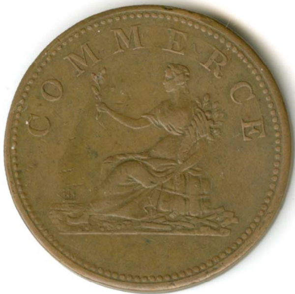
The reverse of the Druid / Commerce token

Next month, we will wrap up the series. ■