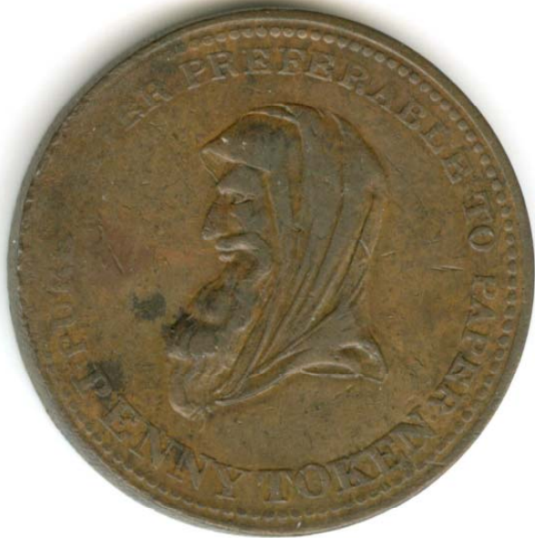
The obverse of the Druid / Commerce token