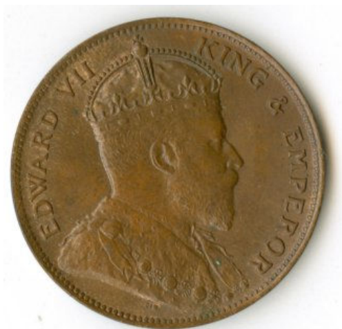
The obverse of the one twenty fourth of a shilling

The reverse of each coin features the same design as the one appeared during Queen Victoria's reign.