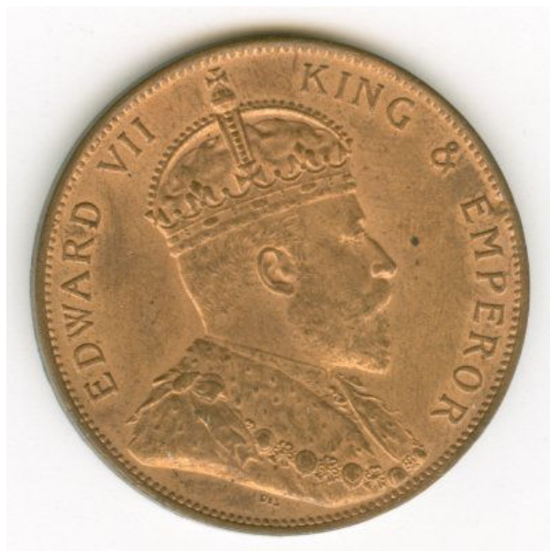
The obverse of the one twelfth fourth of a shilling