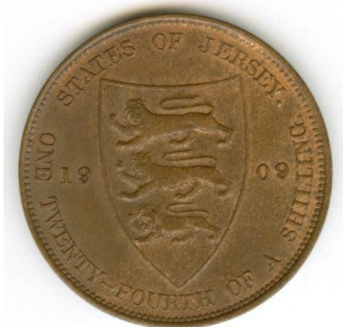
The reverse of the one twenty fourth of a shilling