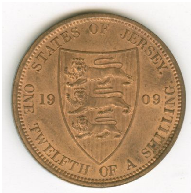
The obverse of the one twelfth fourth of a shilling

The reverse of each coin features the same design as the one appeared during Queen Victoria's reign. Although this basic design had been used for Jersey's badge of arms for centuries, it was only in 1907 that King Edward VII gave royal permission for the Crest to be used as Jersey's official motif.