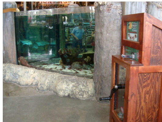
Penny Machine by Large Aquarium

This upscale shopping area has many well know stores, restaurants, and entertainment activities.