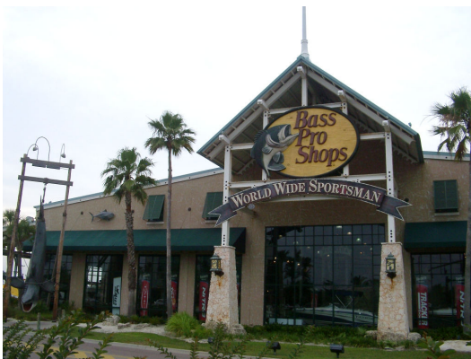
Bass Pro Shops Store at Destin Commons, FL

One such store I went to was the Bass Pro Shops, a very large fishing, sports, and clothing store. In the rear of the store is a very large aquarium, stocked with local sports fish that people catch in the area. Behind this large aquarium was a Penny Machine!