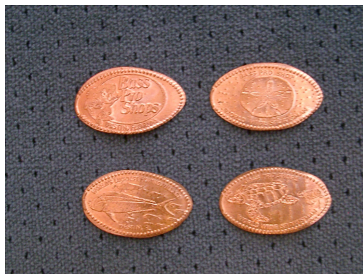
Elongate set from machine, four designs