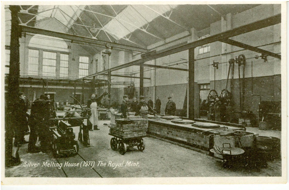
A postcard depicting the British Royal Mint's silver melting room.