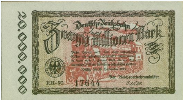
A German 20,000,000 mark note (circa 1922).

At our last meeting Dwight Maxwell's hands on presentation of inflationary notes and coins were very interesting. Dwight produced many interesting banknotes and coins from all parts of the globe. Although the banknotes have a wide range of topics, denominations, and quality, all have one thing in common – they are very inexpensive. The wide variety allows an almost unlimited choice of collecting themes and would make a wonderful addition to any collection. Why not pick up a few at the next show?