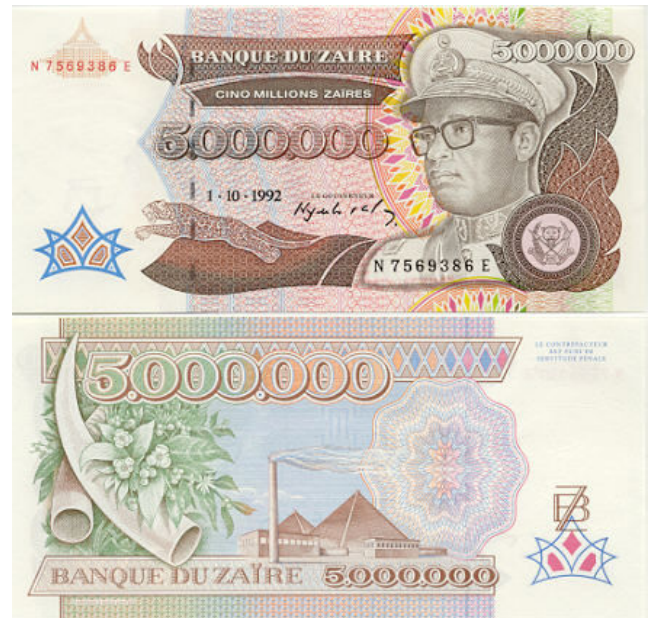
A 5 million Zaires note.