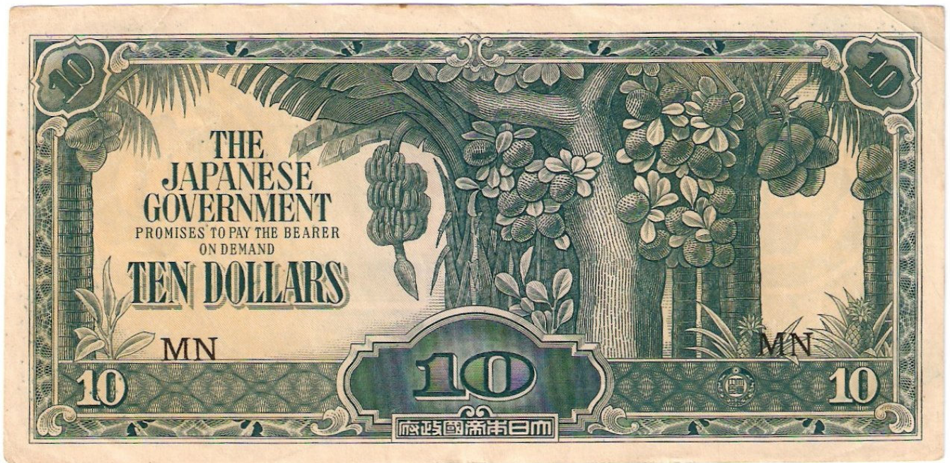
A Japanese invasion $10 note for Malaya.