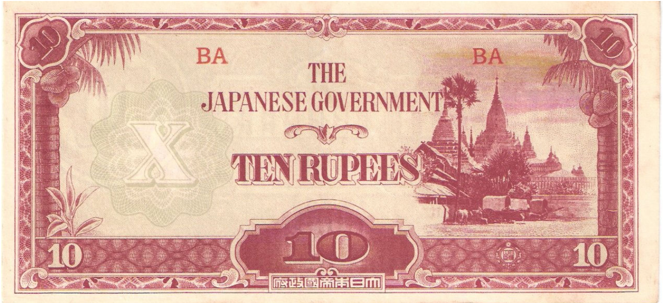
A Japanese invasion 10 rupees note for Burma.

In WWII, Japan wanted to free the Pacific of European and American influence and unite the Asian nations into a greater East-Asian co-prosperity sphere. Towards this goal, the Japanese issued "Japanese Invasion Money" (or "JIM", to create economic control of the areas it conquered. The notes were tied to the yen at par (e.g.: 1 yen=1 peso) except for the Oceania pound, which equaled 10 yen. JIM was issued for: