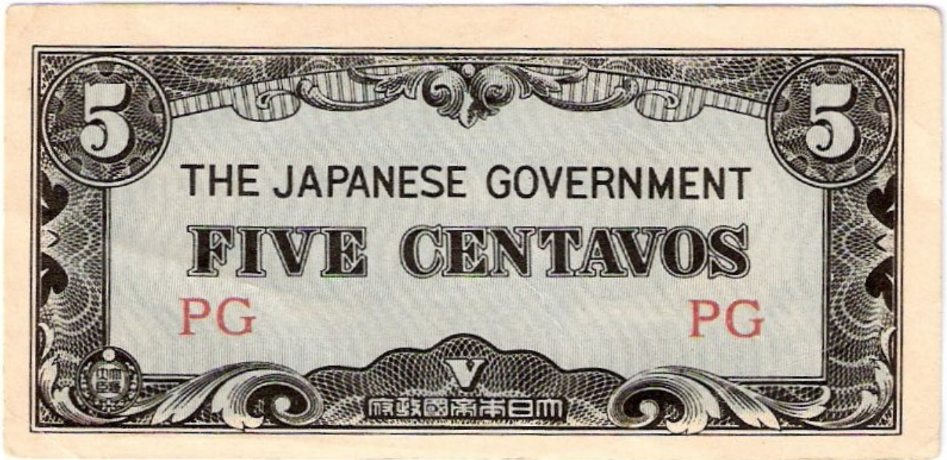
A Japanese invasion 5 centavos note for the Philippines.